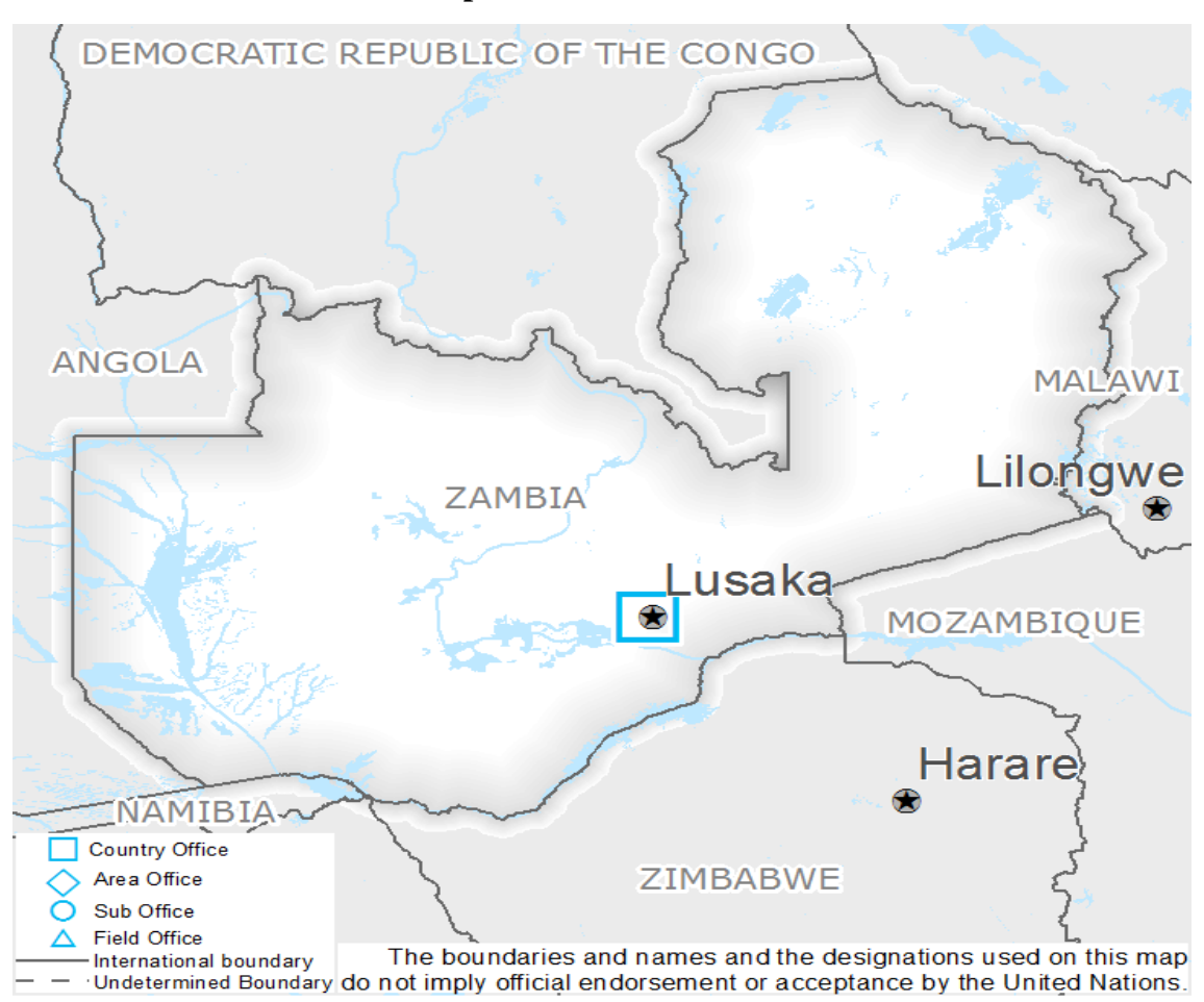
Annex 1 WFP Zambia Map

Please note that WFP Zambia does not have sub offices or field offices.