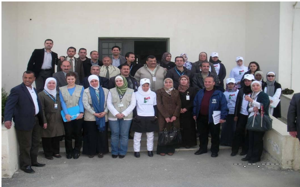
Assessment Team, Jordan July 2012

Last but not least, many thanks go to our colleagues in UNHCR, WHO, UNICEF, UNFPA, UNESCO, and WFP offices in Jordan, as without their support, preparation of the visits, sharing of background documents and providing technical advice, this mission wouldn't be carried out.