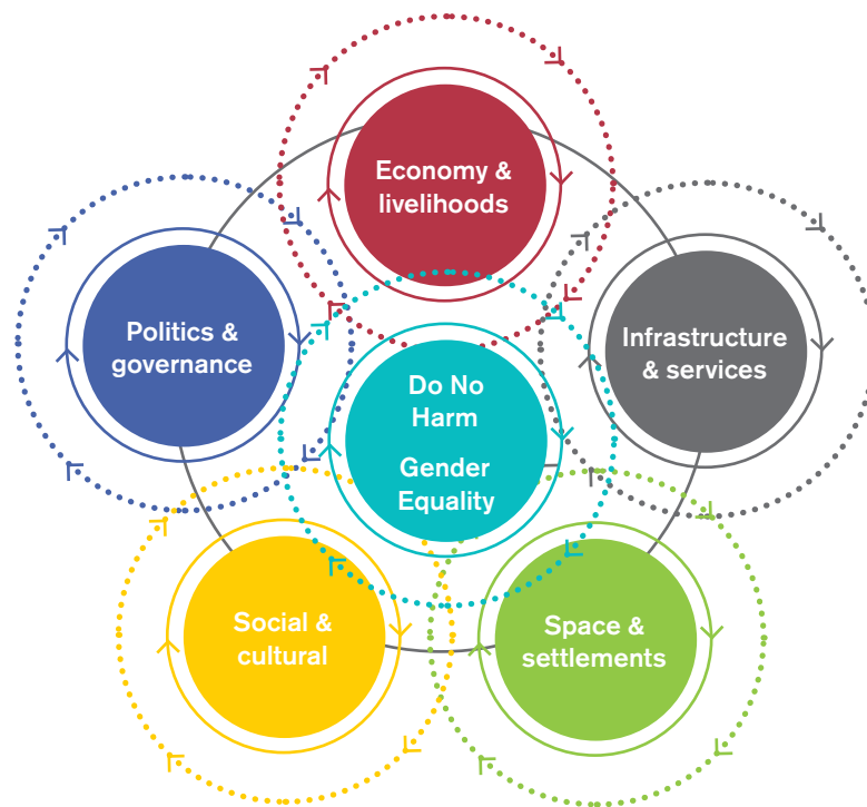
Figure 3: Typology of urban systems