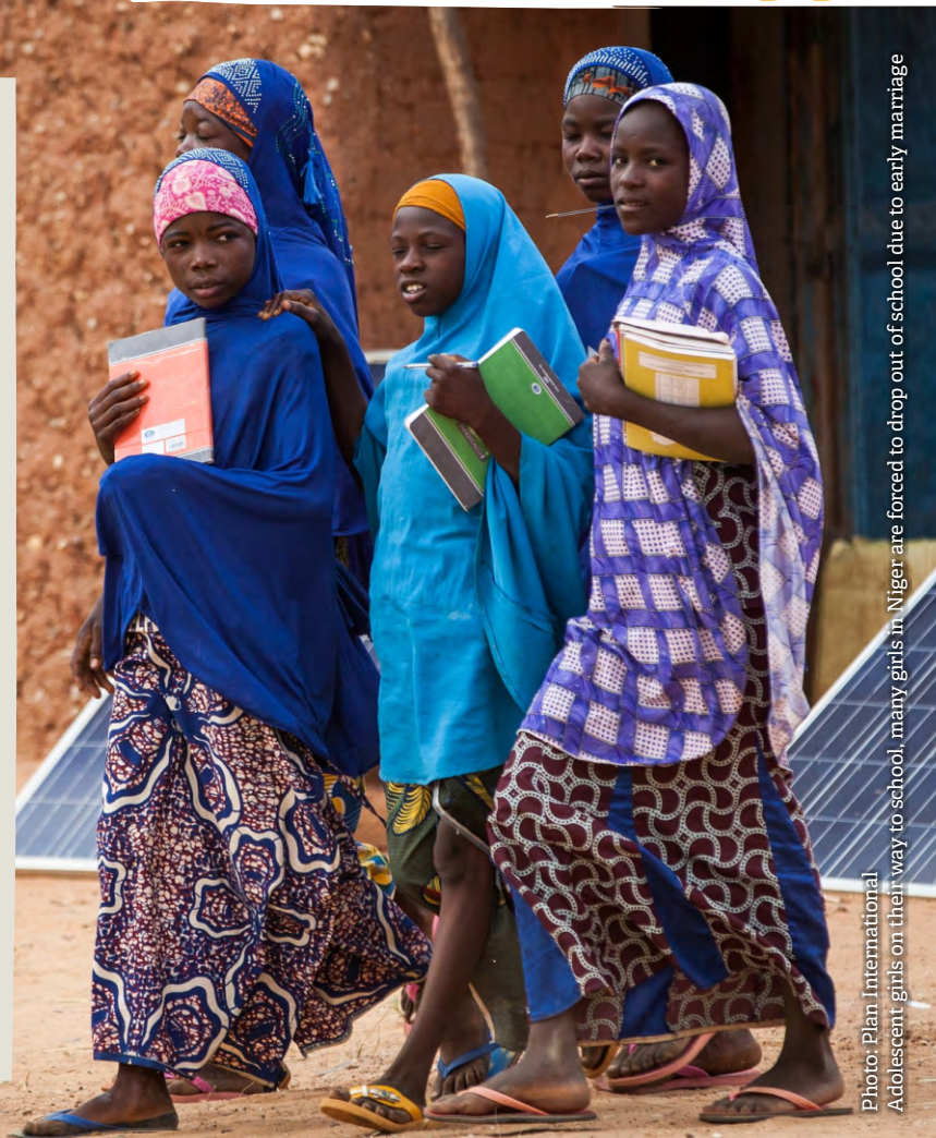
Adolescent girls on their way to school, many girls in Niger are forced to drop out of school due to early marriage