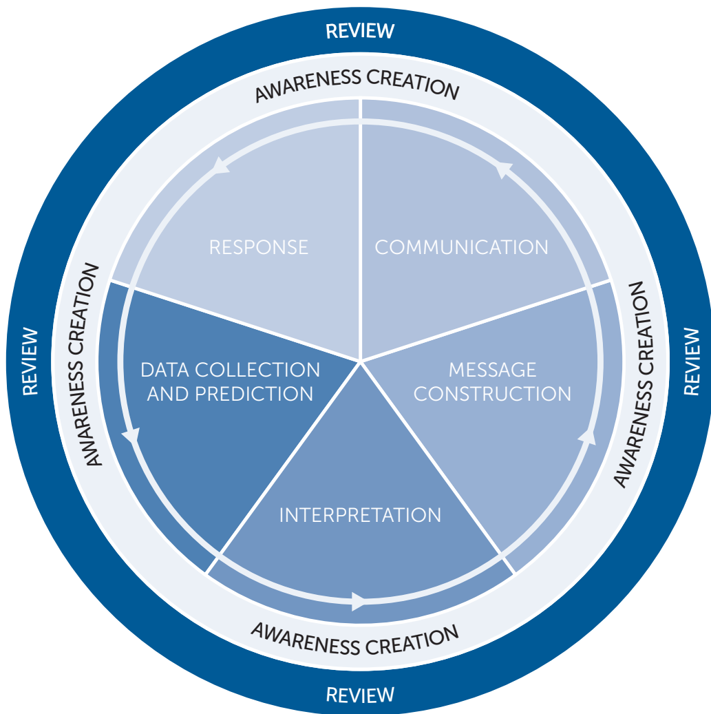
DIAGRAM 1: TOTAL FLOOD WARNING SYSTEM

While not well understood by the community, the diagram shows that flood warning systems are complex. Impacts of flooding on the community need to be reduced not just by the flood gauges and flood prediction processes but also with flood maps, flood intelligence records, flood emergency plans, flood warning message dissemination, flood education programs and other measures that complement flood warning messages.