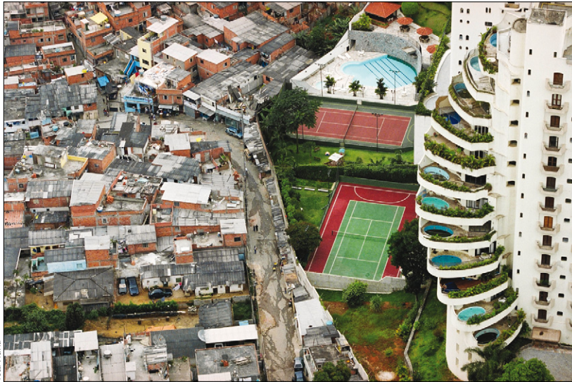
Figure 3: Socioeconomic disparities in Paraisópolis, São Paulo

The urban environment is characterised by important socioeconomic disparities and geographical heterogeneity. In Paraisópolis, São Paulo, Brazil, high-income housing is just two steps away from the favela shacks.