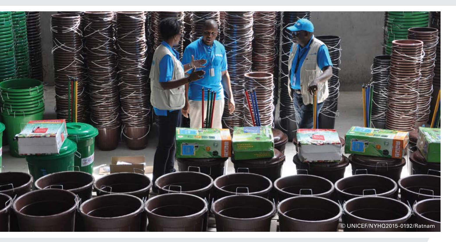
On 28 January 2015, UNICEF staff converse amid buckets and other items that are part of school infection prevention and control (IPC) kits, in a warehouse in Monrovia, Liberia. UNICEF has procured and is packaging and dispatching more than 7,000 IPC kits to over 4,000 schools in the country. The kits also contain buckets with faucets, rubber gloves and rubber boots, thermal guns, chlorine and chlorine sprayers, soap, brooms and other items for schools to implement the strict safety protocols that have been developed for the resumption of classes in the context of the Ebola outbreak.

64.2 million disability-adjusted life years (DALYs³) are attributed to unsafe water, poor sanitation and hygiene practices,⁴ of which 52.5 million (82 per cent) are in low-income countries. The burden of disease falls heavily on children, with children under 5 accounting for 88 per cent of the DALYs in low-income countries (over 46 million DALYs). Regionally, the burden of disease due to unsafe water and poor sanitation falls heavily on sub-Saharan Africa (46 per cent of global DALYs) and South Asia (34 per cent of total DALYs). The burden of disease falls heavily on children; diarrhoea is the second biggest killer of children under 5 worldwide.⁵ Each episode of diarrhoea in children contributes to malnutrition, reduced resistance to infections and