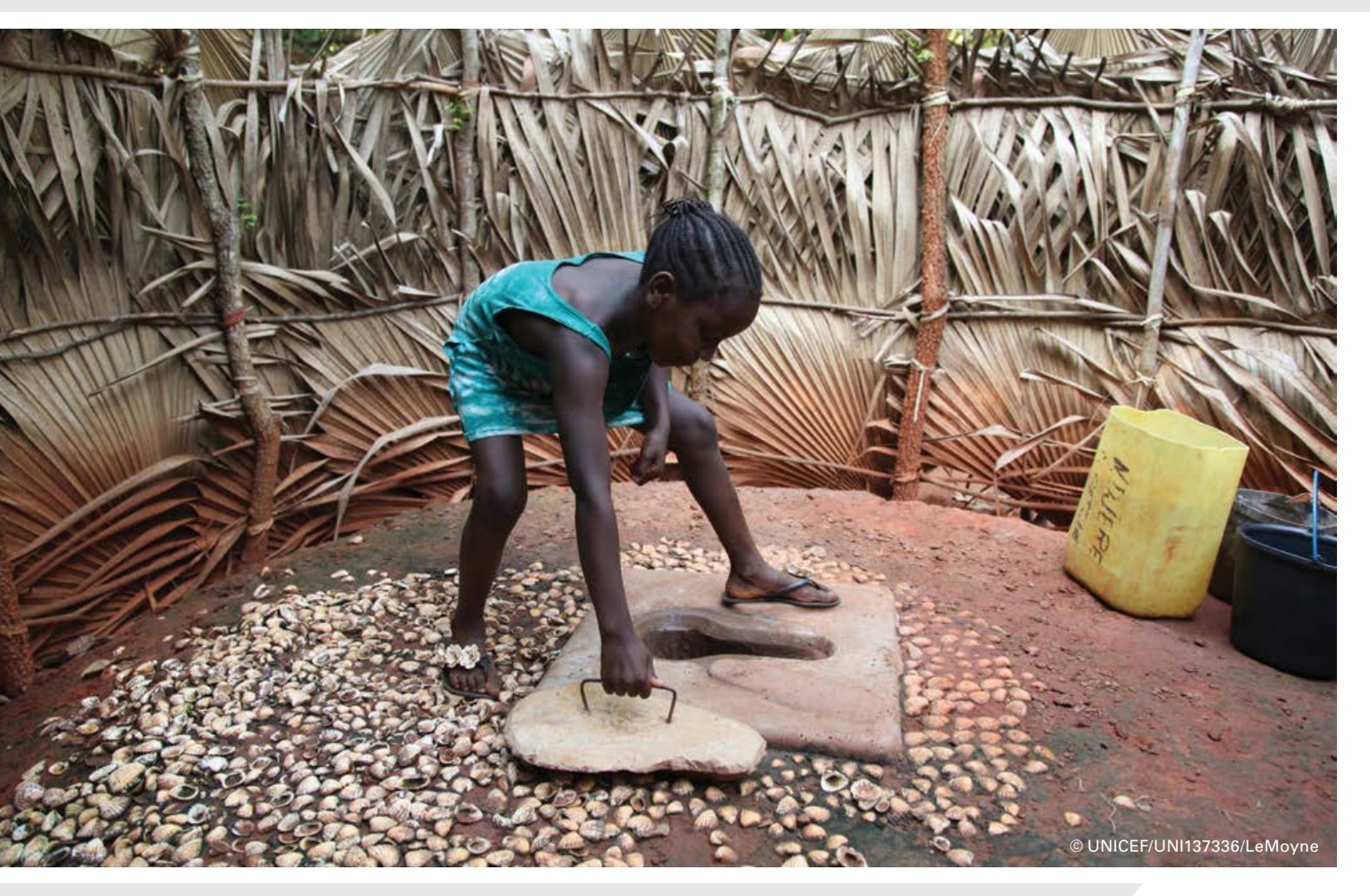
On 8 December 2012, a girl closes a pit latrine in an enclosure in a small village located between Gabú and Bafatá Regions in Guinea-Bissau. The village has achieved open-defecation-free (ODF) status, indicating that the entire village has committed to building and using latrines and has renounced open-air defecation, thereby also protecting its water supply from contamination by human excreta. Latrines, one for each extended family, as well as hand-washing stations, have been built by residents with UNICEF support.