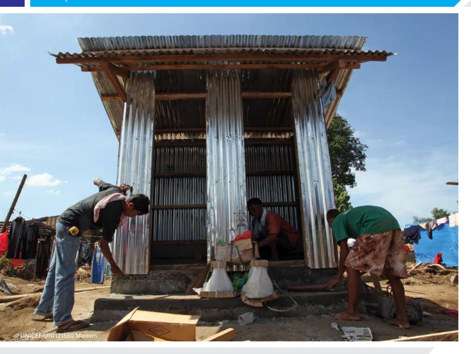
On 6 January 2012, workers build a UNICEF-funded temporary shelter for people displaced by Tropical Storm Washi, in Tibasag, a community in the city of Cagayan de Oro, Northern Mindanao Region, the Philippines.

here is good evidence that all water, sanitation and hygiene (WASH) investments can have significant health, economic and development benefits and provide excellent value for money. For every $1 invested in water and sanitation, an average of at least $4 is returned in increased productivity. Hygiene promotion is the most cost-effective health intervention.