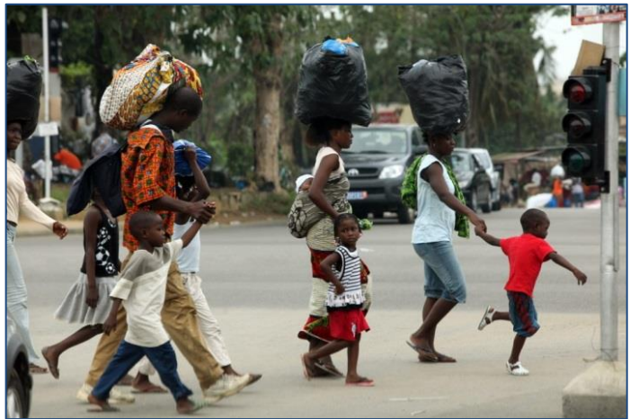
A family rushes from the Abobo neighbourhood in Côte d'Ivoire on 27 February 2011 to go to safer areas in the capital. They took advantage of the lull in the fighting that took place during the whole night to flee with their children and few belongings.

The flight of IDPs to urban areas reflects a global trend of increasing urbanization. By 2008, the proportion of the world's population living in urban areas had surpassed 50 percent and is expected to rise to more than 60 percent by 2025. 5 Nearly all of this urban population growth is expected to occur in cities and towns in developing countries, whose population is projected to increase from 2.7 billion in 2011 to 5.1 billion in 2050, with Africa and Asia experiencing the most rapid urbanization. 6