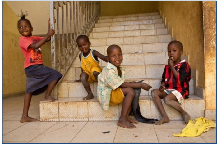
Displaced children from Douentza play in a former hotel in Mapti, Mali.

Rather than living in large camps, most of the world's 28.8 million internally displaced persons (IDPs) currently live "outside camps." 1 This rather inelegant term – "IDPs outside camps" – refers to IDPs who live in a variety of settings or situations, making generalizations difficult. They may be in urban, rural or remote areas; they may own or rent housing; they may be sharing a room or living with a host family; they may be occupying a building or land that they do not own, or living in makeshift shelters and slums or living on the streets. Many IDPs have fled to small towns and villages near their homes but increasingly IDPs are ending up in urban areas, where those who have been forced to leave their homes because of conflict, human rights abuses and disasters live side-by-side with the non-displaced poor and economic migrants. 2 While urban areas may offer opportunities for rebuilding lives, they usually present particular difficulties for IDPs seeking to find their place in a new and complex environment. Adequate housing and shelter are often in short supply, and access to public services such as education, health, water and sanitation may be more difficult for IDPs to access.