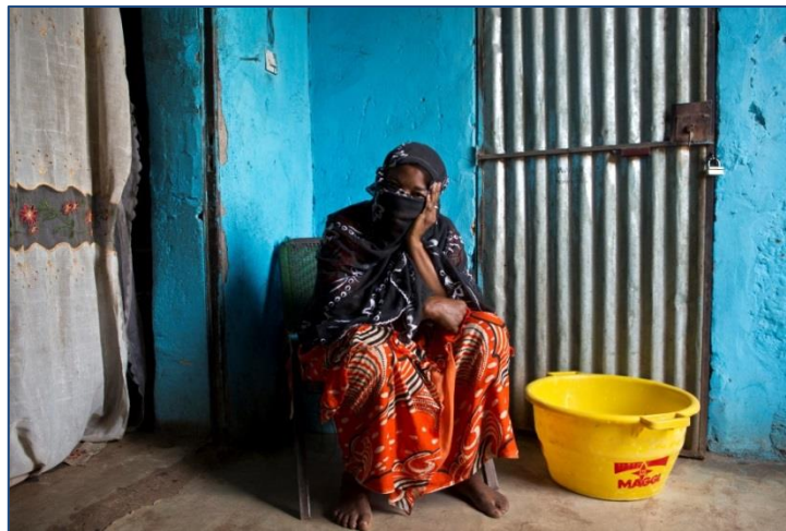
This internally displaced woman in Mali fled with her son from their home in the Gao region to Bamako after being robbed and assaulted by armed men.

The term “host community” is usually used to refer to the villages, towns and cities where IDPs who are not living in camps reside. Thus, it is frequent to refer to a dichotomy of IDPs who either live in camps or in host communities. In fact, the term “host community” is problematic in that it seems to imply a positive reception of IDPs, which cannot always be assumed, particularly when displacement becomes protracted. Moreover, the catch-all term “host community” obscures the complexity and variety of communities in which IDPs live. Often, host communities and host families may be poor or living in precarious conditions. They may lack physical security and adequate access to basic services and may have been impacted by conflict or a natural disaster as well. In other contexts, the “hosts” may be IDPs who have simply been displaced longer. For example, a Brookings-LSE Project on Internal Displacement- International Committee of the Red Cross (ICRC) in Colombia study of relationships between host communities and urban IDPs in Colombia included in the definition of “host communities” IDPs who had been displaced for more than ten years. 33