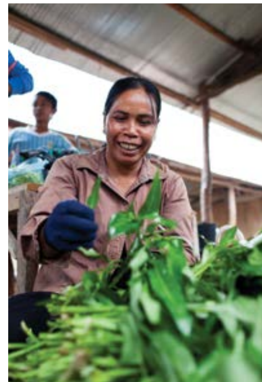
(Cambodia)

Analysis of impact in Tearfund's CCM work draws from nine project evaluations from eight countries across Africa, Asia, Latin America and the Caribbean, which are brought together to present a broad picture of Tearfund's impact through CCM.