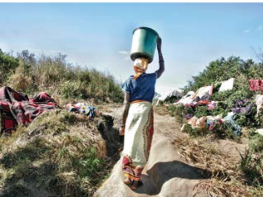
(Mozambique)