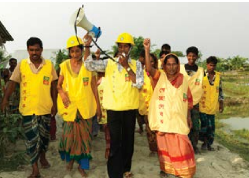
(Bangladesh)

More widely, there has been great success in alleviating poverty in the last 50 years, mainly through economic growth, yet it has been at a high cost to the planet and has caused inequality to rise. We believe it is possible to lift people out of poverty in a way, which does not cost the earth and lasts for generations to come.