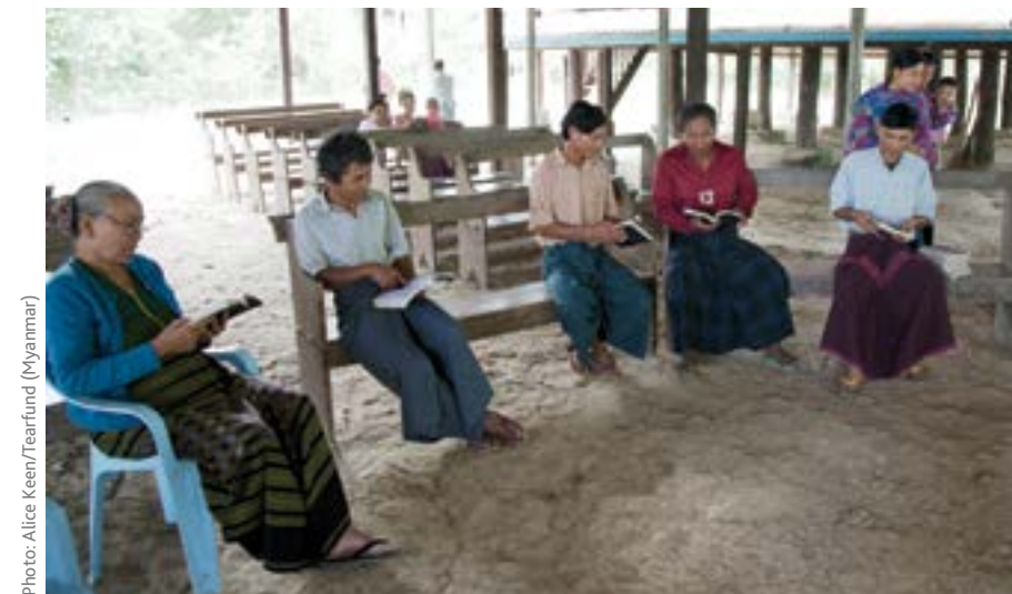
(Myanmar)