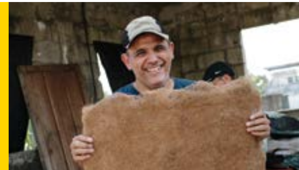
(Guatemala)