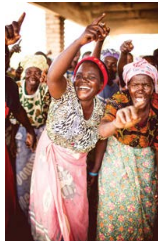
(Malawi)

Finally, the evidence and learning in this report, combined with our ongoing organisational discussions, encourage us to reflect on Tearfund's contribution to change within a dynamic and ever-changing world. We are thinking about the