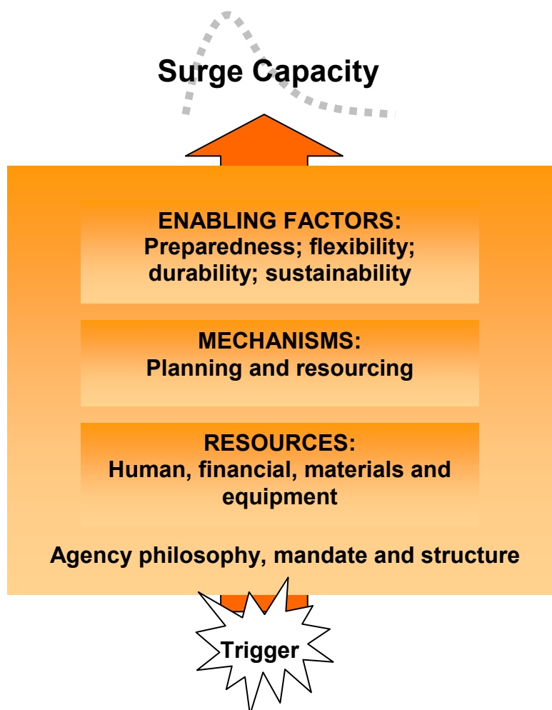
Figure 2 – Understanding surge capacity

Having arrived at a definition of surge capacity and discussed the importance of matching surge capacity to an agency's philosophy, mandate and structure, the rest of this chapter sets out a model for understanding surge capacity that will provide the framework for further analysis in the chapters that follow. This model is illustrated in Figure 2 below.