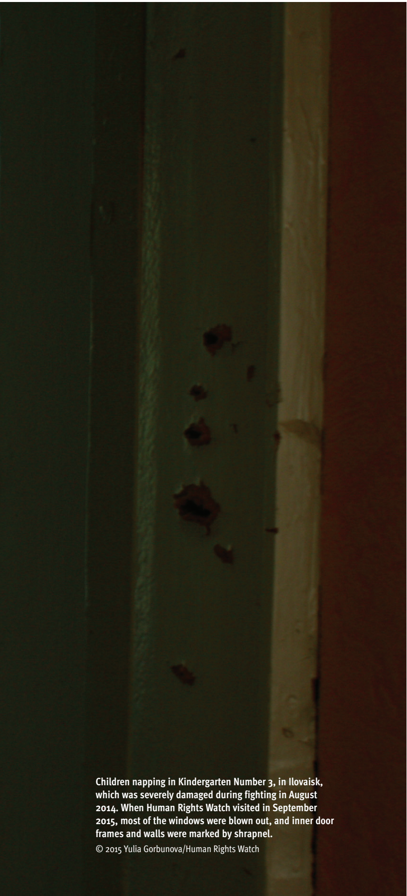
Children napping in Kindergarten Number 3, in Ilovaisk, which was severely damaged during fighting in August 2014. When Human Rights Watch visited in September 2015, most of the windows were blown out, and inner door frames and walls were marked by shrapnel.