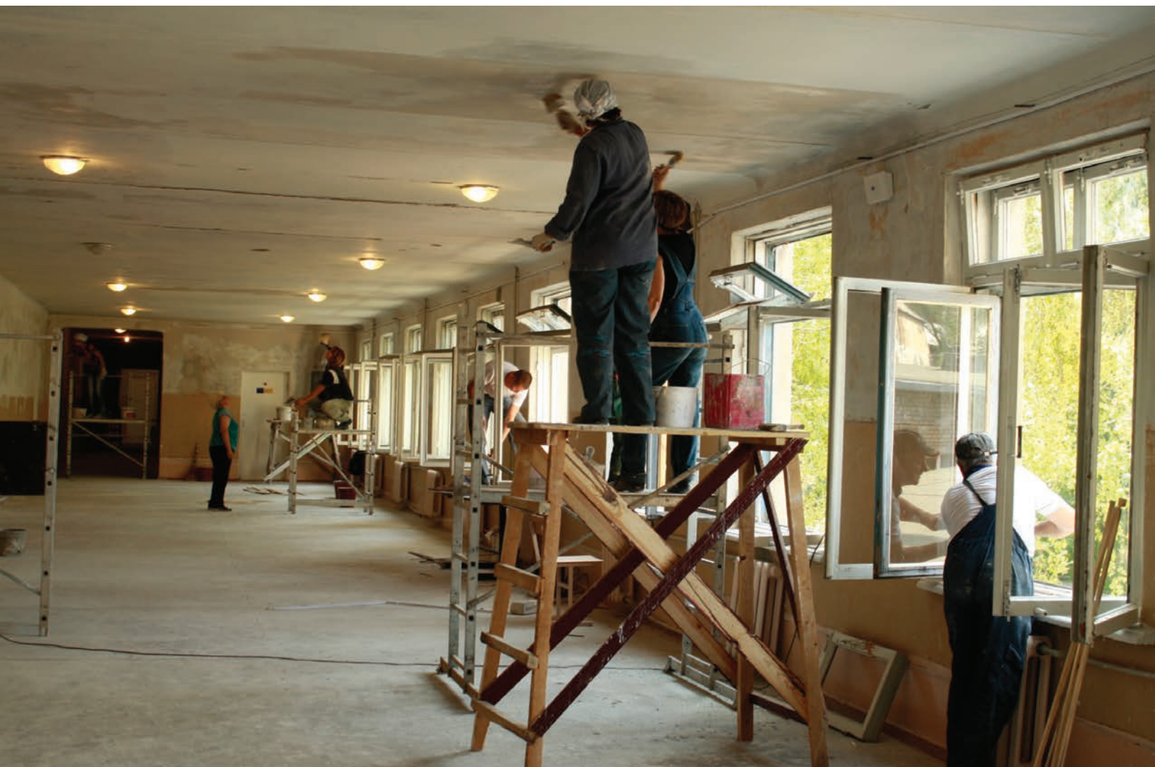
Renovations ongoing in Horlivka's School Number 14. The school was damaged in a shelling attack in August 2015