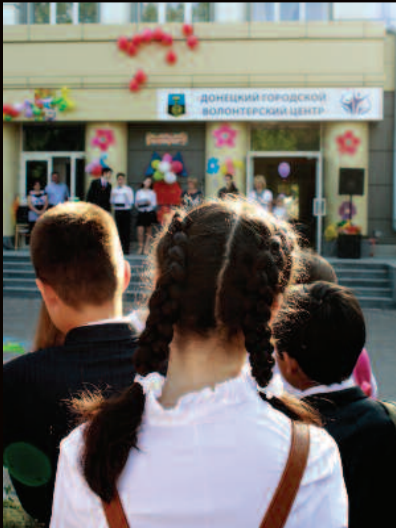
(above) The “First Bell” ceremony at School Number 2 in rebel-held Donetsk, marking the beginning of a new school year.

Human Rights Watch urges both Ukrainian authorities and Russia-backed militants to cease all attacks against schools that do not constitute military objectives and avoid deploying inside or adjacent to schools and kindergartens. Ukrainian authorities should deter the military use of schools by, among other things, endorsing the UN Safe Schools Declaration.