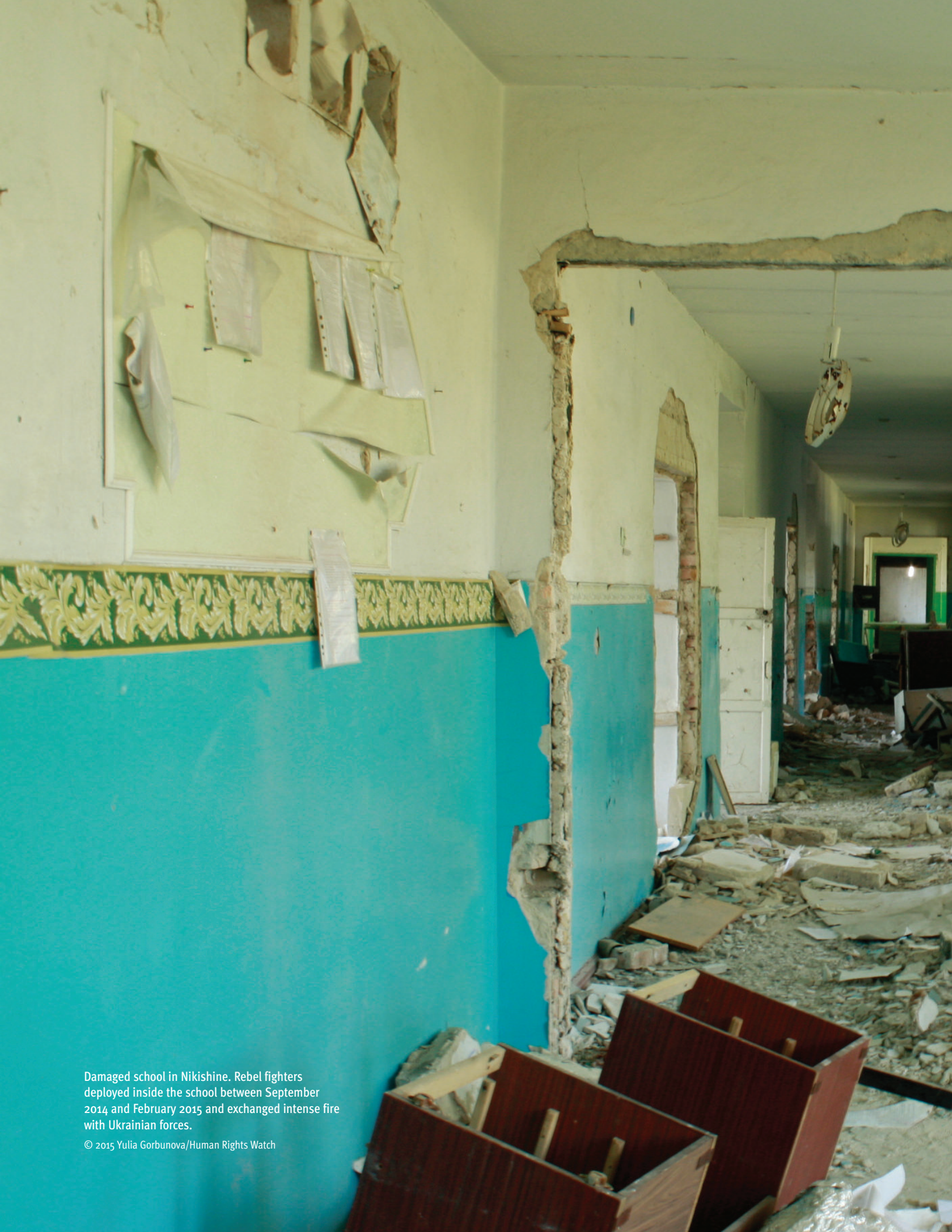
Damaged school in Nikishine. Rebel fighters deployed inside the school between September 2014 and February 2015 and exchanged intense fire with Ukrainian forces.