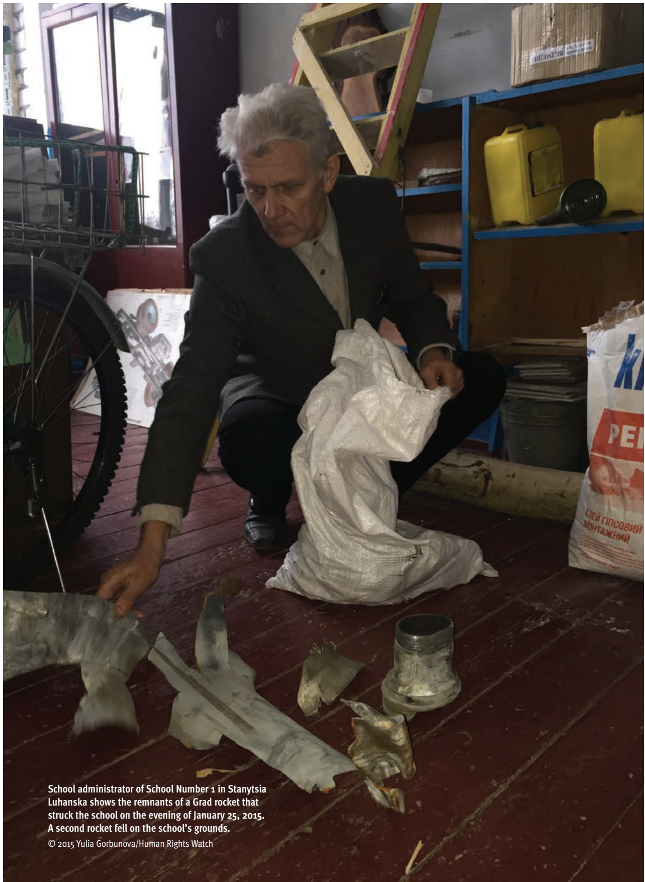
School administrator of School Number 1 in Stanytsia Luhanska shows the remnants of a Grad rocket that struck the school on the evening of January 25, 2015. A second rocket fell on the school's grounds.