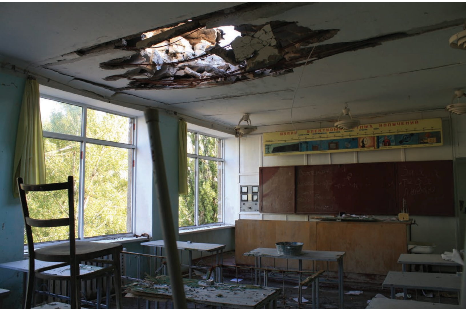
School Number 42 in Vuhlehirsk was struck six times in January and February 2015.