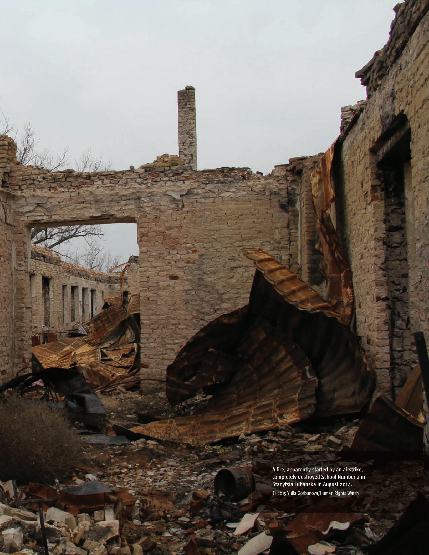
A fire, apparently started by an airstrike, completely destroyed School Number 2 in Stanytsia Luhanska in August 2014.