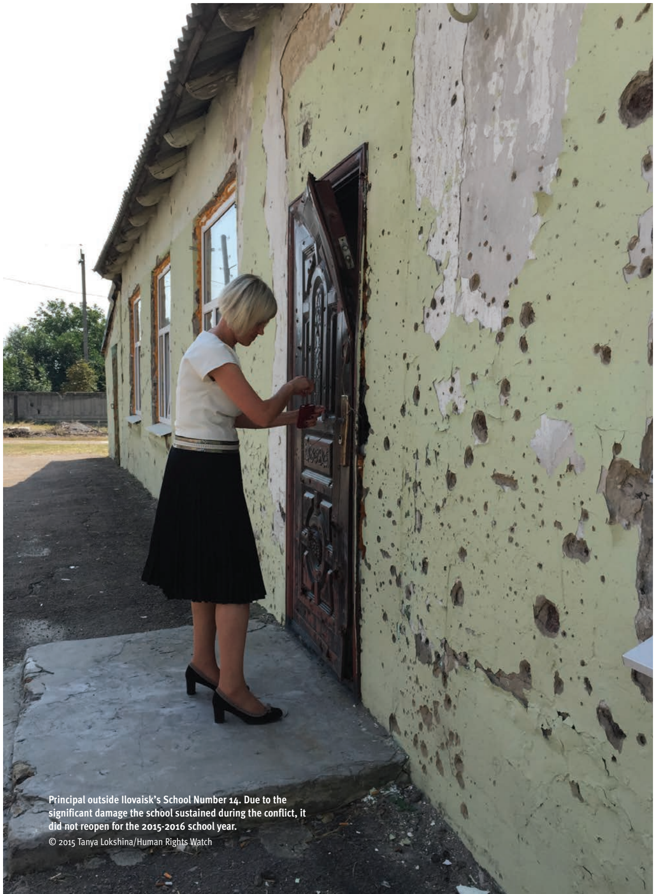
Principal outside Ilovaisk's School Number 14. Due to the significant damage the school sustained during the conflict, it did not reopen for the 2015-2016 school year.