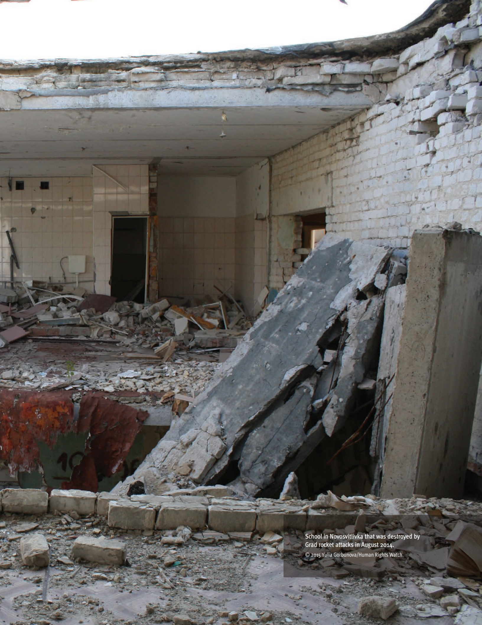
School in Novosvitlivka that was destroyed by Grad rocket attacks in August 2014.