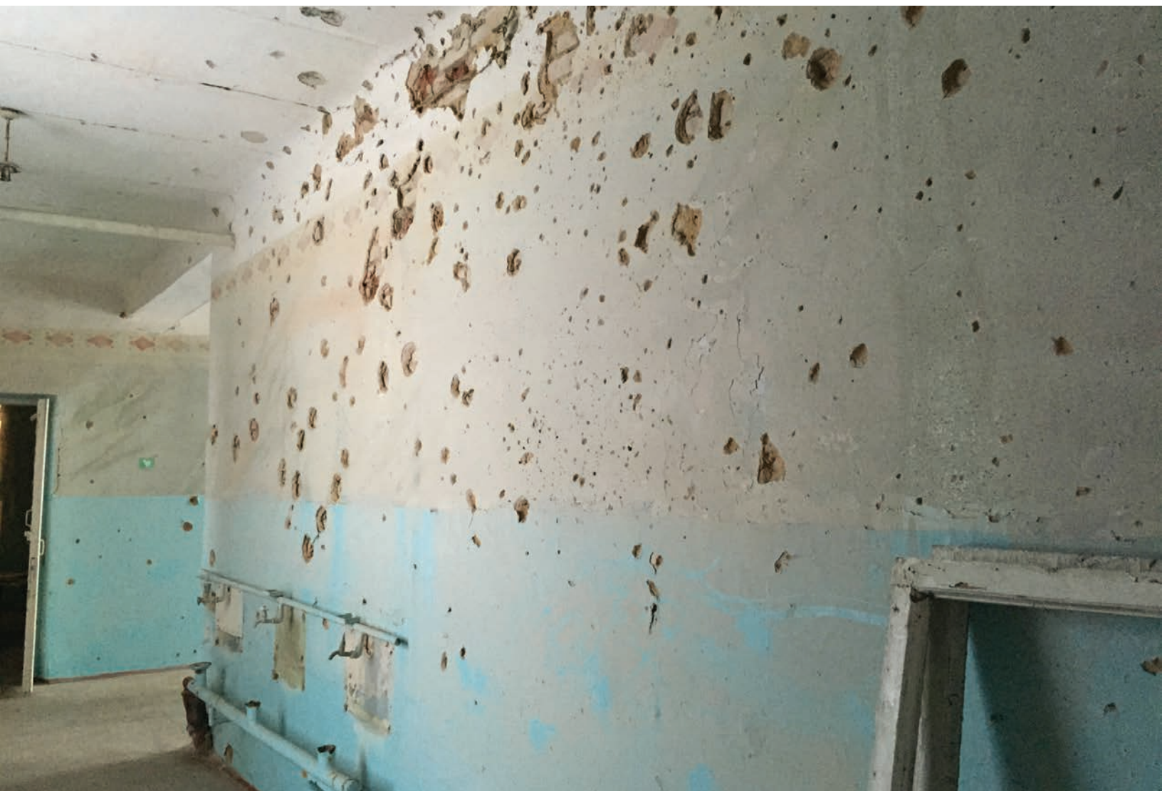
Hallway of Krasnohorivka's School Number 3, damaged by shrapnel and shell fragments.