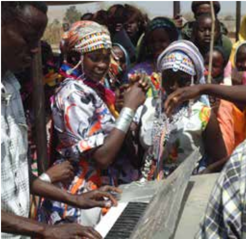
Festivities at Community Cultural Day event Central Darfur, December 2012.