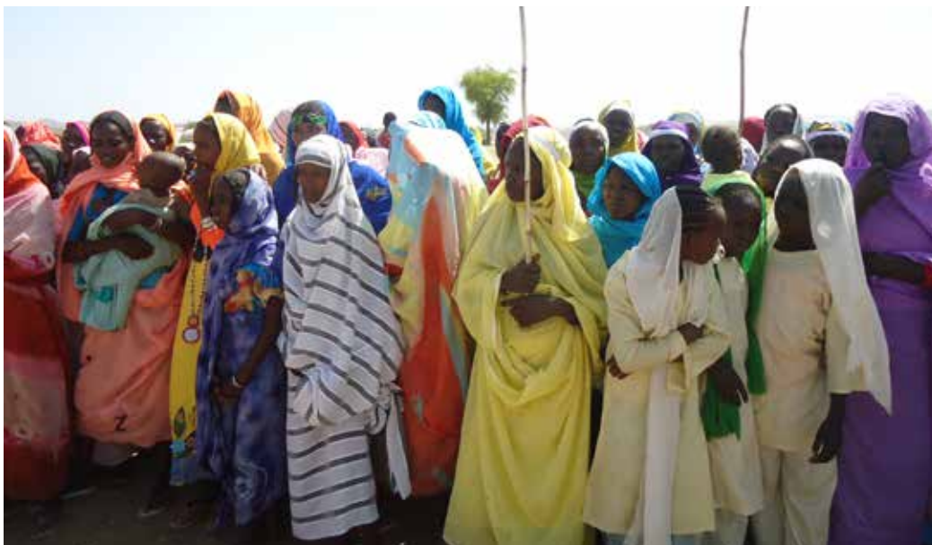
Festivities at Community Cultural Day event Central Darfur, December 2012.