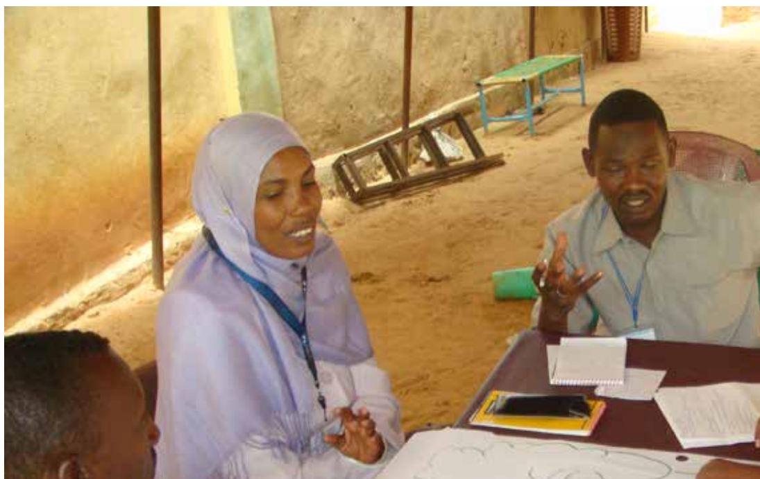
Staff of Gilani Social Development Society in El Geneina, West Darfur.

approach was feasible in this context because of the relatively small number of CSOs (60) and the consortium members' staff who were already working in each state.