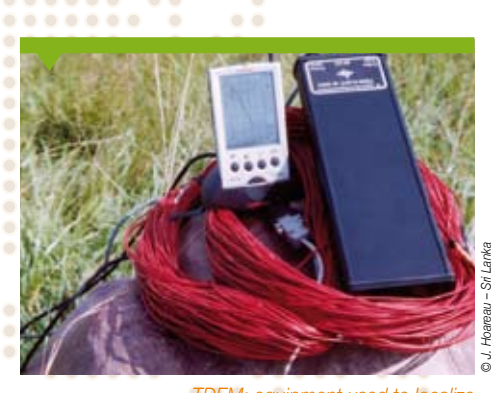
TDEM: equipment used to localize the saline water intrusion Sri Lanka-2006

Hoareau J., People-centred Approaches to Water and Environmental Sanitation « The use of transient Electro-Magnetism methods to localize the saline water intrusion in coastal aquifers. A case study in Sri Lanka.», 32nd WEDC International Conference, Colombo, Sri Lanka, 2006.