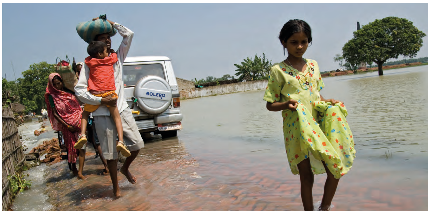
The road from Saharsa to the relief camp at Mirjawa was flooded for nearly three weeks after the River Kosi burst through a stretch of embankment, changing its course and flooding vast portions of Bihar District, India.