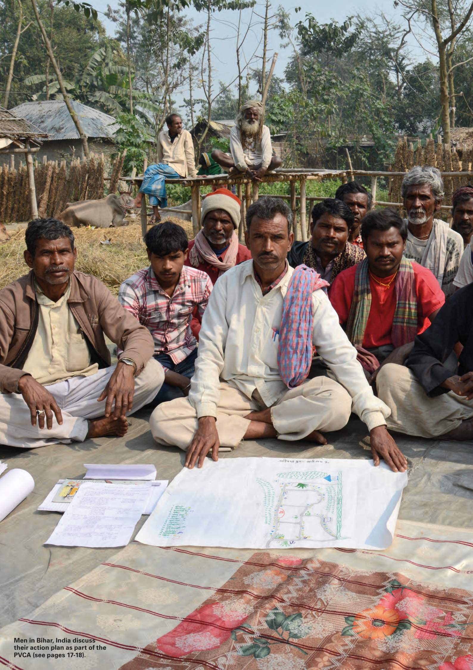
Men in Bihar, India discuss their action plan as part of the PVCA (see pages 17-18).