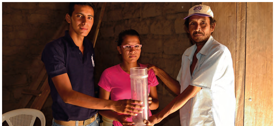
In Nicaragua, rain gauges are helping communities to plan what and when to plant, and give early warning of flood and drought.

Producers not only report better yields of basic crops but diversification into other plants including fruit, vegetables and medicinal plants; 100% of producers agree they are now eating better or much better (more; more healthily) and that the health of their families is either better or much better. Based on a 2013-2014 assessment, 92% now have food to sell after feeding their families compared to 37% at the beginning of the project, and 98% report improved access to markets since the beginning of the project, with low yields no longer cited as one of the biggest barriers to resilience.