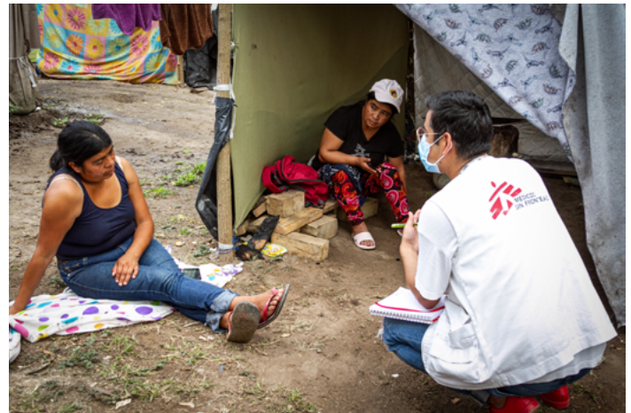
Health promotion activities at the asylum seekers camp in Matamoros.

While the right to health is guaranteed for all people regardless of their immigration status 169 , investment in public health has significantly increased 170 , a Popular Insurance was implemented in 2014 and then replaced by the Institute of Health for Welfare (Insabi) in 2020 171 , further efforts are still required to guarantee access to efficient and quality healthcare with sufficient medical supplies and trained personnel. 172 For example, the country has 8 hospital beds and 27 health workers for every 10,000 inhabitants (while the WHO recommends having 28 and 44 respectively); 12 doctors (including generalists and specialists), 1 dentist, 1 psychologist and 2.6 health promoters for every 10,000 inhabitants (also lower figures than recommended). In terms of distribution, the south of the country is particularly disadvantaged in terms of capacity and infrastructure 173 . Likewise, although Insabi provides healthcare for all, it only guarantees the free provision of first and second level services. 174 In other words, highly specialized treatment is postponed for months and subject to financial contributions from patients to cover their care.