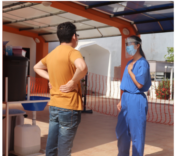
MSF doctor updating family members about patient's status in the COVID-19 centre in Matamoros.

Generalised violence is one of the main triggers of forced displacement in the North of Central America. How violence affects the health of displaced people is highly contingent on socio-economic factors, and also varies depending on the stage of the migration cycle. Women and girls are the most vulnerable to situations that affect their sexual and reproductive health. 66 Health issues can also be a direct reason or contribute to why people have to flee the NCA, as they are unable to access adequate healthcare at home due to access limitations imposed by gangs, weak health infrastructure, including a lack of qualified personnel, technology and medical supplies, as well as poor universal and free coverage. 67