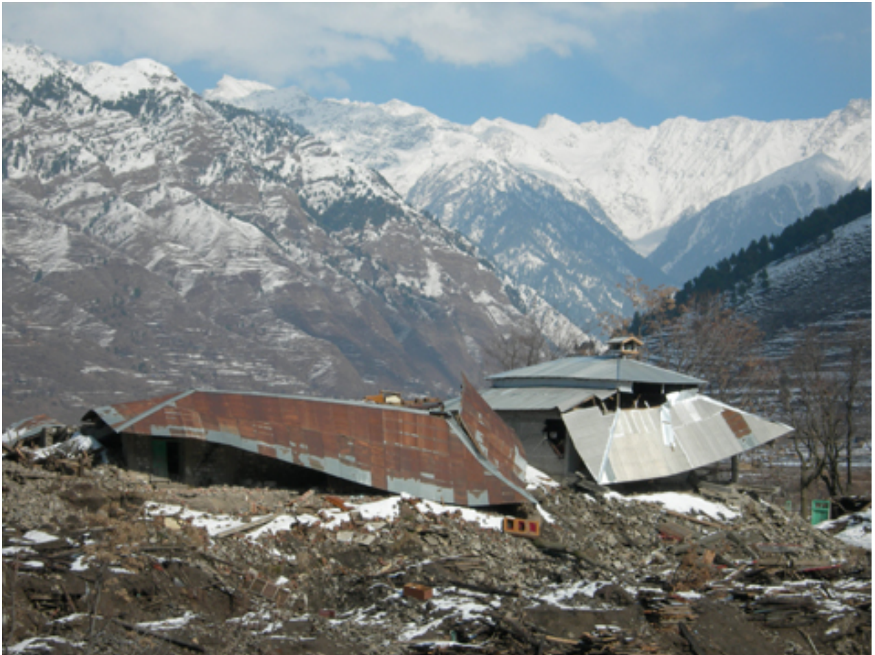
Destroyed house on ridge