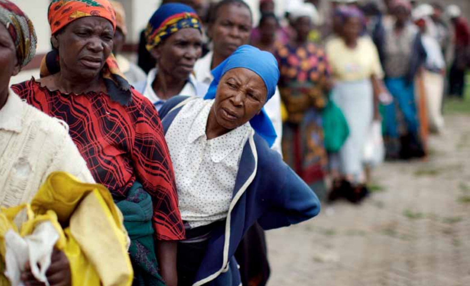
People queuing at an Oxfam feeding programme in Mbare, Harare. It is possible that the scale of the crisis has been underestimated. Even Zimbabweans who have money cannot buy food as there is nothing in the markets.