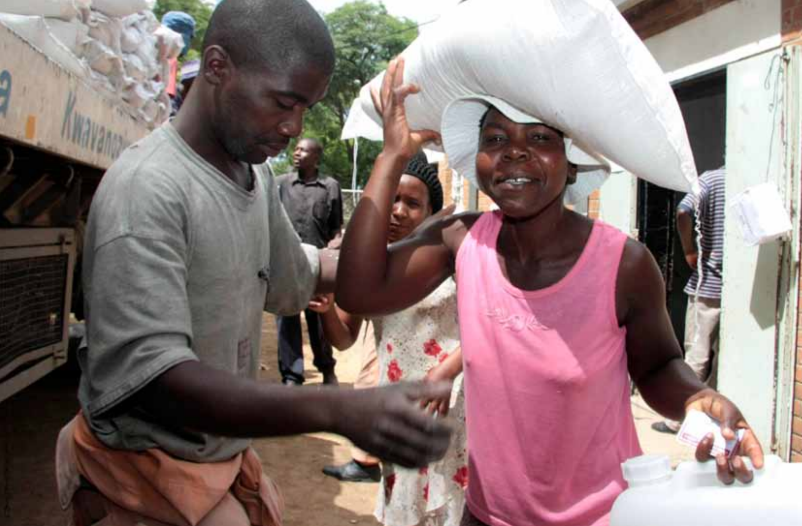
In addition to providing vouchers as a response to meet urgent needs, Oxfam also engaged in projects that helped to preserve the resilience of the population such as provision of agriculture inputs - fertiliser and seeds as well as promotion of community nutrition gardens.