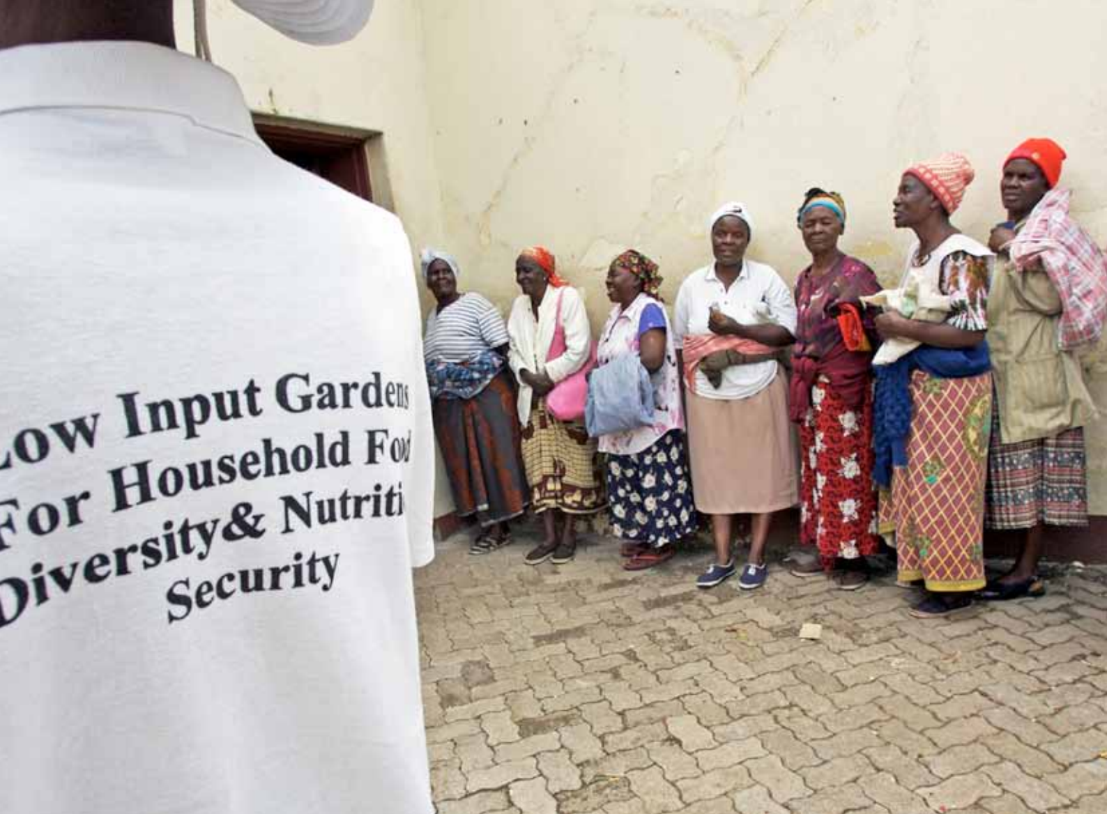
People queuing to collect vouchers for Oxfam's supplementary feeding programme in Mbare, Harare, Zimbabwe.