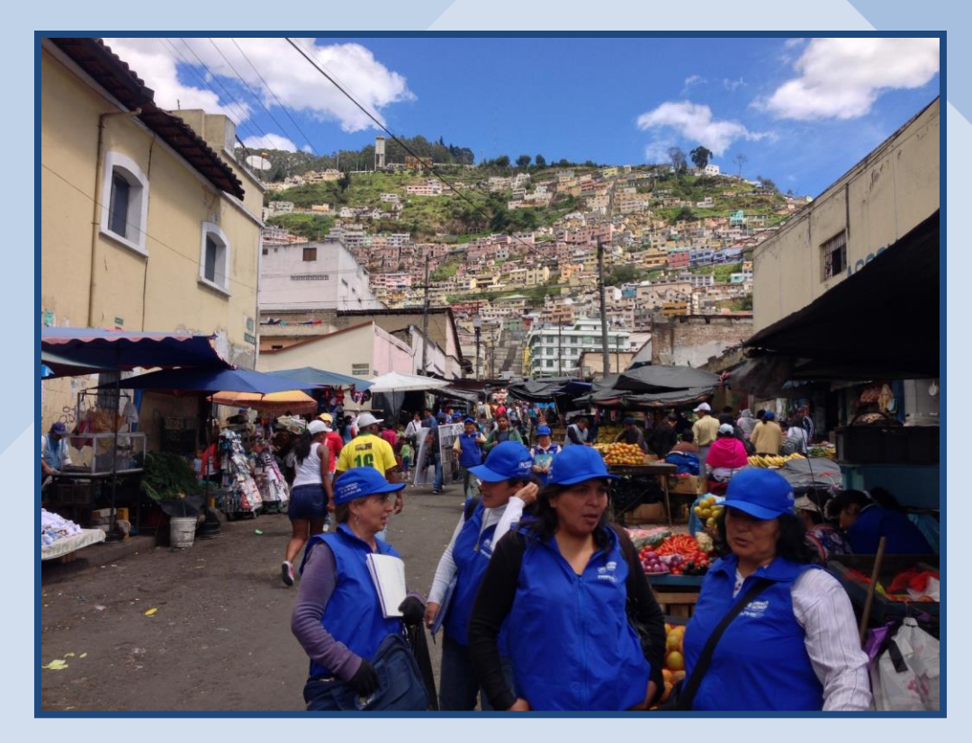
Enumerators in Quito during profiling, June 2013