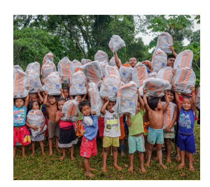
Delivery of education kits to displaced children in Juradó. Armed groups displaced indigenous people from the area last April, with hundreds of children missing school.

Chocó and Nariño, both located in the west of Colombia, have been the regions of the country most affected by displacement. They are also the regions with the highest proportion of people in need of humanitarian assistance and living below the poverty line (61 per cent and 41 per cent of people, respectively)<sup>33</sup>. There are 171,000 children at risk of forced recruitment and 358,000 people affected by the presence of explosive ordnance.