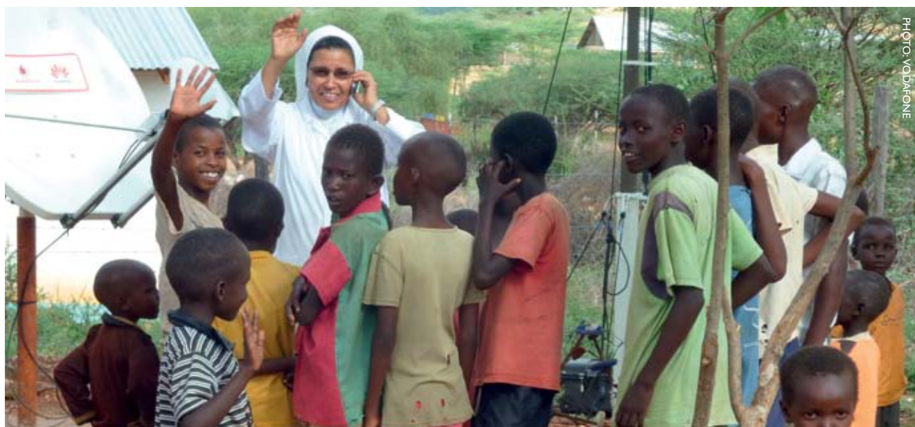
Vodafone Instant Network deployment, Kaikor, Kenya