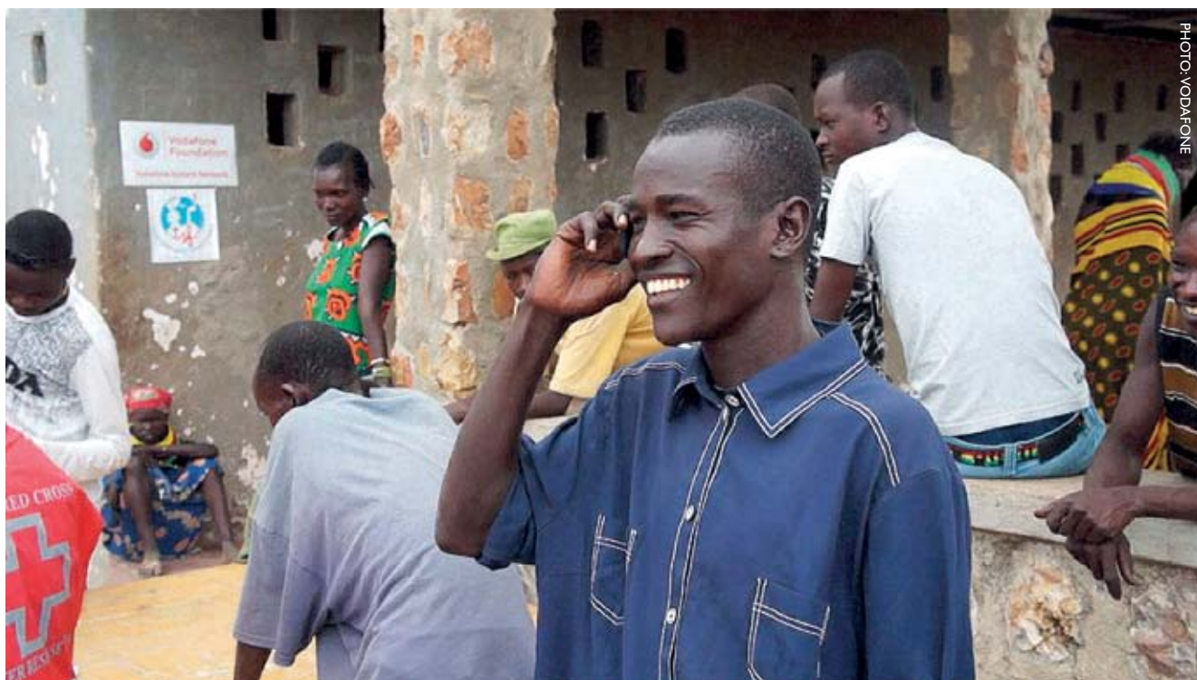
Vodafone Instant Network deployment, Kenya