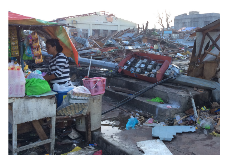
Despite the total devastation of the local market in Guiuan, Philippines, within two weeks of the category 5 super Typhoon Haiyan, market vendors were selling what was saved or salvaged.

During the first phase of the research WRC conducted two assessments, one in a quick-onset disaster (Philippines) and one in a protracted emergency context (DRC). Generalizations are made based on these two assessments. Further field testing and refinement of the recommendations and tool will continue in the second phase of the research.