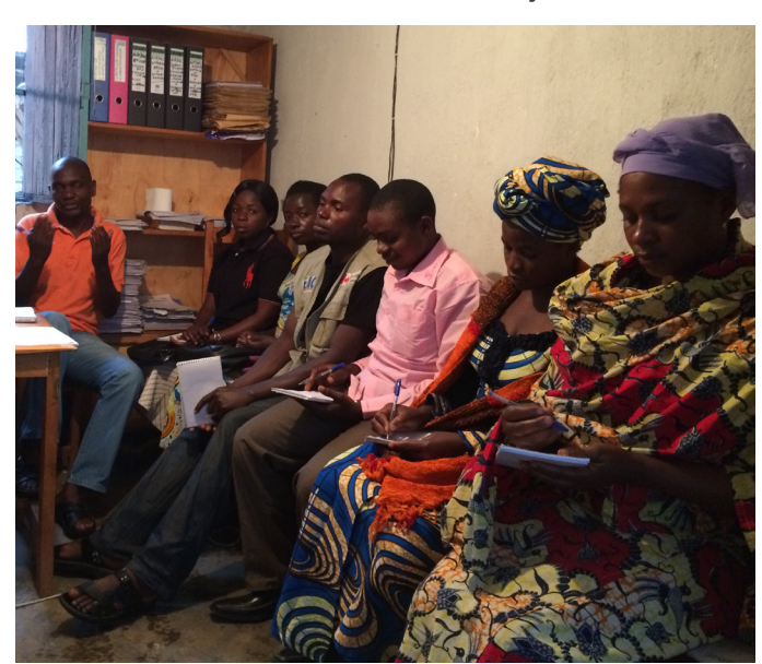
An ACF and Reseau de Femmes team prepares and trains for the focus group discussions. An equal number of men and women were engaged to lead the focus group discussions.