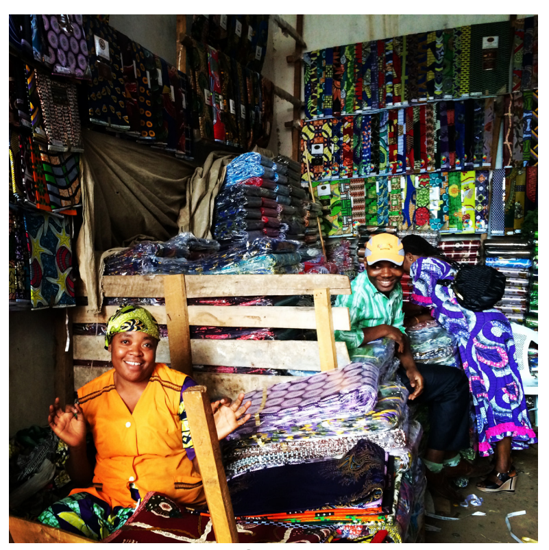
Fabric seller, market, Bukavu, DRC.

The structure of this report first identifies emerging lessons, gaps and opportunities for safer livelihood programs in emergencies. The methodology is explained, which sets up the intersections between protection, livelihoods and gender. The report then describes initial findings related to field assessments and location. Results from the field assessment inform key findings and recommendations, as well as next steps for the second phase of the research. The follow-on phase of the research will focus on testing the recommendations and tools developed based on this report.