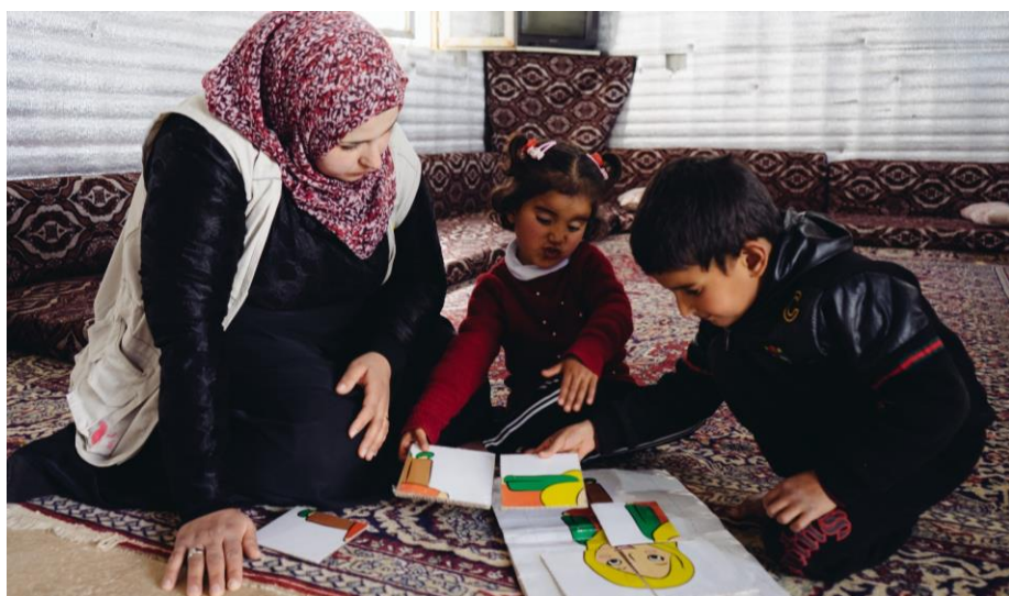
A Syrian mother and two of her children in Azraq refugee camp in Jordan. She says Ahlan Simsim has helped her children become more confident.

86% of refugees in Jordan own a mobile phone and 10% have access to a shared phone. However, the digital access gap remains a challenge in Jordan: one-sixth of children in Jordan do not have internet at home and one-third do not have a computer. Syrian refugee children are likely overrepresented in these households.