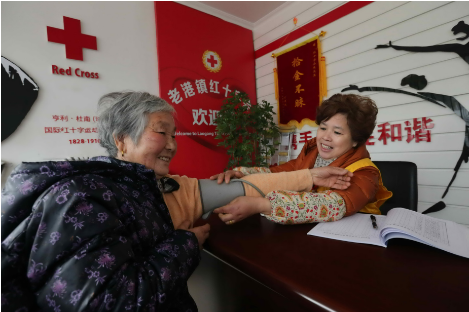
Grass-roots Red Cross unit providing service to communities.