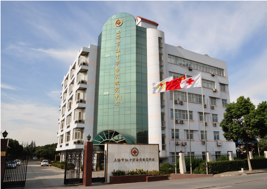
Disaster Preparedness and Relief Centre, SHRC.