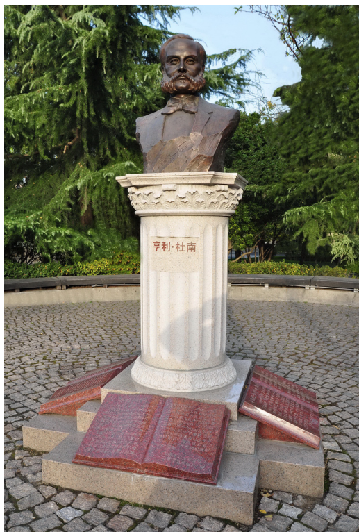
Henry Dunant statue in the city centre of Shanghai.