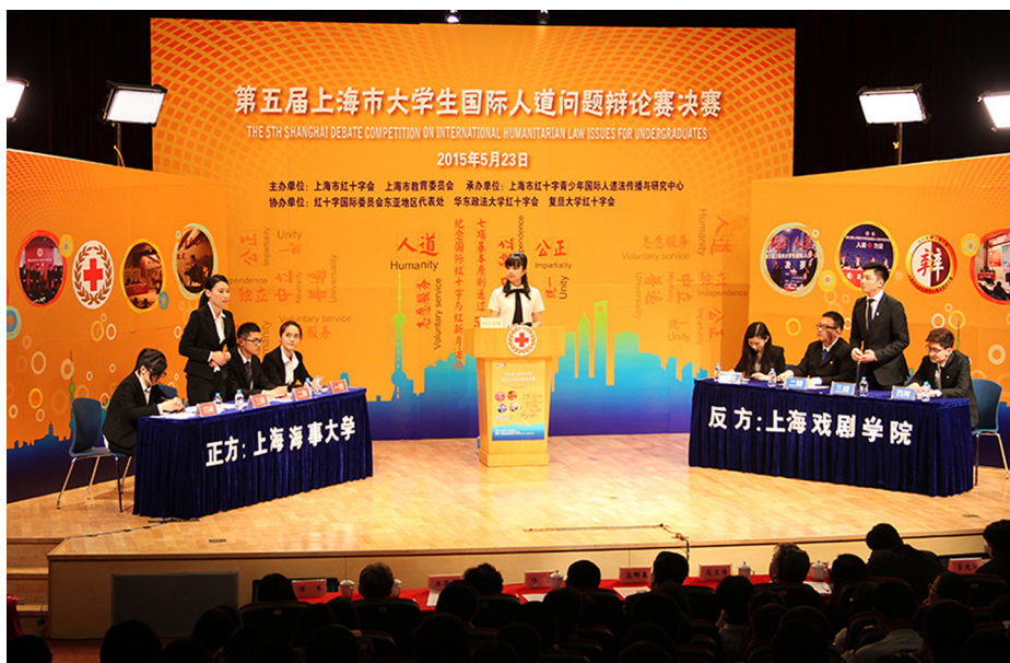
Shanghai Debating Competition on Humanitarian Issues, final round, May 2015.

The ICRC has had reasonably stable staff that have worked for the institution for five to ten years, or even longer. Having long-term staff will help advance the work of the Movement. We need to maintain the stability of staff who have the spirit of dedication and devotion and are able to spread the principles and become Red Cross activists.