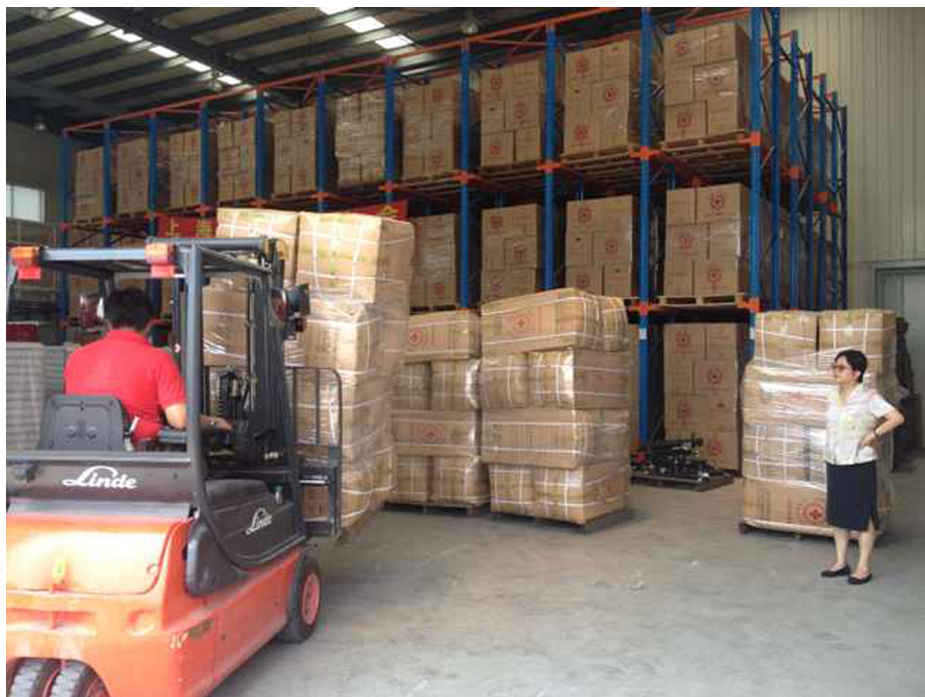
Dispatch of relief goods from the Disaster Preparedness and Relief Centre of the SHRC.

China's economic, social and cultural development will form the foundation for the country's participation in international humanitarian work. After experiencing a few decades of reforms and opening up to the international community, China is gradually integrating itself into the world in its politics, economics, education and humanitarian work.