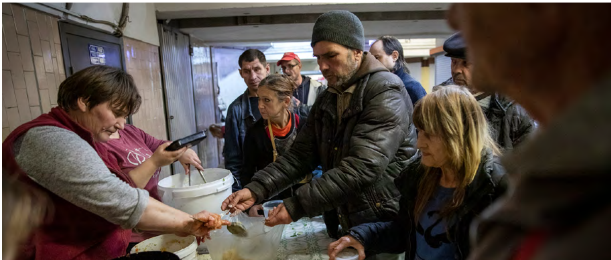
Ukraine, food delivery at a metro station in Kharkov.

It is important to highlight the exceptional support of Spanish society to this crisis (through contributions from citizens and the private sector), who have raised 28.5 million USD through UNHCR in Spain 18 . Thanks to these donations, it has become the largest contribution ever made through UNHCR in the last five years.