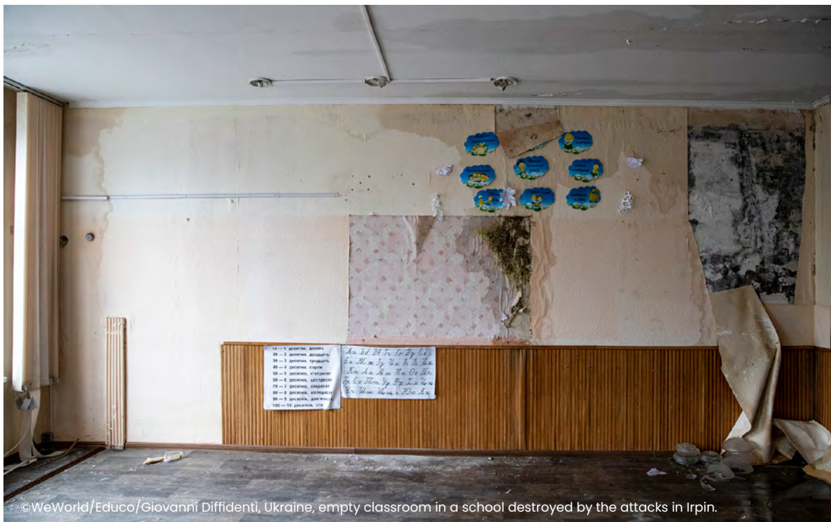
Ukraine, empty classroom in a school destroyed by the attacks in Irpin.