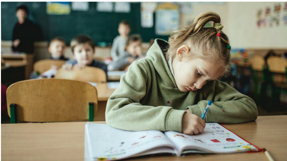
Ukraine, children receive in-person classes.