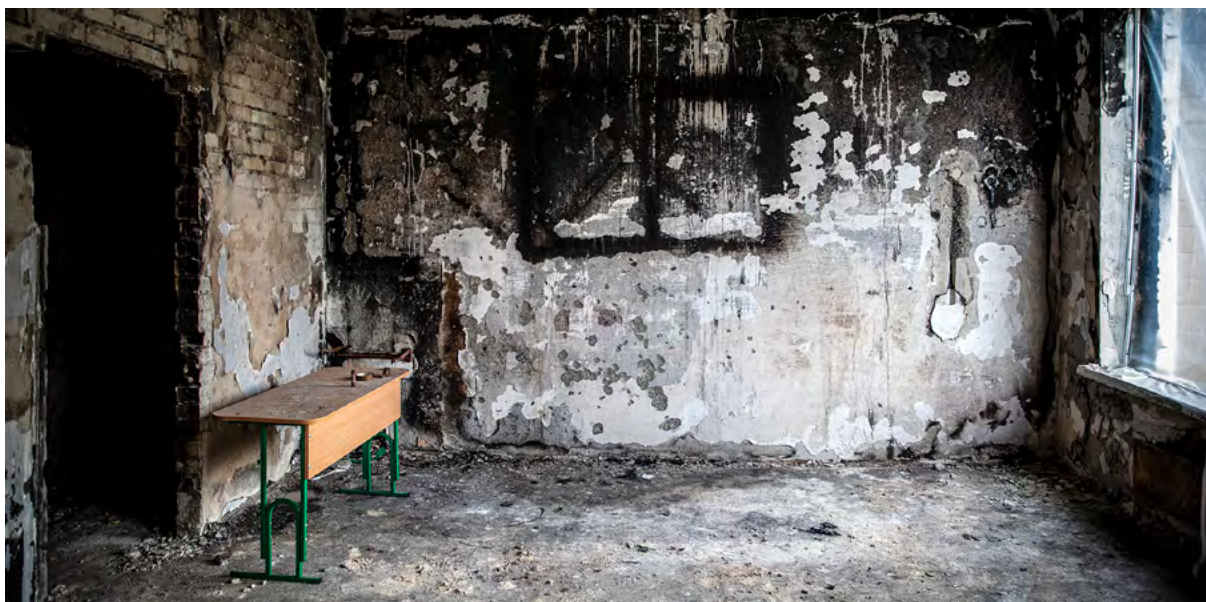
Ukraine, an empty classroom in a school destroyed by the attacks in Irpin.