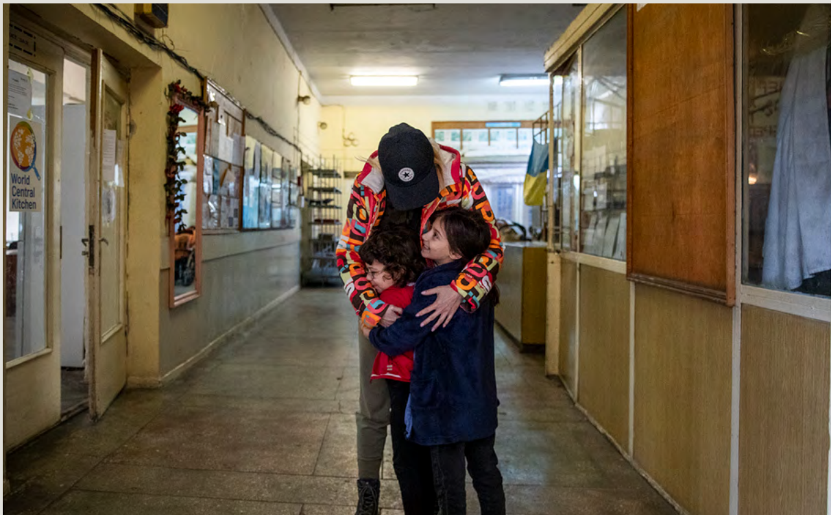
Ukraine, a family who have had to flee and leave their home behind stay in a building transformed into a shelter in Lviv.

These instruments identify a common set of core obligations that states must fulfil as duty bearers. These include, for example, providing free and compulsory primary education for all; making secondary education available to all; making higher education accessible to all (ICESCR, 1966, art. 13); promoting or intensifying "fundamental education" for pupils who have not received primary education or who have not received it in full; improving the quality of education; improving the material conditions of teaching staff; and putting an end to discrimination. To achieve these goals, States have an obligation to respect the principle of non-retrogression and to allocate the maximum available resources to education, so as to progressively achieve the full realisation of the right to education for all (ICESCR, 1966, Art. 2; UNESCO and Education 2030, 2021).