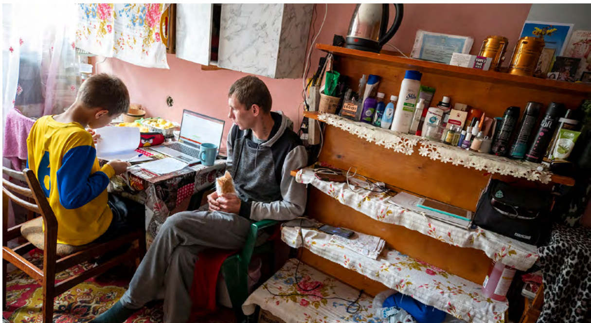
Ukraine, a father and son who had to flee their home are staying in a building transformed into a shelter in Lviv.

However, in emergency situations, states tend to have difficulties guaranteeing and protecting human rights. This may be due to the loss of power and chaos these situations cause, the destruction of infrastructure or the redirection of resources. In any case, emergencies increase the likelihood that the right to education will be violated. Disruption of this right not only means fewer learning opportunities for children and adolescents in the present, but it could also jeopardise their future.