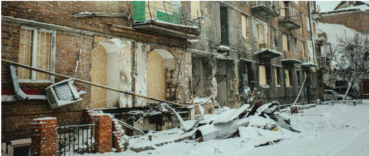
Ukraine, apartments destroyed during the attacks.

Aid has been provided through various channels including UN agencies (UNICEF and UNHCR), the International Red Cross and Red Crescent Movement (ICRC and IFRC), Spanish NGOs and direct aid donations through the European Civil Protection Mechanism and co-funded by DG ECHO.