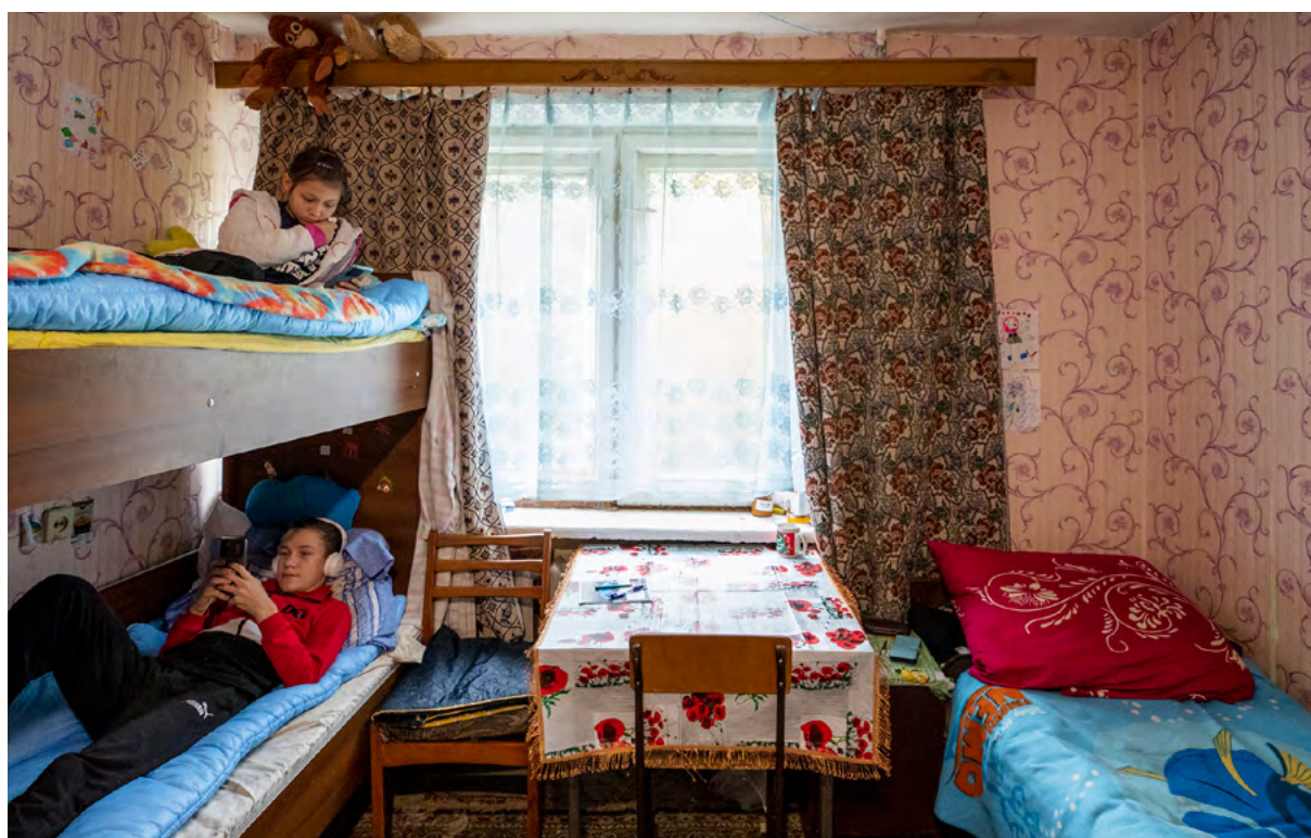
the room of a family that has had to escape and leave their home and is staying in a building that has been transformed into a shelter in Lviv.

Millions of children and adolescents have been out of school for months or have been attending school intermittently thanks to the efforts of governments in implementing the remote learning platform. For them it has been a lost year that has paralysed their studies and left hundreds of thousands without exams. Less time has been spent learning, less content has been covered and the quality of education has declined (World Bank, 2022d). According to a survey of nearly 2000 people in Ukraine in April 2022, 66% felt that the quality of education had fallen compared to before the invasion (Gradus Research Company, 2022). Along the way, too many children and adolescents will drop out of school for good, with serious consequences for their future and the future of the country.