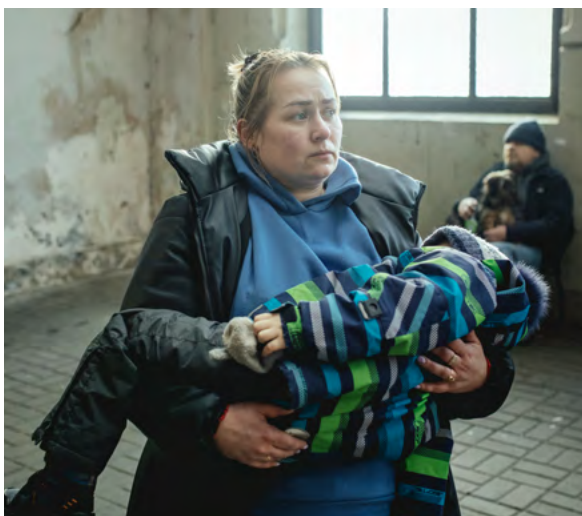
Ukraine, a mother and child who fled the attacks.

Education by radio or digitalisation of the educational content are, without a doubt, other ways that allow children and adolescents to stay connected to the subjects they know and prevent them from losing relationships with friends and teachers in their place of origin.