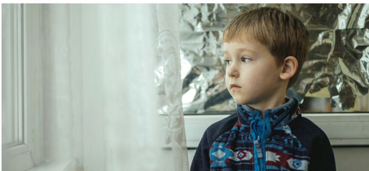
Ukraine, Roma a 6-year-old boy in Vyshgorod.

Children who have access to education can break the cycle of poverty that is at the root of child labour.