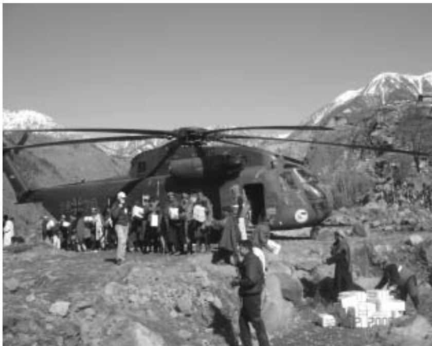
A German military helicopter transporting relief items for the Pakistan Red Cross and IFRC following the earthquake in 2005

While the involvement of the military in relief operations is not new (think of the 1948–49 Berlin airlift, for example), military engagement in relief activities has grown since the early 1990s. Military resources were used in response to the 1991 cyclone in Bangladesh, and after Hurricane Mitch in Central America in 1998. More recently, the US military supported the response to Hurricane Katrina in 2005, the UK military was brought in to help tackle floods in Britain in 2007 and huge numbers of Chinese troops were deployed in the aftermath of the earthquake in Sichuan province in 2008. Following the October 2005 earthquake in Pakistan, domestic and international military actors mounted the largest humanitarian helicopter airlift ever seen. Regional alliances too are paying growing attention