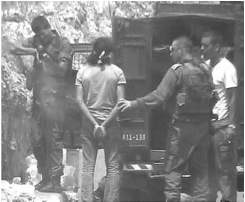
An Israeli soldier firing a rubber bullet at a Palestinian detainee, Ni'ilin, July 2008

The project has also had far-reaching effects within the Palestinian community. Armed with video cameras and extensive training, participants in the project are no longer victims. The video camera empowers its users to take action in their own defence. In one example, a 15-year-old boy from Ni'ilin, who used to throw rocks and resort to violence in the belief that there was no way to change his miserable situation, now picks up his video camera, becomes a journalist and films away. He explains that 'people from the outside see what's going on here', raising hopes for change and improvement. Palestinians' perception of the power of the cameras as a source of protection can best be understood through the insistence of one elderly Palestinian man from the southern Hebron hills, who refused to give up his camera even though it was broken: broken or not, he said, the camera constituted his only defence.