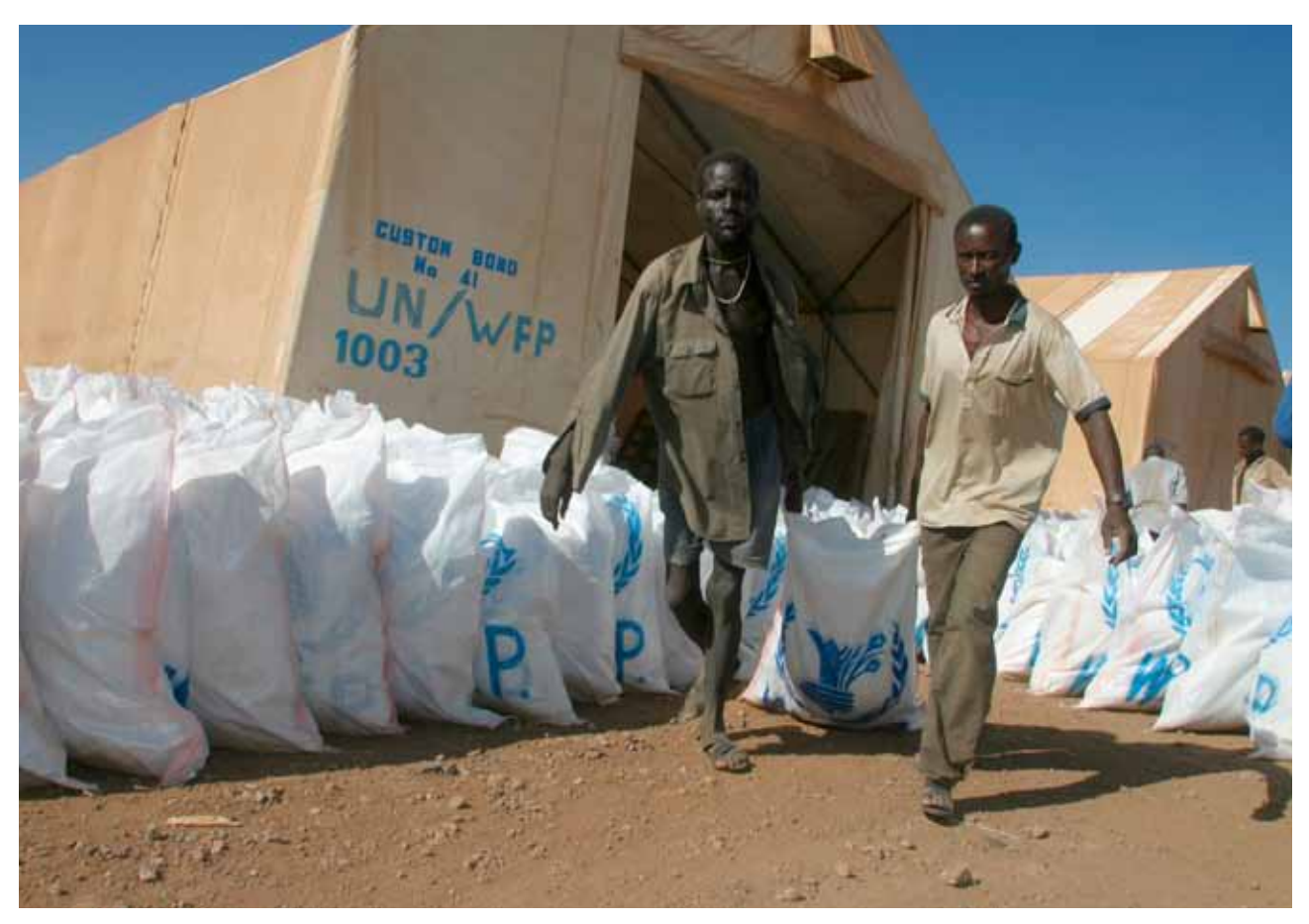
In 2008 Ireland contributed more then €23 million to the United Nations World Food Programme in support of its efforts to fight hunger worldwide.