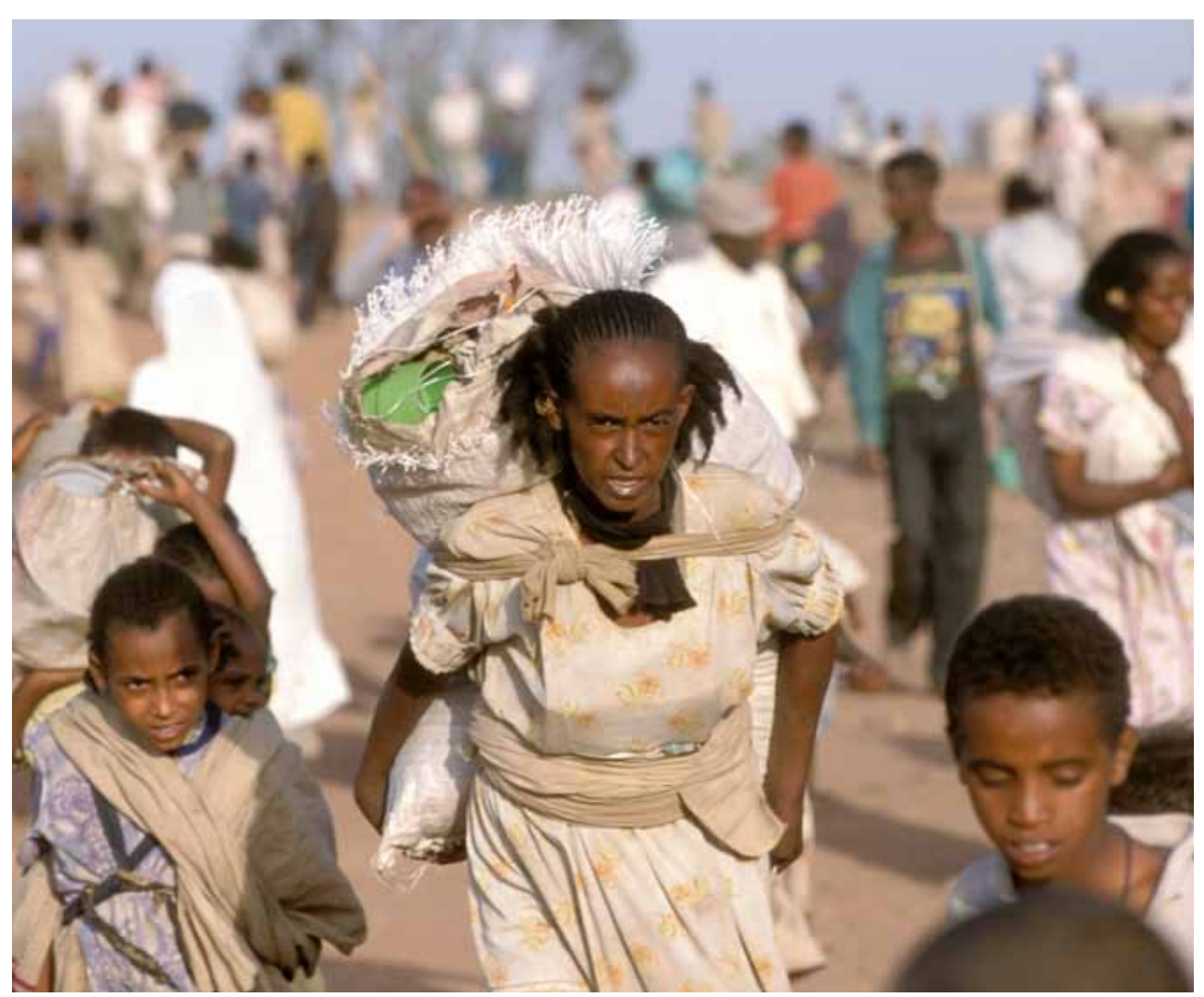
A displaced woman and her family in Eritrea

Gender based violence (GBV) refers to violence targeting women or men, girls or boys on the basis of their gender. GBV has been shown to increase significantly during times of extreme hardship such as during humanitarian crises, and particularly in situations of conflict. Irish Aid has adopted a human rights approach to tackling the issue of GBV, is an active member of the Joint Irish Consortium on Gender Based Violence and is committed to a series of organisational and programmatic actions to tackle the issue.