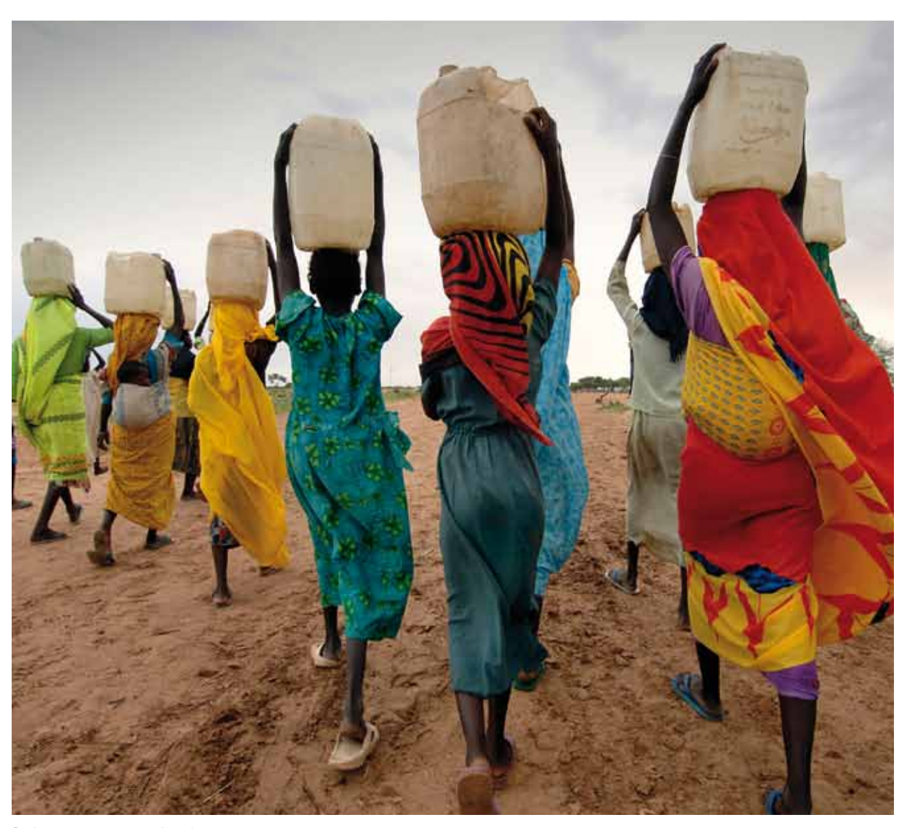
Sudanese women carrying clean water

Irish Aid's relief interventions will take consideration of, and work to prevent, any possible negative effects of activities on the surrounding environment, in both the immediate and long term. Environmental considerations and principles for engagement, as set out in Irish Aid's Environment Policy for Sustainable Development, will inform humanitarian funding decisions and action.