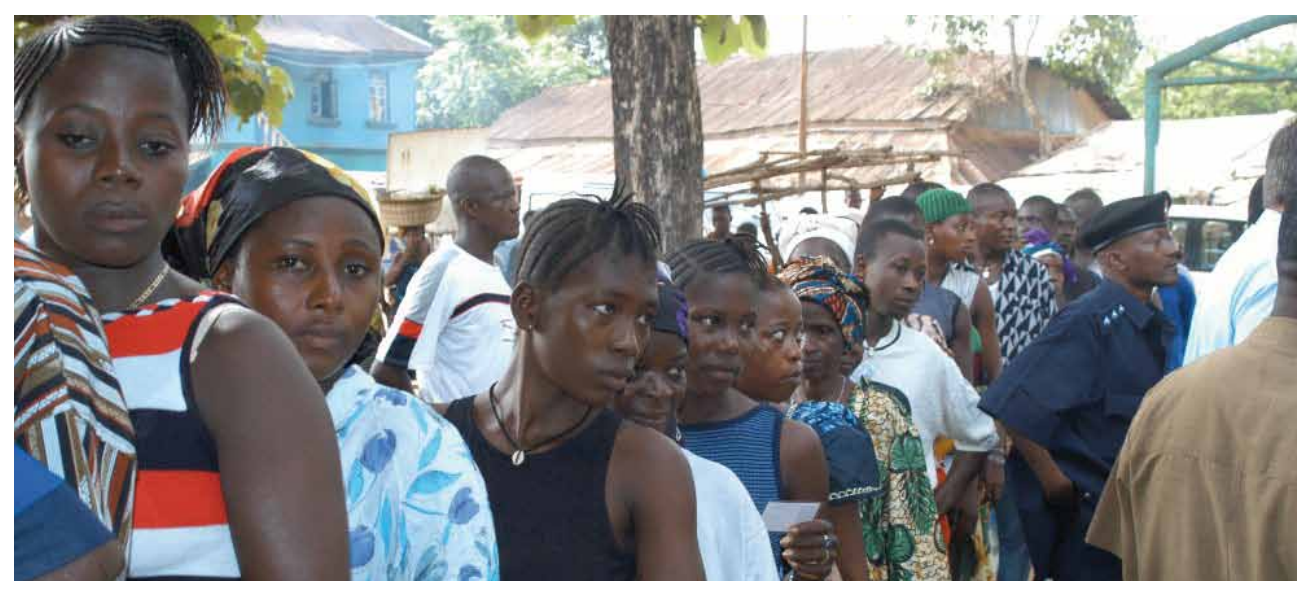
Election Day, Sierra Leone

In order to enhance a State's long-term capacity to govern, Irish Aid will, where appropriate, align its support in a way that strengthens the role of the State. It will prioritise activities that strengthen state capacity, particularly in basic service delivery.