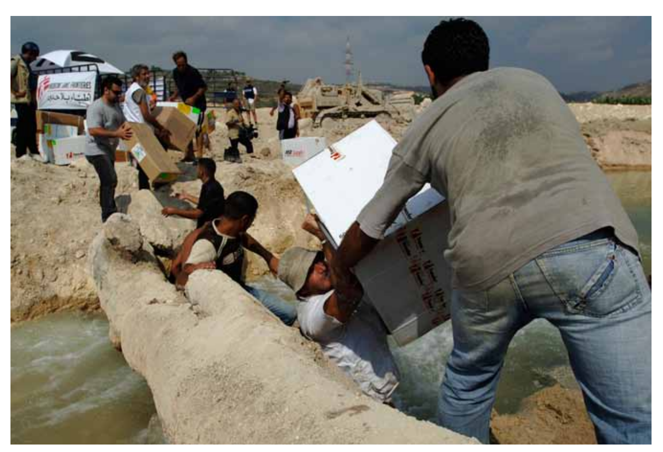
The distribution of medical relief supplies in Lebanon, 2006.

It is Irish Aid policy to consider some elements of early recovery and some aspects of preparedness from its EHAF (relief) budget line – where they form part of a larger response to acute needs in an emergency.