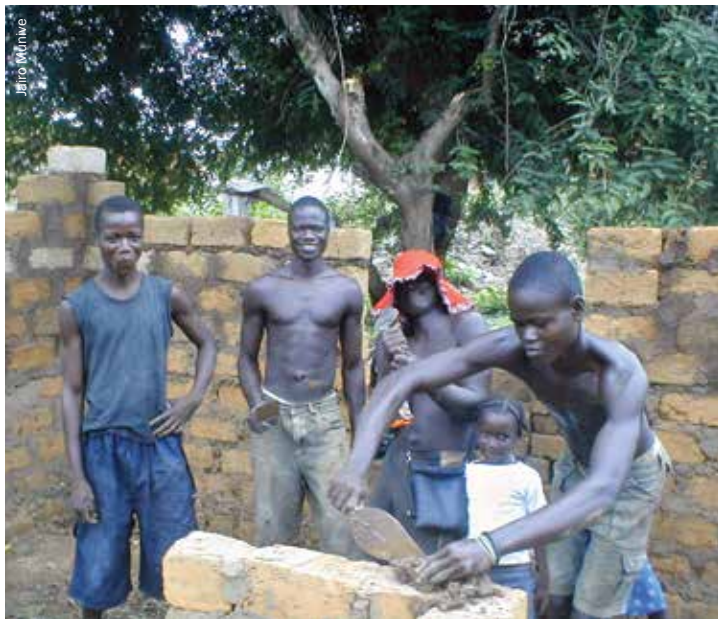
Ex-combatants and their extended family build a house on squatter land in Central Ganta.

In several areas there are overlapping roles and functions between local and national government in Liberia. One of these is the authority to lease out public land and grant 'squatters' rights'. It is generally agreed that the local city administration can grant such rights for land that is publicly owned. In Ganta after 2003 the Mayor and the City Council granted squatters' rights to people settled on privately owned land. From 2003 to 2006 the central Liberian state was more or less completely absent in the locality and intervened only sporadically in local affairs. It was not until 2008 – and after direct orders from the Minister of Internal Affairs – that