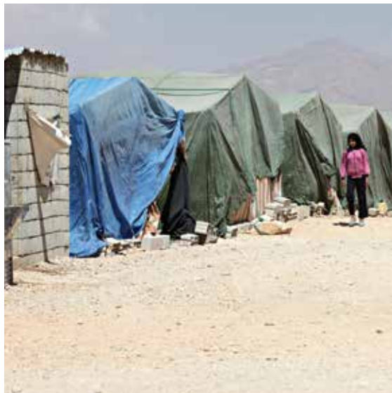
Tents in the grounds of a mosque provide shelter for Syrian refugee families in Lebanon.

There are very few opportunities for employment, so many refugees resort to desperate measures to cover their costs. These include prostitution, early marriage, begging and working for exploitative wages. The World Food Programme is implementing a large-scale food voucher programme and other organisations are providing household items and cash support. Some agencies manage work creation and training schemes. However, even before the crisis, employment in the refugee-hosting areas was hard to