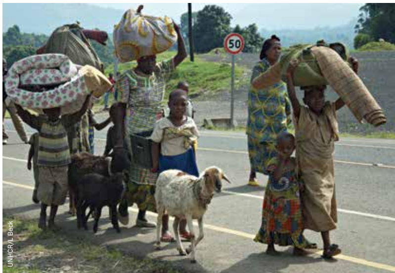
Congolese refugees return to DRC in March 2013 after fighting between rival M23 factions calms down. Years of experience have taught them to flee with as much as they can carry.

When displaced families cannot farm, either because of insecurity in their home locations or inability to access land in their host communities, they begin to suffer from increased malnutrition and cannot earn money. Without money, they cannot pay for school or medical fees. When fewer people can pay, the price may go up so that teachers' and health workers' salaries can