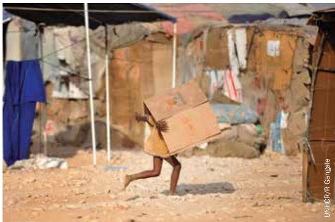
A displaced child helps his family to rebuild a shelter made of cardboard on the outskirts of Bossaso, Somalia.

Beyond identifying people as refugees or voluntary economic migrants, we lack the terminology to clearly identify people who should have an entitlement not to be returned to their country of origin on human rights grounds. People who are outside their country of origin because of an existential threat for which they have no access to a domestic remedy or resolution – whether as a result of persecution, conflict or environmental degradation, for example – might be referred to as 'survival migrants'. 3 What matters is not the particular cause of movement but rather identifying a threshold of fundamental rights which, when unavailable in a country of origin, requires that the international