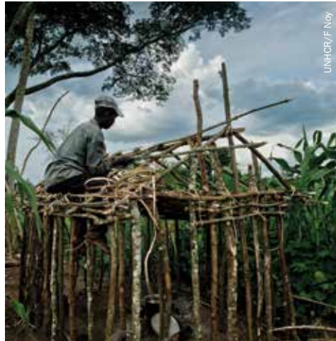
Congolese refugees build new shelters in Rwamwanja, Uganda, following new waves of fighting in North Kivu in 2012.

Especially in post-colonial states it is often the case that there is not a good 'fit' between state borders and the peoples they contain. Even so, there are good reasons not to welcome the eventual collapse of existing states and their rebuilding as new states. First, history teaches us that the drive to create mono-ethnic states has itself been a major cause of forced migrations. Second, the processes of state dissolution and collapse are horrifically disruptive to individuals, both domestically and regionally. Third, seceding states and the remaining 'rumps' are likely to remain very fragile.