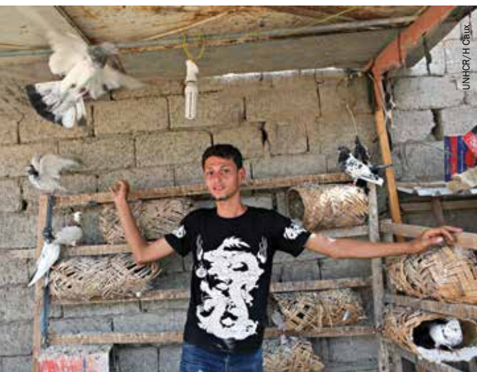
A young IDP feeds his pigeons in Resafa district of Baghdad. "I don't go to school and there is no job for me here."

Throughout their existence, both of these institutions have been subject to considerable criticism inside and outside Iraq, usually focusing on shortcomings in effectiveness,