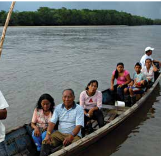
A Colombian refugee in northern Ecuador shows his new refugee visa. In the province of Sucumbios, mobile government registration teams (part of the Enhanced Registration initiative) are completing in a single day an asylum process that used to take months.

channels to access basic rights and economic resources for migrants who may not directly be able to access them from the state. These governance networks also have the potential to open up institutional spaces to foster tolerance between Ecuadorians and Colombians.