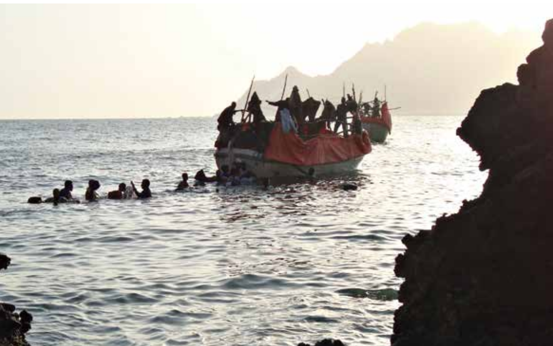
Migrants arriving on the coast of Yemen from the Horn of Africa.

As Yemen seeks to advance down the path from fragility to stability, the Government of Yemen’s Transitional Program for Stabilization and Development, 2012-2014 (TPSD) defines four top priorities and urgent actions for promoting stability in Yemen: (i) finalising the peaceful transfer of power; (ii) restoring political and security stability; (iii) meeting urgent humanitarian needs; and (iv) achieving economic stability. Among the urgent actions to be taken towards achieving security, stability and enhancing the rule of law is to “[r]eview and further develop national legislation pertaining to addressing issues of vulnerable groups such as women, IDPs, asylum seekers, and refugees in addition to issues relating to trafficking and migration management.” Stability also requires “urgent action” to “meet urgent humanitarian