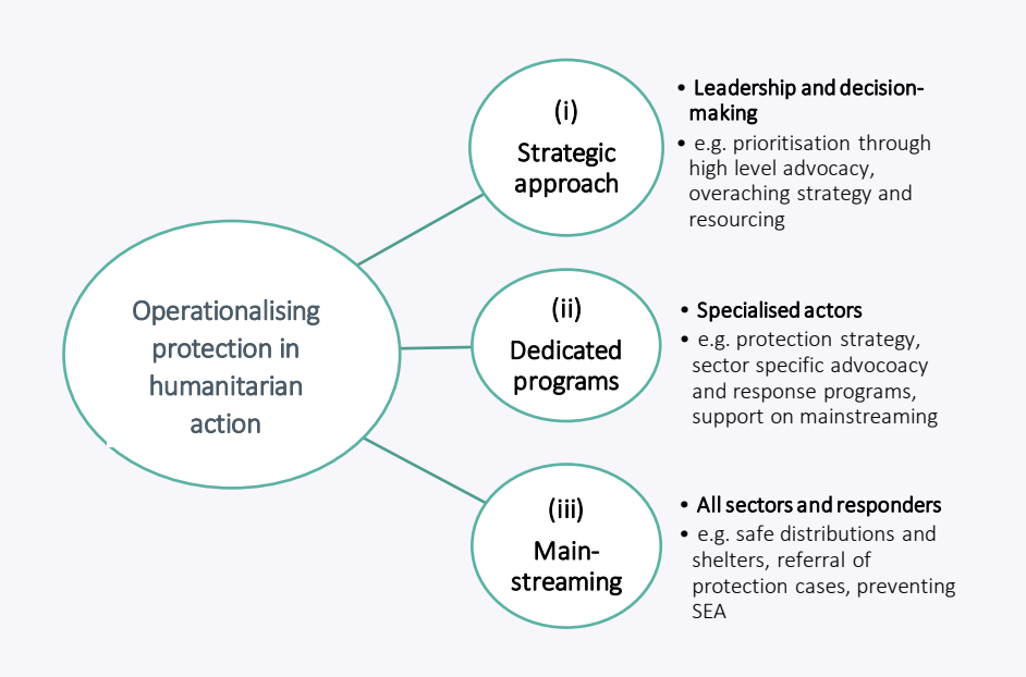
Figure 2 Three levels of action required to effectively operationalise protection in humanitarian action

The lessons and normative developments at the global level, including those of the International Law Commission (ILC), are applicable to Australia and its commitment to good humanitarian donorship. They provide evidence-based insight into the necessary shifts and investments needed within DFAT for more consistent prioritisation of protection in systems, processes and tools, including funding decisions.<sup>11</sup>