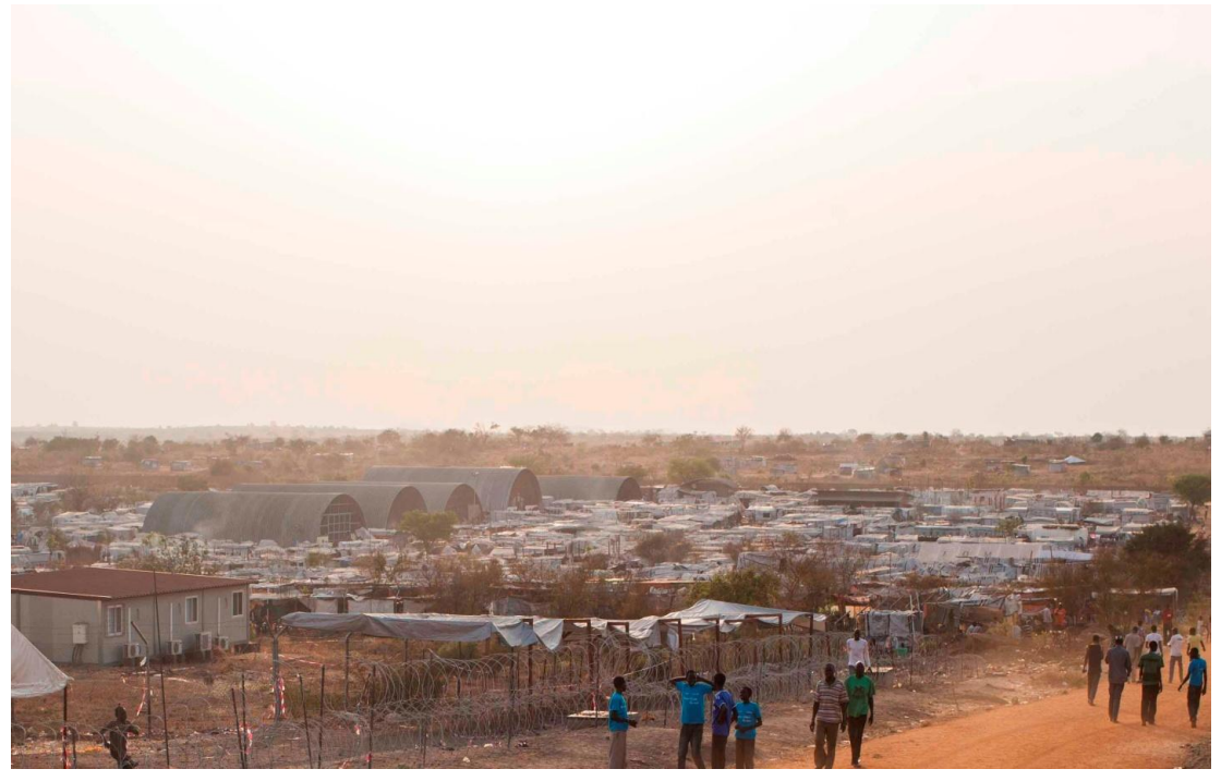
Approximately 12,000 IDPs sought refuge in UN House, Juba within the first two weeks of the conflict

A quantitative summary of the results of the evaluation is provided in Section 2. A fuller explanation of the rating for Oxfam's performance against each standard is provided in Section 3.