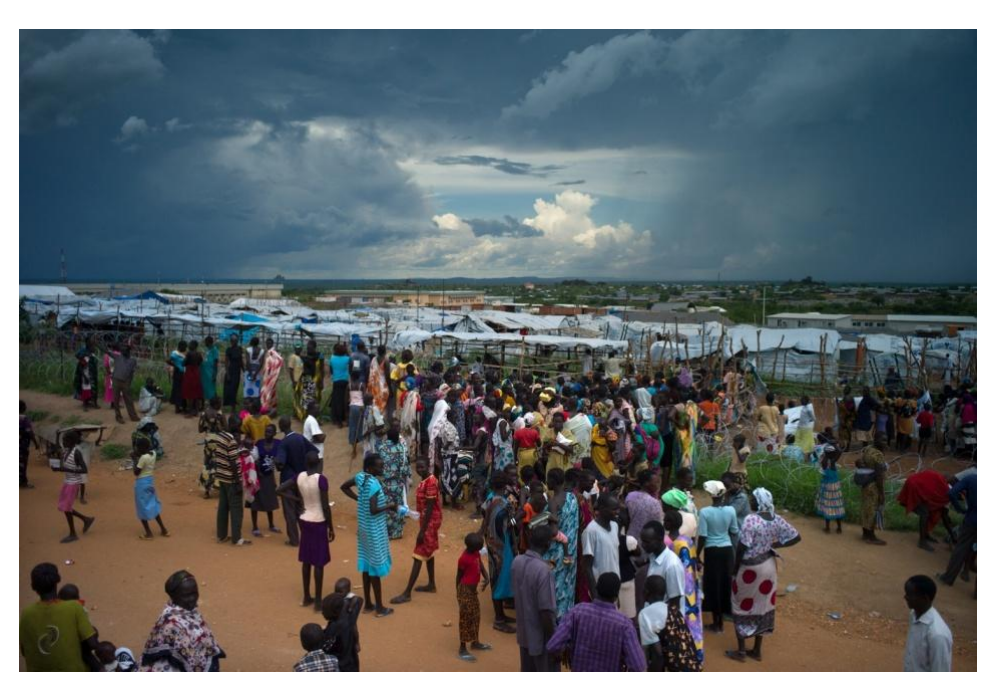
Internally Displaced People queuing inside the camp at UN House.