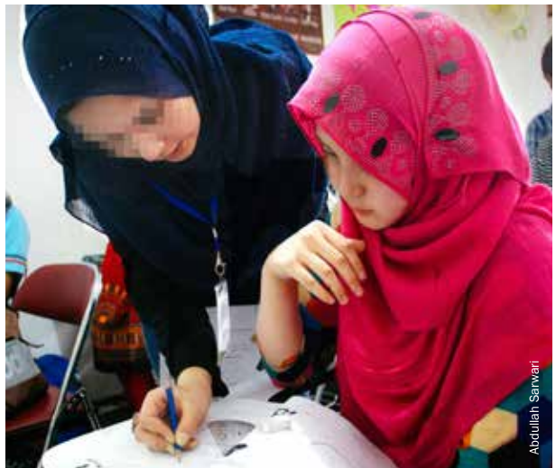
A young refugee volunteer teaches her students in the Refugee Learning Centre in Cisarua, Indonesia.

Through such refugee-led initiatives volunteers are able to put their skills to use and make an impact on their community,