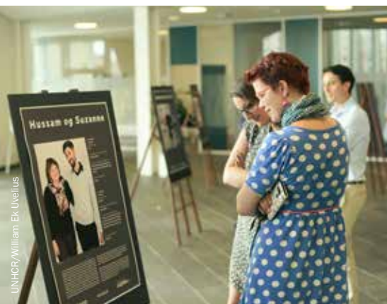
The 'Me and My Friendly Neighbour' photographic exhibition on World Refugee Day in Copenhagen, Denmark, telling stories of refugees and Danes who have become close friends.

Asylum seekers prepare for Fast Track by undertaking a skills assessment. The eight-week Fast Track programme then provides