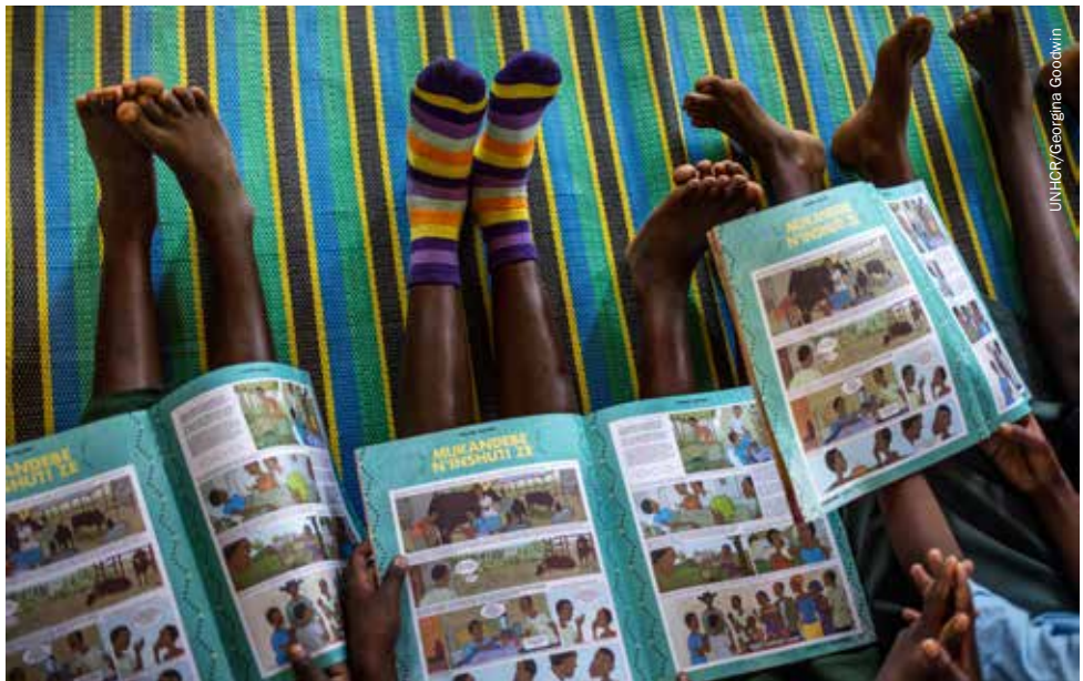
Girls at Paysannat L school in Mahama refugee camp, eastern Rwanda. Eighty per cent of the students are Burundian refugees and 20 per cent come from the Rwandan host community.