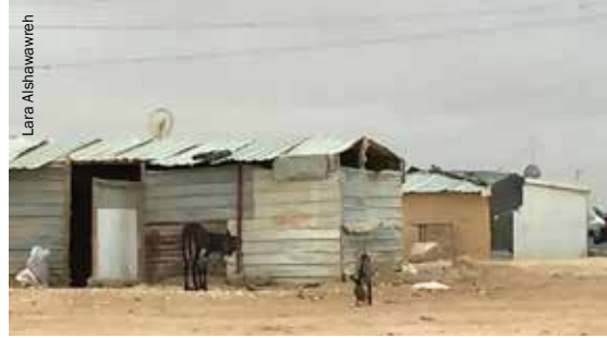
Donkey shelter built by Za'atari camp residents.

One of the few examples of livestock shelters provided by an external organisation comes from the Pakistan emergency response following the 2005 earthquake. The surviving livestock were put in communal shelters after being vaccinated to prevent spread of disease.