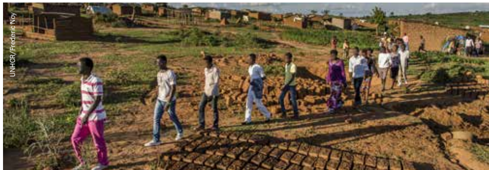
These young Burundian refugees in Kashojwa village, Uganda, belong to the Talented Orphan Refugees' Association. "We learn English, we make baskets and hats, we sing together, we play sports together, we're a family now. We sell what we make and share the money with everyone. In Kirundi, there is a proverb that says 'If we work together, we can improve all our lives.'"

Some refugee-led social protection efforts are backed by funding from international actors; since 2009, for example, UNHCR has used its Social Protection Fund to offer small grants to projects that refugees conceive and