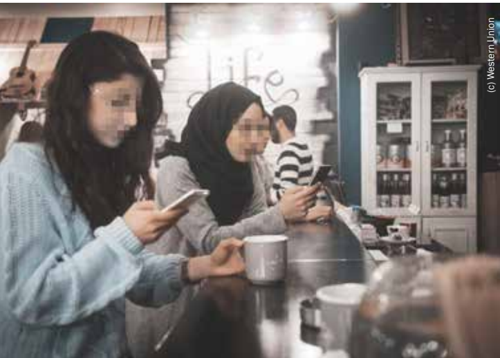
Syrian refugees and Jordanian citizens take part in crowd work, outsourced from Western Union. Why have we pixelated their faces? See www.fmreview.org/photo-policy

Practitioners should monitor the policy environment relating to refugee engagement in gig work. They should provide timely, ongoing information