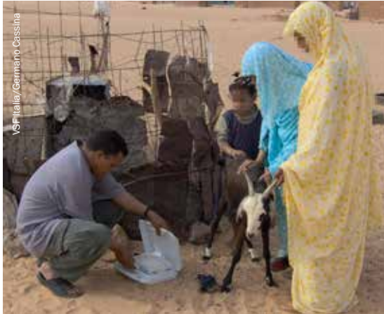
A veterinary clinical visit, Sahrawi refugee camp.

Despite the Sahrawis' overall dependence on food aid, their livestock has for centuries enabled their survival in the Western Sahara and continues to be a hallmark of their cultural identity. Animal breeding by refugees increases the availability of animal proteins and can help address the nutritional problems of the camps. About 80,000 goats and sheep and 80,000 camels are present in the camps. Goats and sheep are fed almost exclusively with domestic organic waste, while camels spend part of their life in pasturelands close to the refugee camps. A lack of suitable pasture means there are limited opportunities to raise large numbers of camels for sale, so the importance of livestock (camels, but also goats and sheep) in refugee camps lies