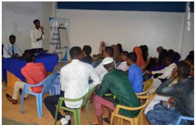
Weekly seminar, run by Kobciye.

There has long been a negative perception of the Somali refugee population in Eastleigh, 1 and in 2014 tension peaked with the police crackdown known as Usalama Watch. This presented a significant challenge to our organisation. We responded by moving from empowerment and skills training to advocacy and awareness raising in order