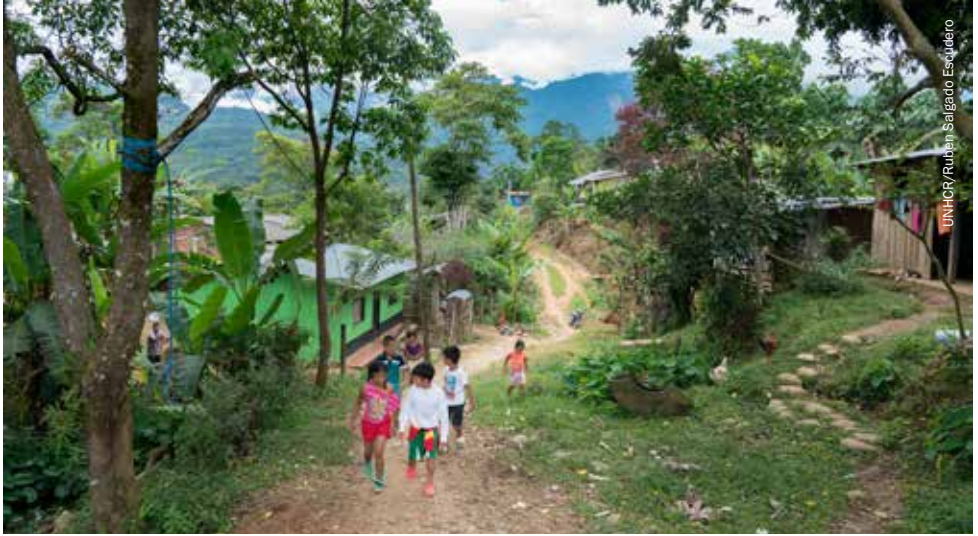
Displaced community in Colombia.