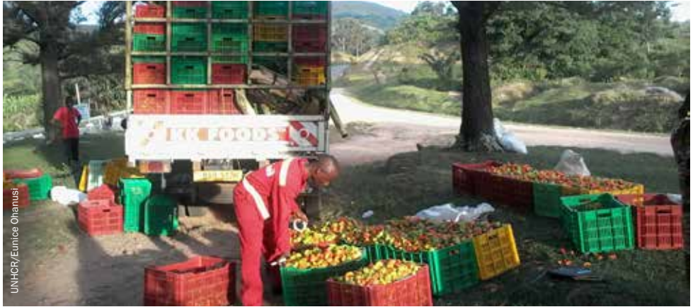
Fresh produce exporters load the chilli peppers they have bought from Congolese refugee farmers at Rwamwanja settlement in Uganda.

craftsmanship among Ugandans provides a helpful market opportunity. These Congolese refugees find mutually beneficial economic links with Ugandan merchants; these Ugandans have come to rely heavily on Congolese refugees, who act as the primary distributors and retailers for their products.