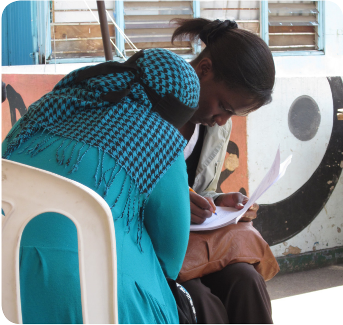
A research team member interviews a young woman refugee from Somalia in Nairobi.

1. Three field assessments of urban refugee populations in Nairobi, Kenya; Cairo, Egypt; and Panama City, Panama, conducted in 2012. Assessments included in-depth household interviews; focus group discussions disaggregated by age, gender and ethnicity; semi-structured interviews with local businesses, service providers and government officials; and project site visits. Two hundred and thirty seven refugee youth were consulted; 125 females and 112 males.