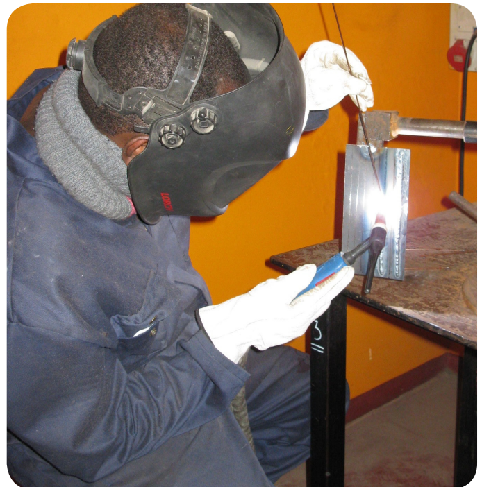
A refugee youth learns welding, a popular training option for work in the informal economy, at Don Bosco's Vocational Training Center.

Though humanitarian agencies may recognize the importance of youth participation in program design, management, monitoring and evaluation, few manage to implement such an approach. Participatory programs are labor intensive for service providers, and adult decision-makers rarely consult or engage youth in a systematic