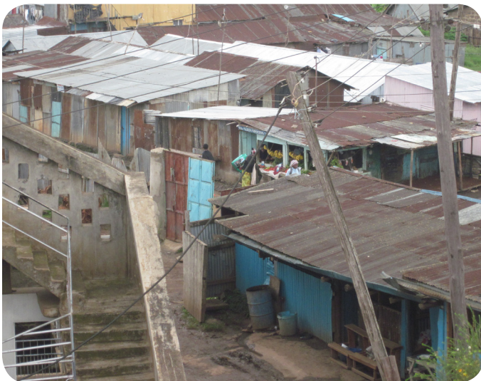
Refugees in Nairobi typically live in slum areas such as the peri-urban neighborhood of Kawangware.

In 2010, 3.5 billion people lived in urban areas. 3 In addition to the periodic natural and man-made disasters