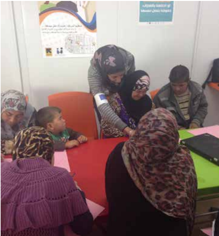
WPE staff conducting group activities with adolescent girls and boys with disabilities and their caregivers — Jordan

Preliminary data analysis was conducted at a country level during the field visits in 2013 to define appropriate pilot activities for implementation. This was followed by a more comprehensive data analysis in 2014 that looked for common themes between different countries and contexts. Thematic coding of group discussion and interview notes from Burundi, Ethiopia and Jordan was undertaken by two coders and analyzed against core research questions using NVivo software. Means were calculated by group and number of participants to minimize errors relating to different sample sizes between the three countries. Group discussion and interview notes were not available from Northern Caucasus, where local partners conducted the assessment, and were therefore excluded from thematic coding. GBVIMS data from 2012 and 2013 in Burundi and Ethiopia were analyzed using STATA to identify parallel themes in the quantitative data, and to locate significant relationships and variance between variables and within variable subcategories. 28