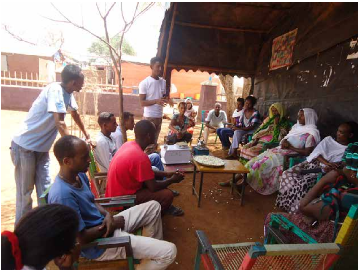
Coffee discussion, My'Ani Refugee Camp, Ethiopia

Held social events for girls with and without disabilities to strengthen peer networks.