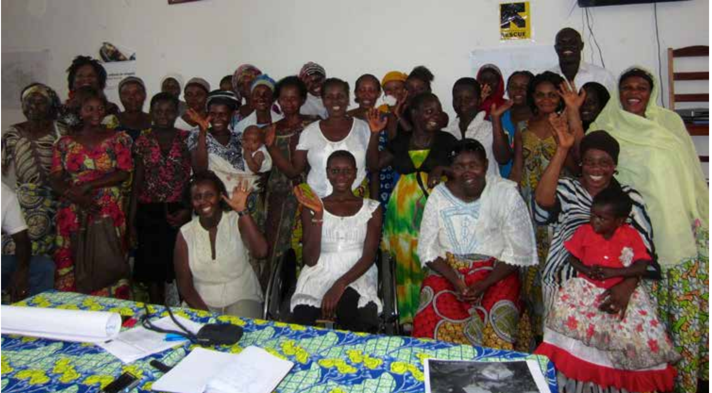
Stakeholder workshop in Burundi

a critical role in determining priorities for humanitarian action during conflict and displacement. The concerns particular to women and girls and all persons with disabilities should be front and center of any international agreements, as they are among the most vulnerable populations during crisis. Ongoing advocacy is required at international and national levels to encourage governments to sign on to and ratify all relevant instruments, and to hold all relevant actors accountable for full implementation of new and existing agreements, including the Convention on the Rights of Persons with Disabilities, the Convention on the Elimination of All Forms of Discrimination against Women and Security Council resolutions on women, peace and security.