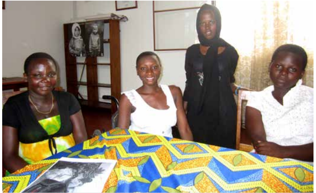
Group discussions with adolescent girls with disabilities — Burundi

The extreme stress experienced by families during conflict and displacement can create environments where violence is more likely to be perpetrated, placing persons with disabilities who are dependent on family