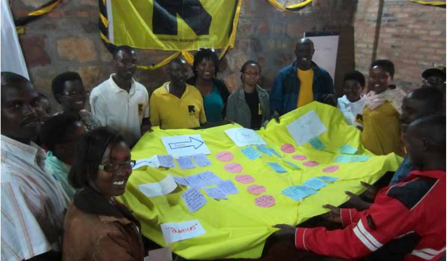
Participatory activity with GBV practitioners — Burundi