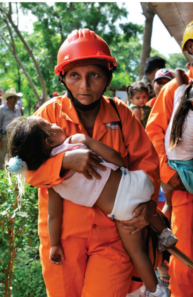
Preparing for disasters so they can save their communities ©2007 - Photo credit: AAA/Florian Kopp

DG ECHO continues to support preparedness in fragile, violent and conflict-affected situations through increased foresight, but requires that humanitarian interventions in these situations are designed and implemented by agencies who have the necessary technical skills and have knowledge of socio-economic dimensions, conflict dynamics and the local environment. In contexts where it is not feasible or acceptable to work with the national system, it is possible to support a local system, for example a consortium of NGOs, or local co-ordination mechanisms who have a continuing presence in the location and are able to address preparedness capacity gaps. DG ECHO prefers to support networks and NGOs that are already in place, or that are able to have a continuous presence as this helps to produce consistent preparedness benefits, even after the project funding period, and avoids recurrent preparedness expenditure.