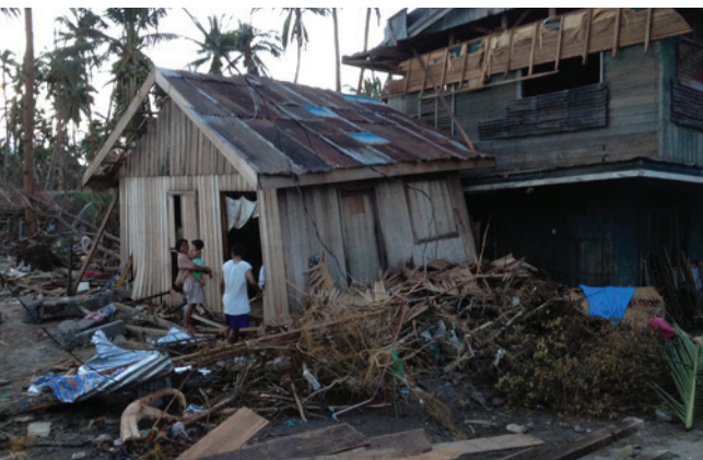
In the Philippines, cyclones and typhoons are so frequent that structural damage like this needs to be repaired before the next typhoon hits.

level rise, coastal erosion, salinification of groundwater, etc.) 48 . It is also threatening people's ability to maintain weather-dependent livelihoods (e.g. farming, herding or fishing). This could jeopardise the effectiveness of interventions themselves. As such, and in line with the risk-proofing approach discussed in Chapter 3, the climate resilience of preparedness and response interventions should be ensured from the outset.