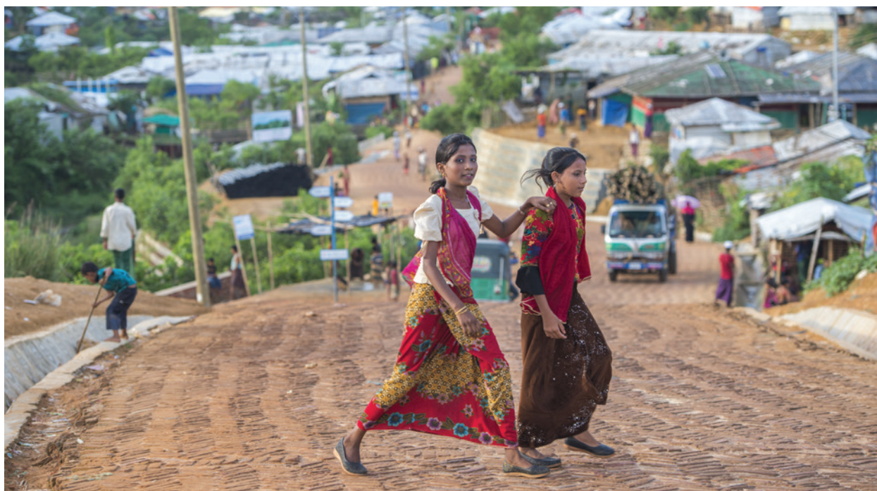
These camps in Bangladesh are prone to seasonal flooding, landslides and cyclones. The EU and its partners have established early warning systems, helped to reinforce houses to resist storms, and have taught disaster preparedness in local schools.

in a targeted preparedness action to address a shock unrelated to the action if this is hampering its implementation.