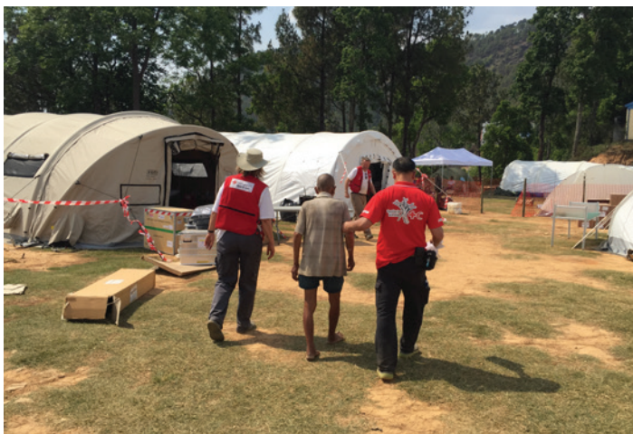
In Nepal, earthquake preparedness saved lives – and limbs.

assessment of risk and the intervention should seek to reduce immediate and future risks” (DG ECHO 2014, p.16).