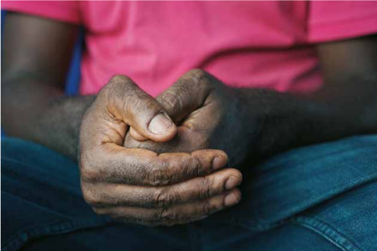
Shocking and widespread violence has forced hundreds of thousands of Ivorian families to flee from their homes, often able to carry nothing with them.