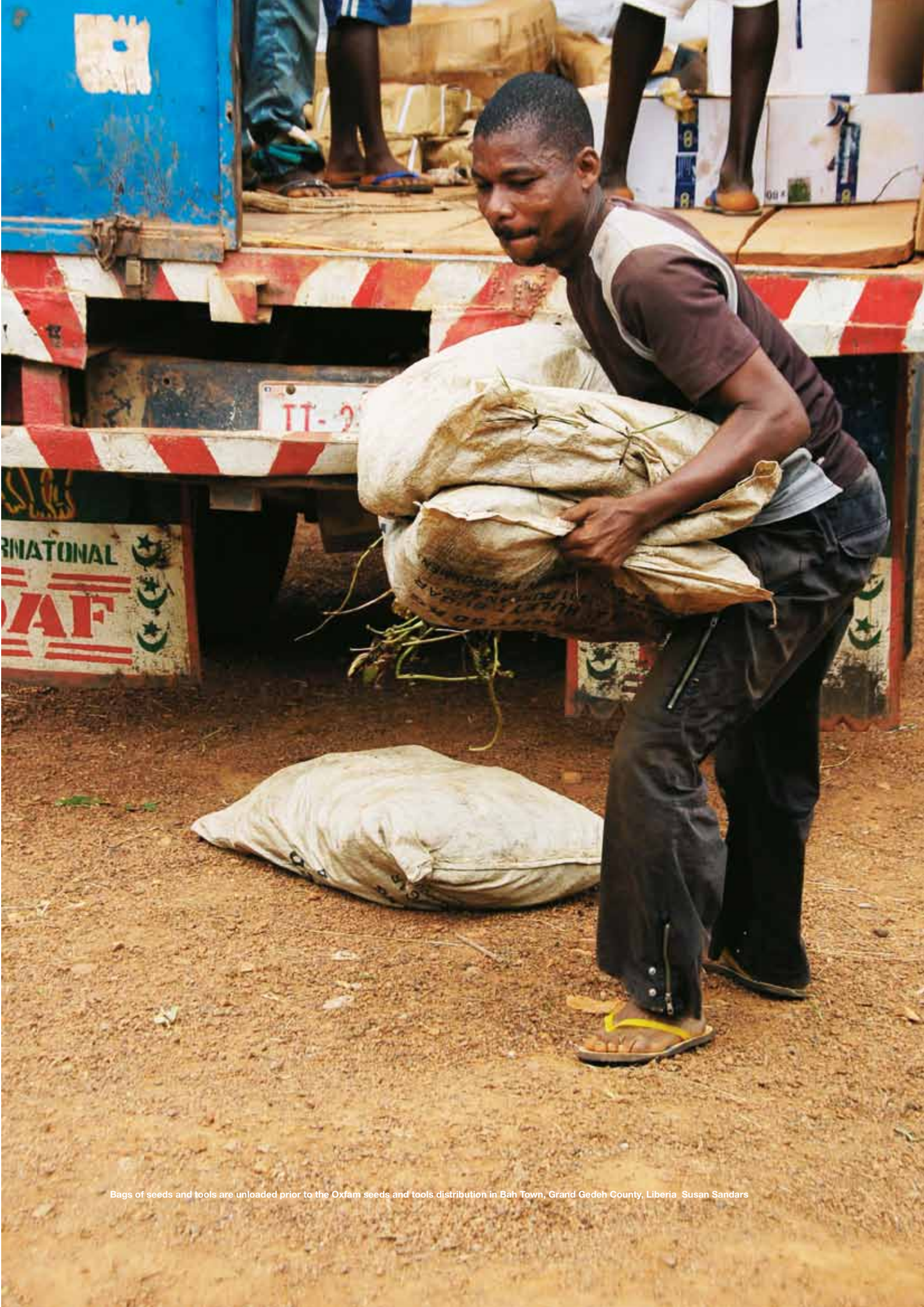
Bags of seeds and tools are unloaded prior to the Oxfam seeds and tools distribution in Bah Town, Grand Gedeh County, Liberia Susan Sandars