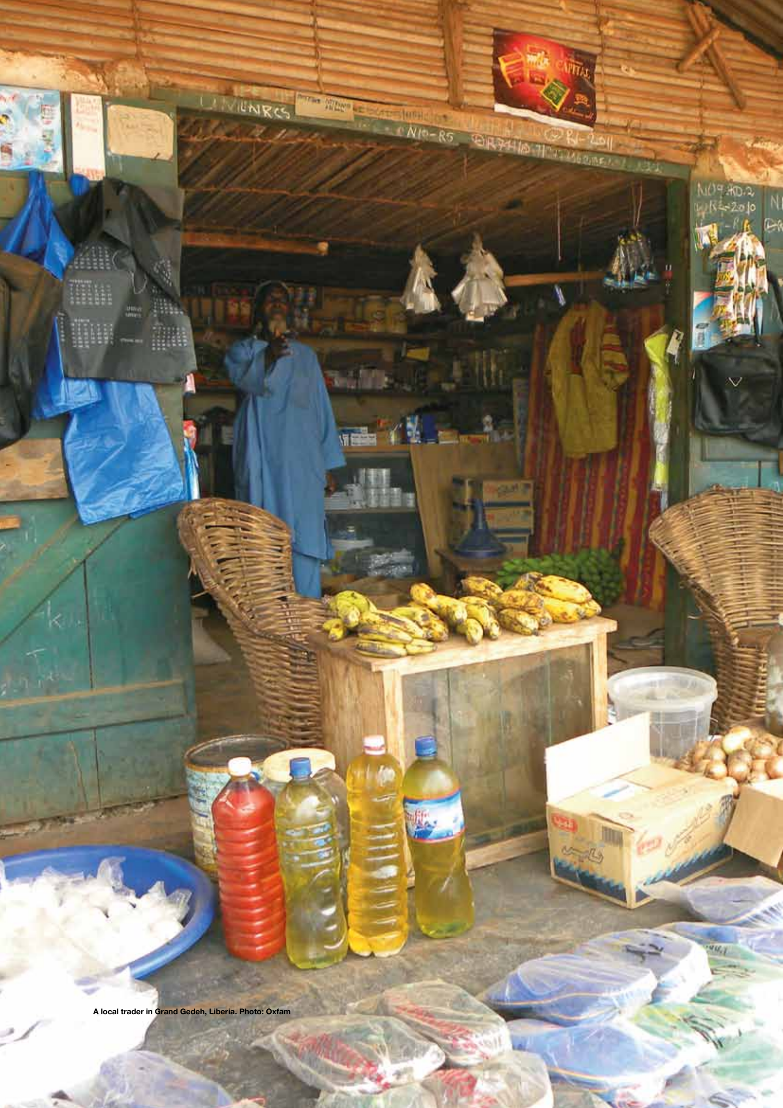
A local trader in Grand Gedeh, Liberia.