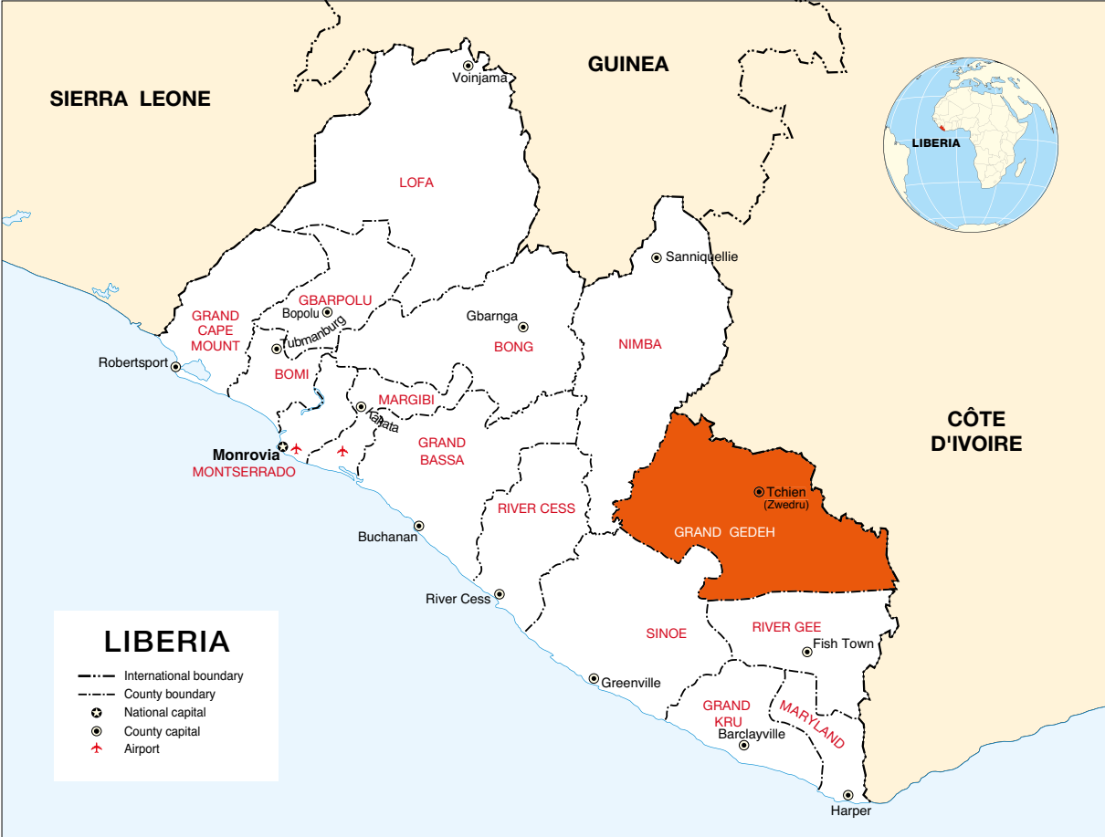
Map of Liberia's Districts

significant departure from other emergency response market assessments, in that, based on the value chain analysis principles, EMMA uses a combination of existing tools, from seasonal calendars to market system maps, to offer a systemic view of market interactions, both demand and supply, from the infrastructural and institutional environment to inter-regional or cross border trade. It combines market analysis (market functionalities, potentials and constraints) and gap analysis (people's uncovered needs) to develop a response analysis to inform programming. The EMMA toolkit allows for a rapid understanding of market systems, as it promotes rough and ready 'good enough' analysis, and is designed to complement other assessments that provide data about household profiles and expenditures. The toolkit can bring clarity and purpose to programming; allow the disaster affected population to access the most appropriate responses and support market functions and environments to supply basic immediate needs while keeping an eye on future development and self sufficiency.