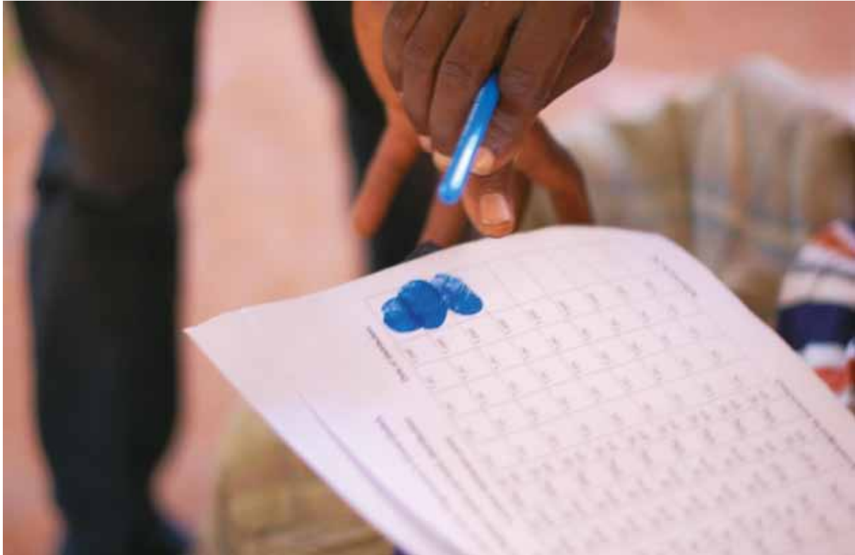
A beneficiary registers at Oxfam's seeds and tools distribution in Bah town, Grand Gedeh County, Liberia.