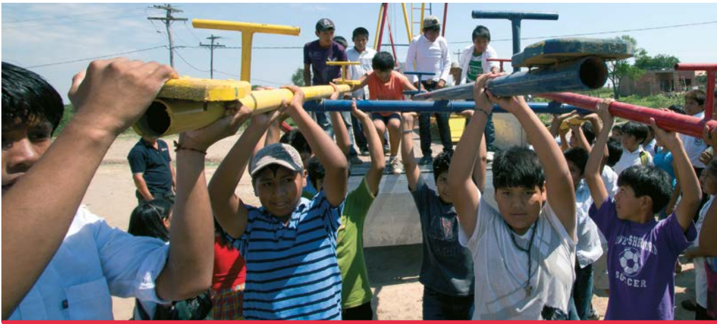
Creating a flourishing place in slums – to improve the living environment and citizen security in the neighborhood Mejicanos, Cordaid creates a sustainable recreational area in one of the most crime-ridden zones of San Salvador.