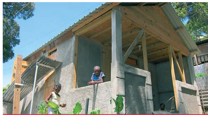
A new safe permanent housing model – together with the local Haitian authority, the Affordable Housing Institute and the Foyer Sainte Marie, Cordaid is introducing this new housing model in Port-au-Prince.