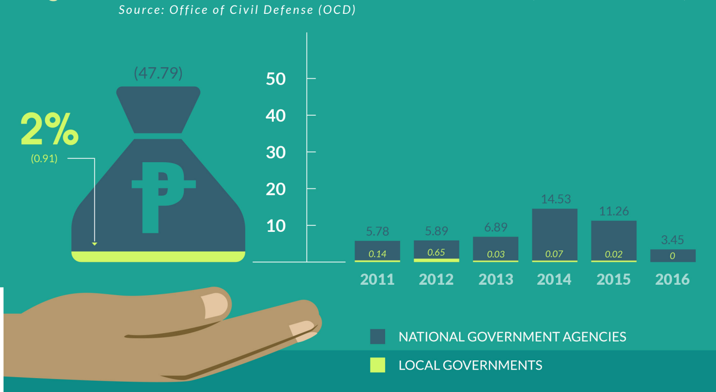
Figure 1: NDRRM FUND RELEASES FROM 2011 TO 2016 (IN PHP BILLIONS)

CfC's research identified the principal culprit: outdated DRRM Fund rules. Issued in 1999 through a National Disaster Coordinating Council (NDCC) Memorandum Order<sup>2</sup>, the rules imposed