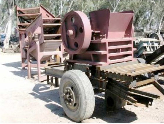
Locally manufactured mobile crusher in a Pakistan quarry.