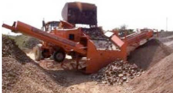
A primary screening feedstock for the removal of soil fraction and possible contaminants – plastics, paper, non-recyclables – before crushing.