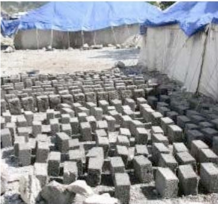
Building blocks for reconstruction purposes which can be produced from recycled building waste, Pakistan.