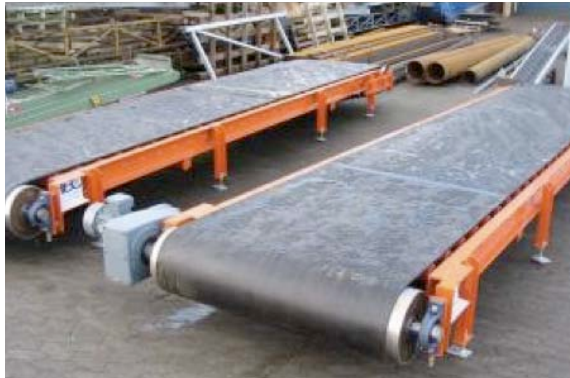
Typical conveyors with adjustable belt speed for use as a picking station.