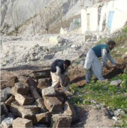
Islamic Relief project for the clearing and cleaning of building wastes (including rough cut stones) and subsequent re-use for new foundations .

The following sub-sections present some typical forms of handling and processing building waste – mainly in connection with centralised waste management programmes – from its location at source to final end-use or disposal.