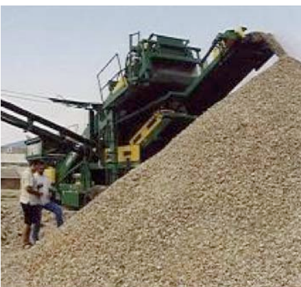
Recycled aggregate from crushed building waste in Kosovo, as used for road construction or low strength concrete foundations.