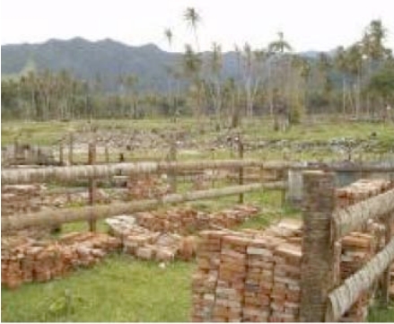
Stacked cleaned bricks ready for re-use at the Oxfam GB re-use/recycling yard in Banda Aceh.