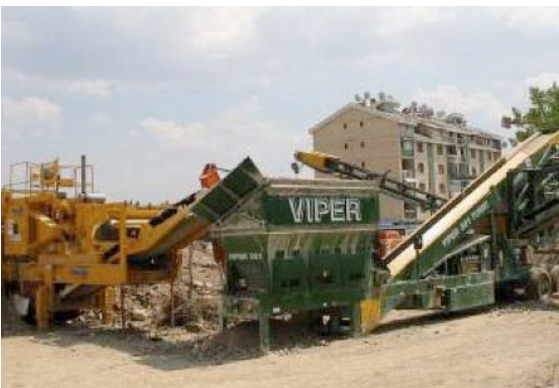
Crushing of building waste in Kosovo using a medium-sized mobile crusher (yellow machine to the left) and a screening unit for separation of the crushed material into three size fractions (green plant to the right).