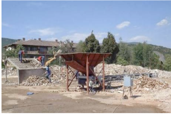
A mechanical “grizzly” to the left sorts finer materials from the oversized concrete and bricks, after which large items can be placed on a picking station (to the right) for manual separation.

Should a larger throughput be required, then a more sophisticated primary screening unit can be used to remove the finer soil fractions from the building waste. These units are highly mobile and only require a single axle truck to move around the site.