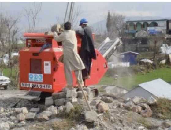
Crushing of building waste in Pakistan following the 2005 earthquake, using a small, mobile hand-fed crusher on tracks.