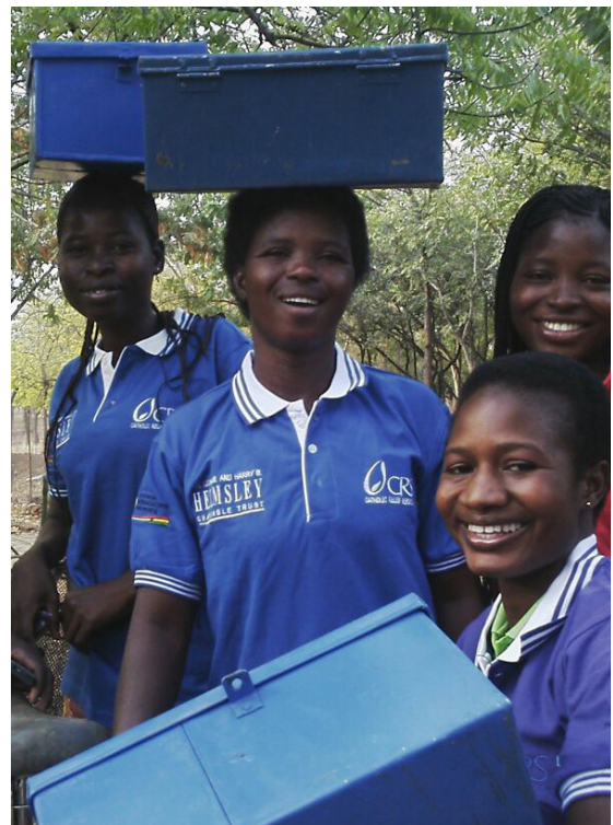
Trained field agents showcasing their SILC boxes, Nabdram district - Upper East Region