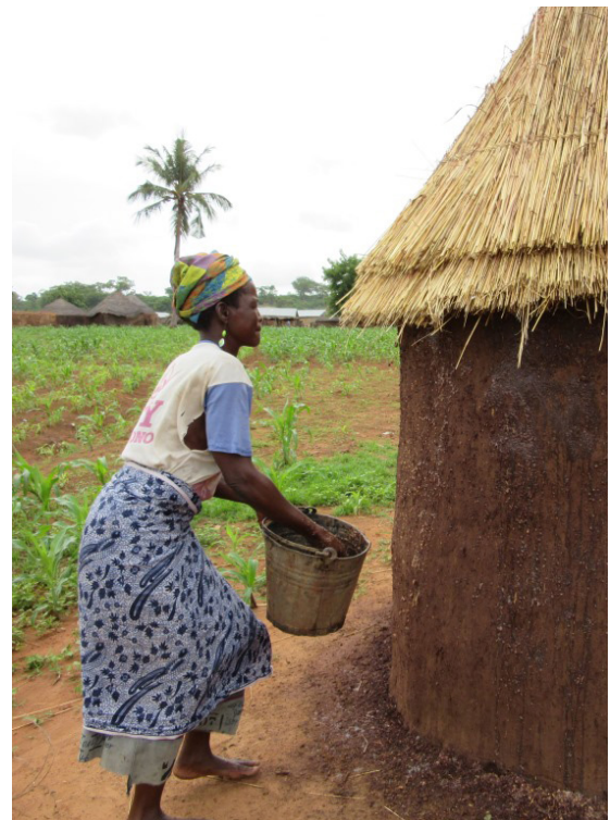
SILC member accessed loan to construct household latrine in Tichiritaaba -East Mamprusi District, Northern Region