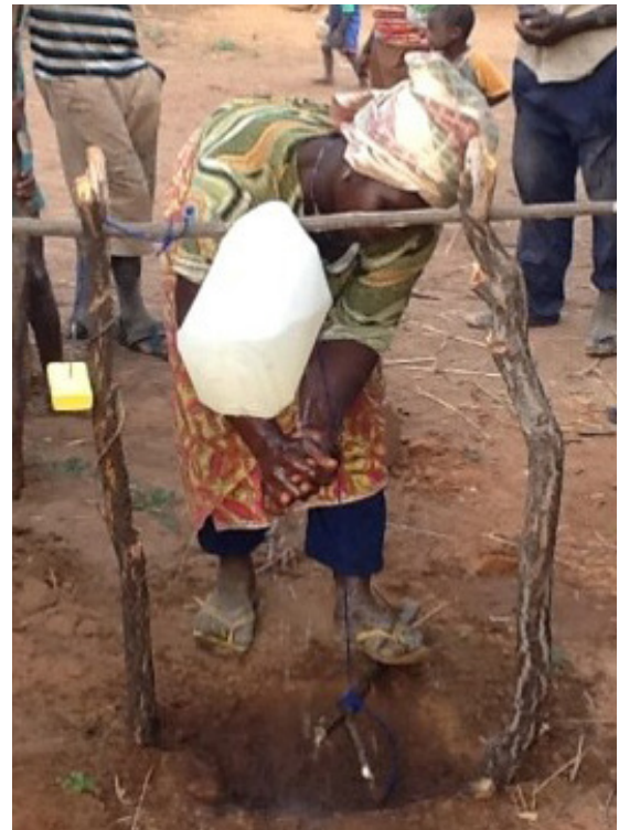
Photograph 4. SILC household empowered to construct hand washing device-Talensi District

The SILC methodology has facilitated greater social cohesion among members and helped vulnerable women to resolve their economic and social issues. It has further led to increased financial inclusion through an enhanced market-based strategy led by Private Service Providers, whose provision of services in exchange for fees increases the SILC model's sustainability. SILC offers an ideal platform for integration of WASH initiatives by enabling communities to mobilize funds and access loans to construct household latrines, and repair boreholes to ensure continuous access to safe water. In addition to providing opportunities for savings and investments in WASH services, the SILC groups are used to disseminate sanitation and hygiene behavior change messages.