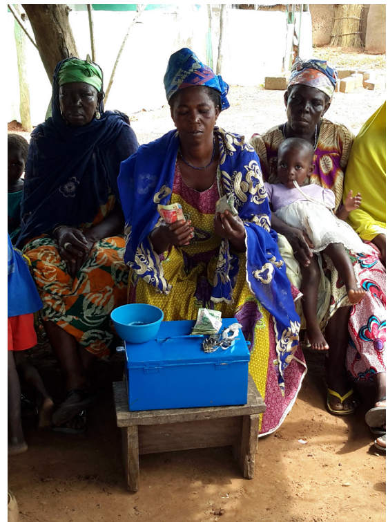
SILC group meeting in Gbangu community-Northern Region

CRS empowered community members to solve these issues principally through two interventions: First, community members were encouraged to participate in SILC. Second, the project piloted a comprehensive approach to sanitation through community-led provision of latrines and hygiene education, using tippy taps 2 and training on local soap production in three out of the 138 communities targeted. Together, SILC and sanitation interventions ensured an environment free of open defecation, as well as a quality learning environment to enhance knowledge retention by students in school.