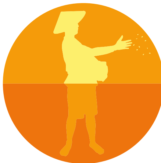
WOMEN ON AVERAGE MAKE UP ALMOST HALF THE AGRICULTURAL LABOUR FORCE IN DEVELOPING COUNTRIES