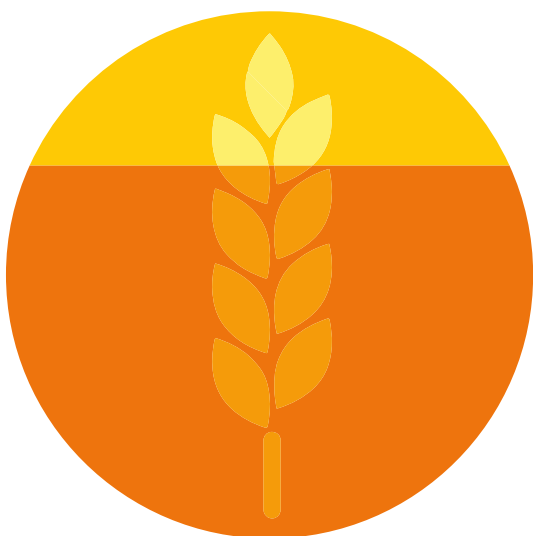
AT LEAST 70% OF THE WORLD’S POOR PEOPLE LIVE IN RURAL AREAS

Indeed, women are more likely to be food-insecure than men in every region of the world, especially in a context of increased reliance on markets. Poor female smallholders face discrimination and barriers to accessing resources, education, and services. But when women enjoy the same access to resources and services as men, this enhances agricultural productivity, to the benefit of society as a whole.