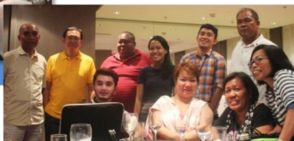
Participants during Day 01