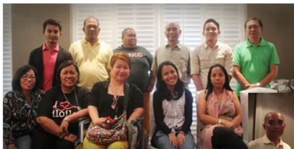
Participants during Day 02