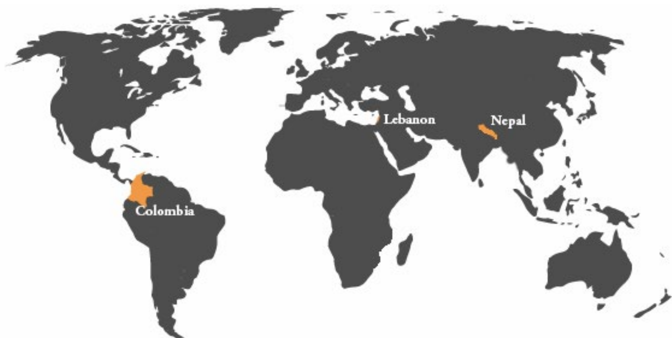
FIGURE 2: COUNTRIES SELECTED FOR FIELD VISITS