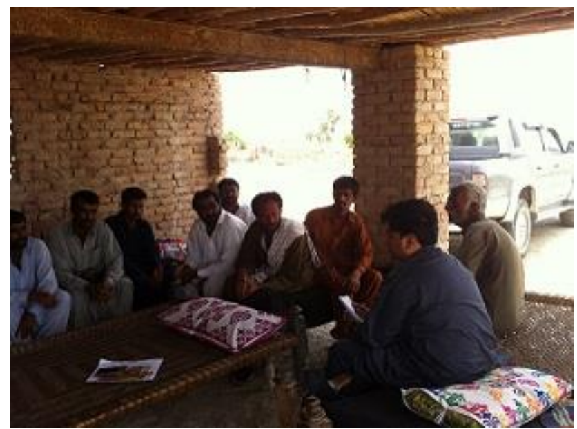
Figure 3: Focus Group Discussion in Progress Details of the FGDs conducted are provided below:

FGDs were conducted with specific groups of the benefitting communities such as beneficiary men and women, WASH Management Committees (WMCs) etc. The discussions topics were related to the status of WASH in the communities, how communities feel about the project intervention and the implementation and if there are any gaps. In addition, communities were encouraged to suggest any improvement to the project design or future implementation . The detailed questionnaire is provided in Annex E.