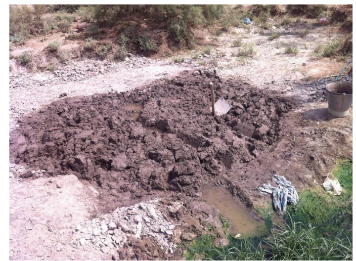
Figure 10: Overflow Water from Hand Pump Used for Soaking Mud for Plastering