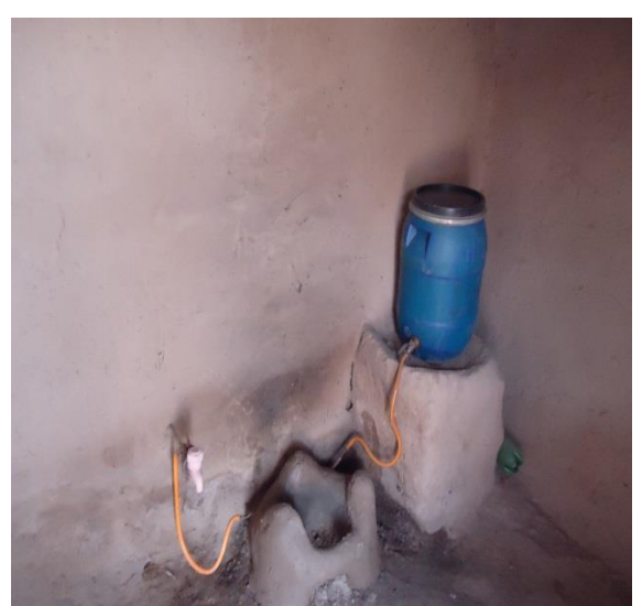
Figure 12: Example - Chuli Filters Not Used