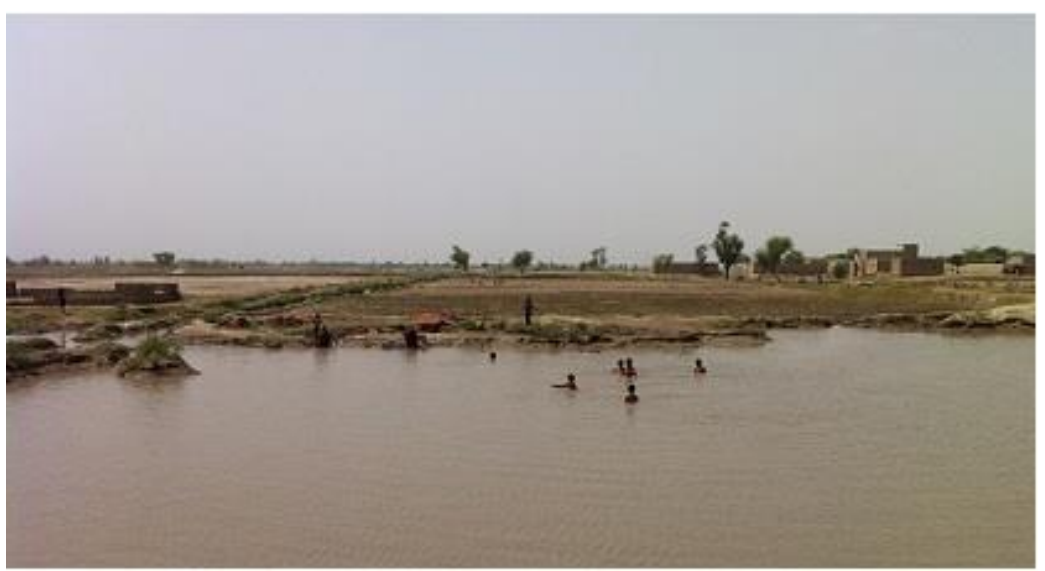
Figure 5: Non ACF Intervention Village - Women Washing Cloths and Dishes / Children Bathing in Stagnant Water

"Before ACF provided hand pumps, we would travel ½ Km to fetch water. The women would travel on foot and men would use cycles or motor cycles."