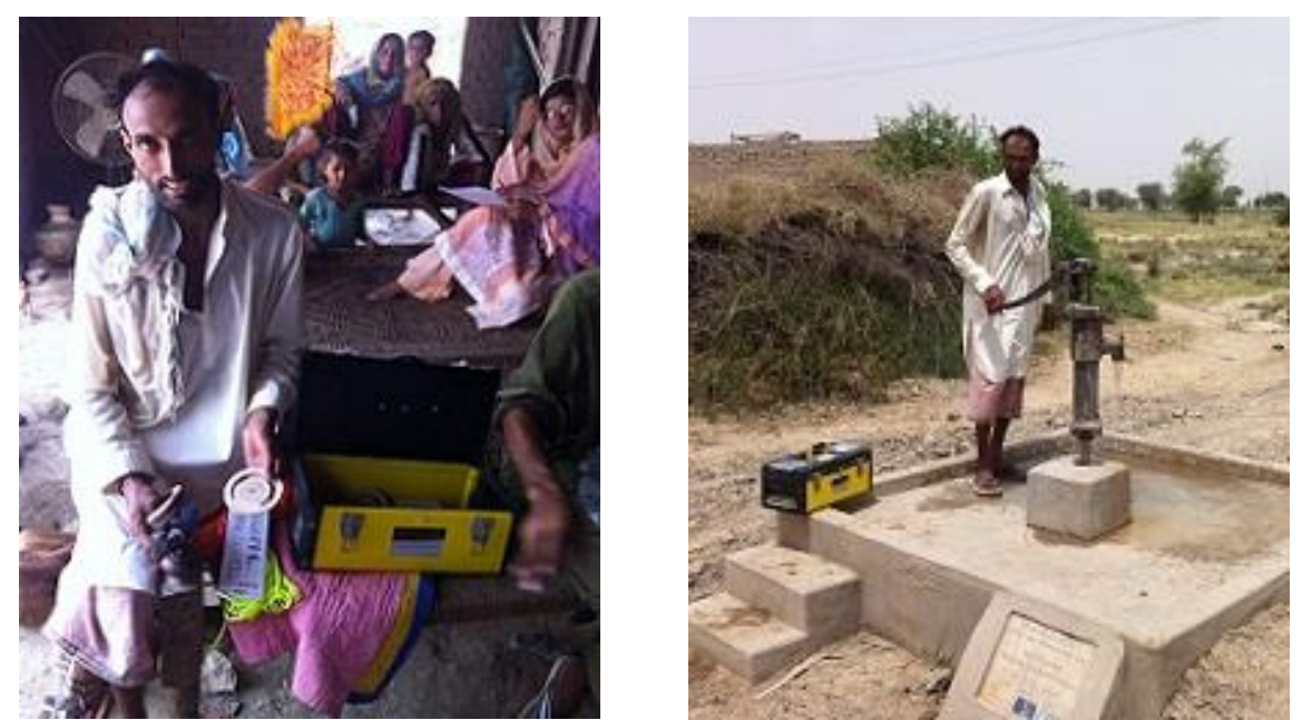
Figure 14: Community Willing and Equipped to Maintain Hand Pumps

In FGDs the communities identified hand pumps as an intervention which appears to have the greatest potential for longer term impact and it seems more effective than latrines and Chuli Filters in improving their health conditions.