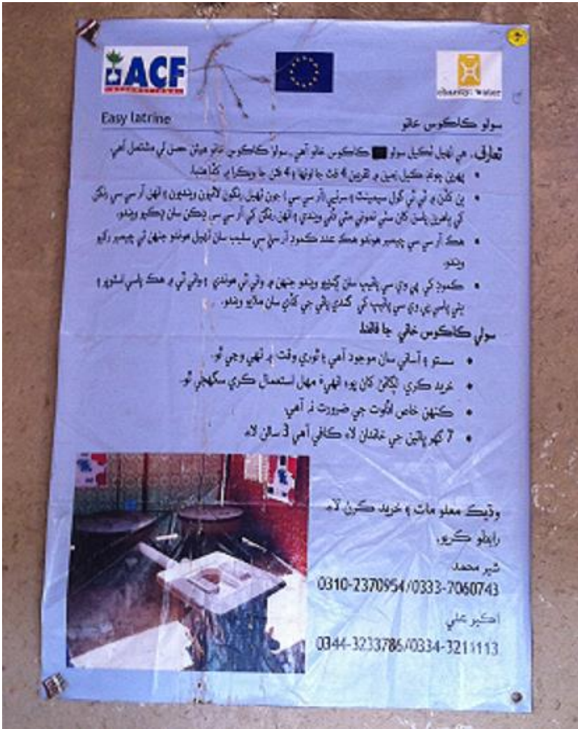
Figure 15: Easy Latrine Information Chart in Local Language

Apparently, there is no connection between vendors and the communities, so the vendors have stopped constructing latrine rings and displaying commode or any other sanitary items at their shops. Therefore, the sustainability of the SanMark component could be impeded.