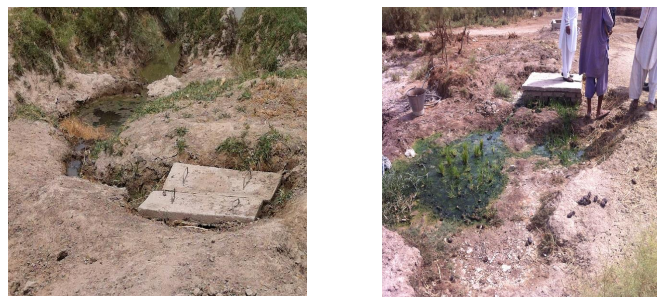
Figure 9: Over Flowing Soakage Pits

The overflow from HP could have utilized for cattle drinking or some vegetation in the vicinity could have been encouraged. Currently, the soakage pits are overflowing with water at many sites. For instance it was noticed that people are using this overflow of water for preparing mud for plastering their homes.