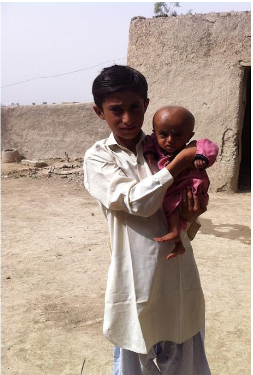
Figure 16: A Malnourished Child in the Intervention Area