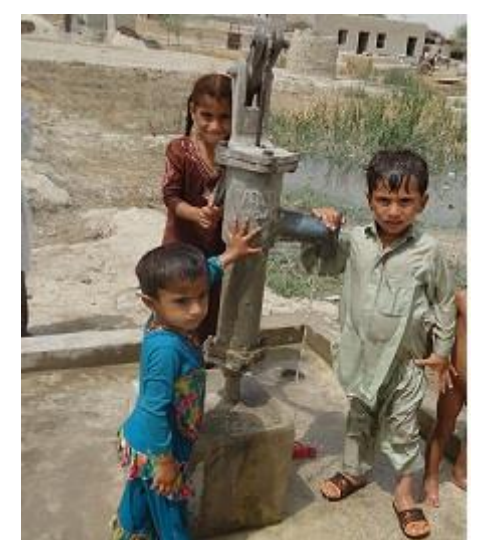
Figure 8: ACF WASH Interventions Accessible to All

On world toilet day a session with school children was organized by ACF, over 500 students both boys and girls participated from schools across the district. In that session, easy latrine model was displayed, students debated on topics around latrine use and hygiene. In addition,