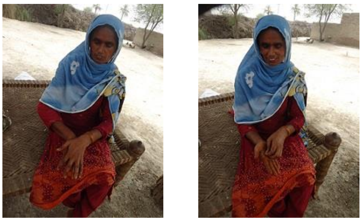
Figure 11: A Women Demonstrating Key Steps of Proper Hand Washing

The project effectively engaged communities in the activities such as digging of the pits for easy latrines and in Chuli Filter installation. Households engaged in Chuli Filter installation were paid PKR 200.