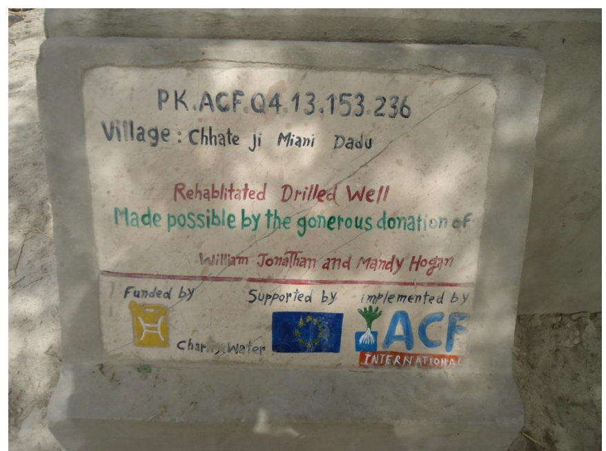
Figure 17: The Rehabilitated Hand Pump Clearly Shows Unique ID and the Individual Donor Name

Every single hand pump installed or repaired had a unique identification code assigned. This seems to be excellent practice in order to show accountability to the donors. The codification was thorough and comprehensive to the extent that even the individual donor name was reflected on the hand pump.