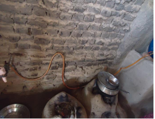
Figure 13: Example – Chuli Filter in Use

WASH Management Committees (WMCs) are helpful in maintaining hand pumps and facilitating Chuli Filters. The communities are trained in the repair of hand pumps and are provided with maintenance tool kit. During the field visits, it was witnessed that the communities have already carried out repair of the hand pumps in many instances. This shows that the communities are utilizing the skills and tool kits for maintaining the infrastructure provided. Overall, the community is really appreciative of the hand pump intervention.