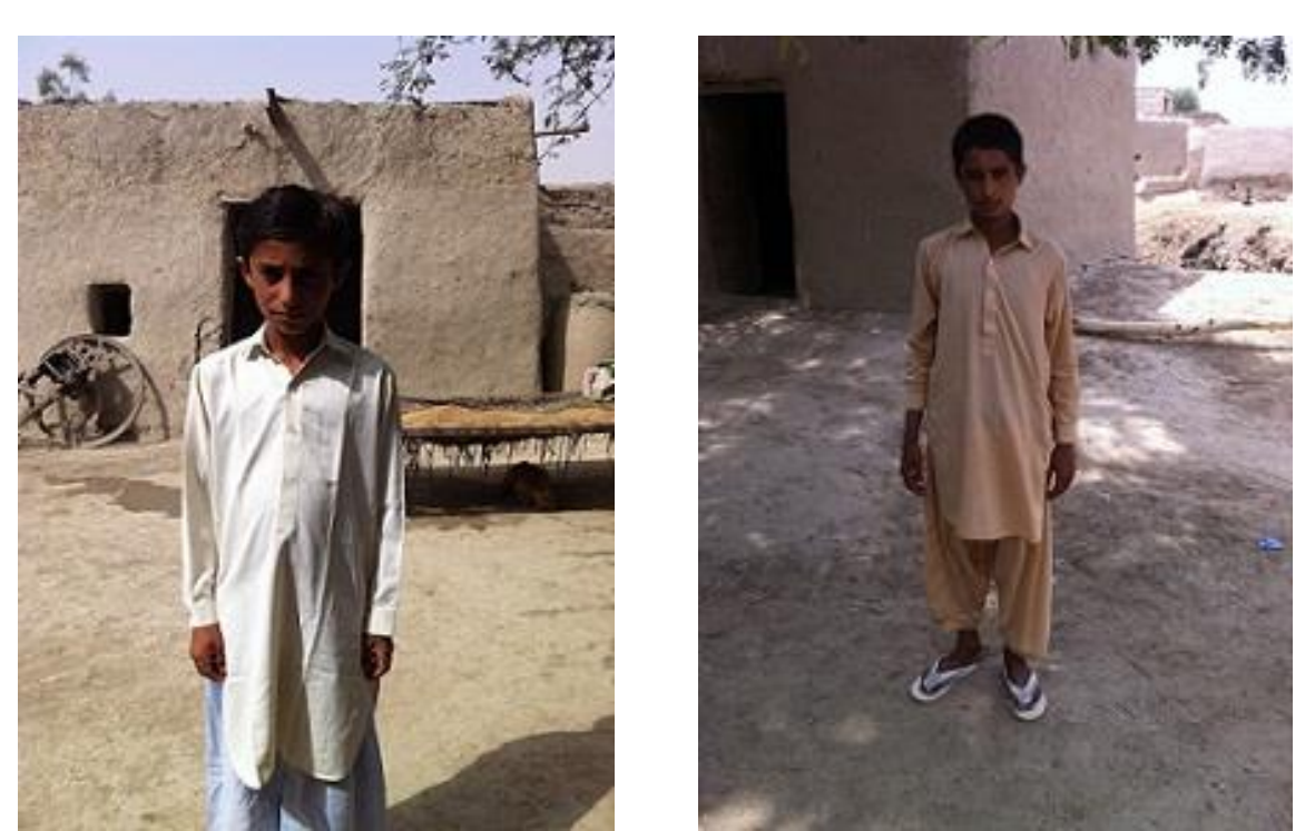
Figure 6: Children Proudly Mentioned Occasionally using Warm Water from Chuli Filter for Bathing Before Going to School in Winter

"In winter, I regularly took a bath with warm water from Chuli Filter before going to school."