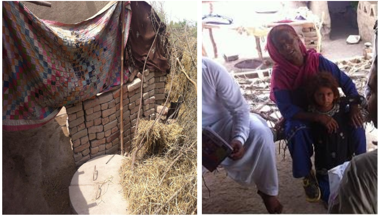
Figure 7: Proud Owner of Easy Latrine

"I am a widow, I am very thankful to you (ACF) for providing hand pumps in our village and for providing latrine (easy larine) in our house. My children and I use it."