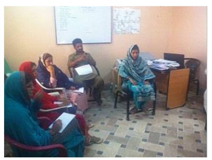
Figure 2: Discussions with ACF WASH Field Staff

A detailed list of the interviewees is provided in Annex C.