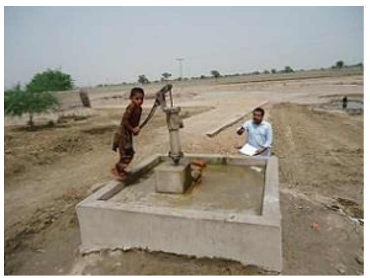
Figure 4: Checklists are being Completed

Besides KIIs and FGDs, customized checklists were used to document observation regarding HH latrine condition, soap / ash or any other item availability for hand wash and capture HH feedback regarding latrine usage. The consultant also documented observations regarding HH Chuli Filter and obtained HH feedback regarding usage of the filters. Finally, the consultant also documented observations regarding Hand Pump condition and utilization. Any environmental impact of these interventions was also noted. Three checklists to cater for each key type of ACF intervention i.e. Hand Pump, Easy Latrine and Chuli Filter were completed per village. A total of 83 checklists were completed. All data collection tools including checklists are shared in Annex E of this report.