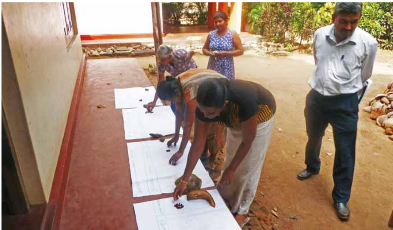
Community assessing Oxfam's accountability to them, Matara, Sri Lanka