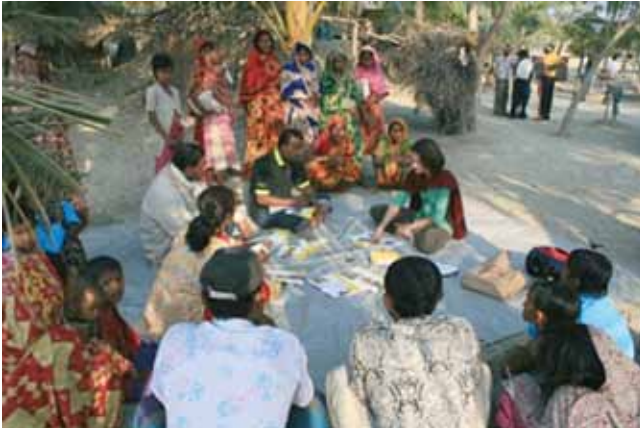
Testing images with community in Bangladesh.

As part of the ECB (Emergency Capacity Building) project, Oxfam GB designed a series of communication materials to be used in communities. The ECB is a network of NGOs who work together to improve the speed, quality, and effectiveness of the humanitarian community to save lives, improve welfare, and protect the rights of people in emergency situations.