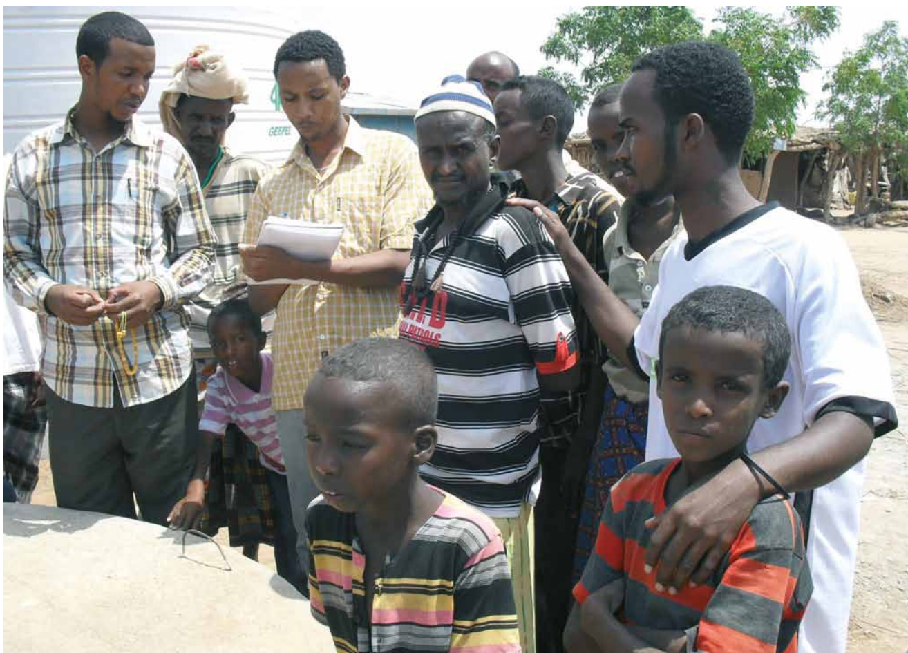
Community giving feedback to MEAL Officer at Shinile, Ethiopia.

The discussion groups might not also include more marginalised members of the community – for example those who work in the home might have difficulty attending, and the elderly or disabled might be physically unable to. However this will be addressed by exploring other, parallel methods to seek feedback and complaints from different groups.