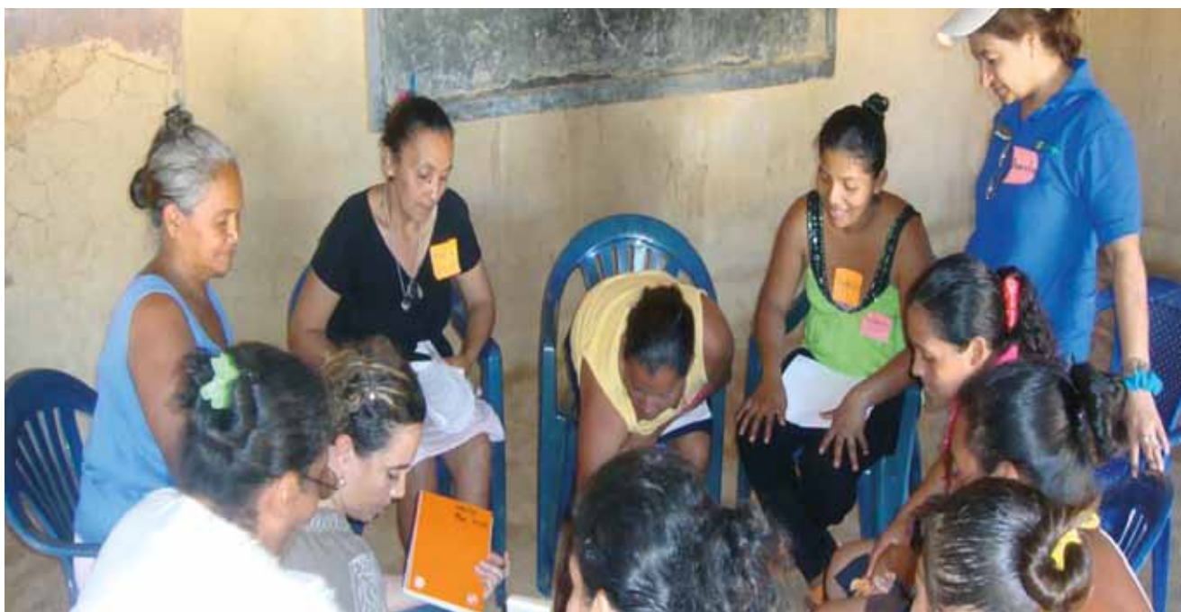
Community feeds back on Oxfam's accountability, Somotillo, Nicaragua

Adapted from 'Save the Children's video 'Setting up a Complaints and Response Mechanism'. Please use in conjunction with OGB Public Complaints Policy and Guidelines for Implementing Oxfam Public Complaints Policy in the International Division.