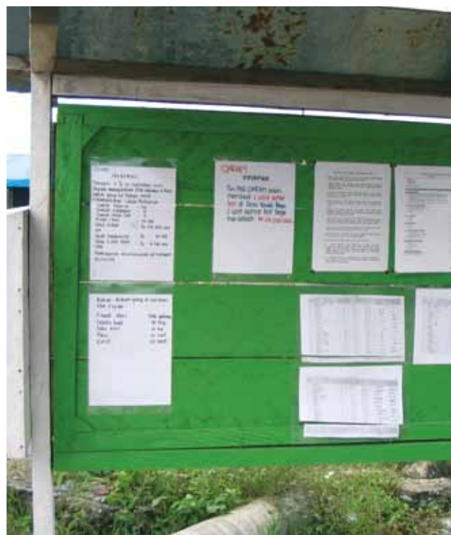
Information board at Manmota, Indonesia