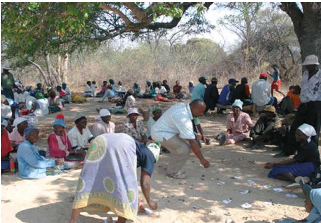
Facilitating a community discussion in Chirumanzu district of Zimbabwe: Photo: Blessing Mutsaka

Project monitoring and evaluation activities for the Oxfam programme in Zimbabwe rely heavily on feedback from beneficiaries and the community as a basis for measuring project performance and impact. Beneficiary communities also participate through participatory targeting and selection of beneficiary households. The food and non-food aid programme in Shurugwi, Kwekwe and Chirumanzu carried out a targeting process where the community was responsible for selecting who would benefit from aid using local indicators with the facilitation of Oxfam staff.