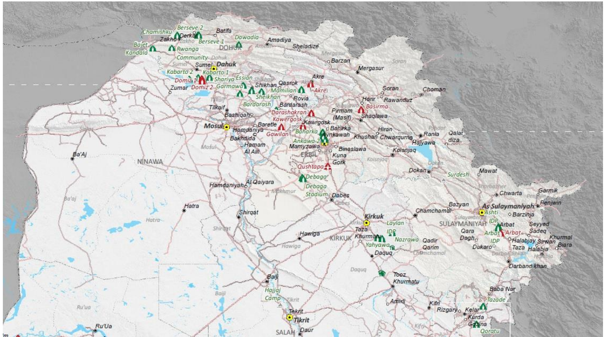
Northern Iraq and KR-I: Refugee (red) and IDP (green) locations, July 2016