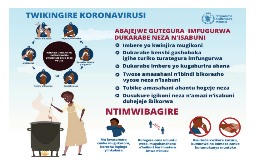
Figure 4: Guidance for safe school meal production during COVID-19 in Burundi