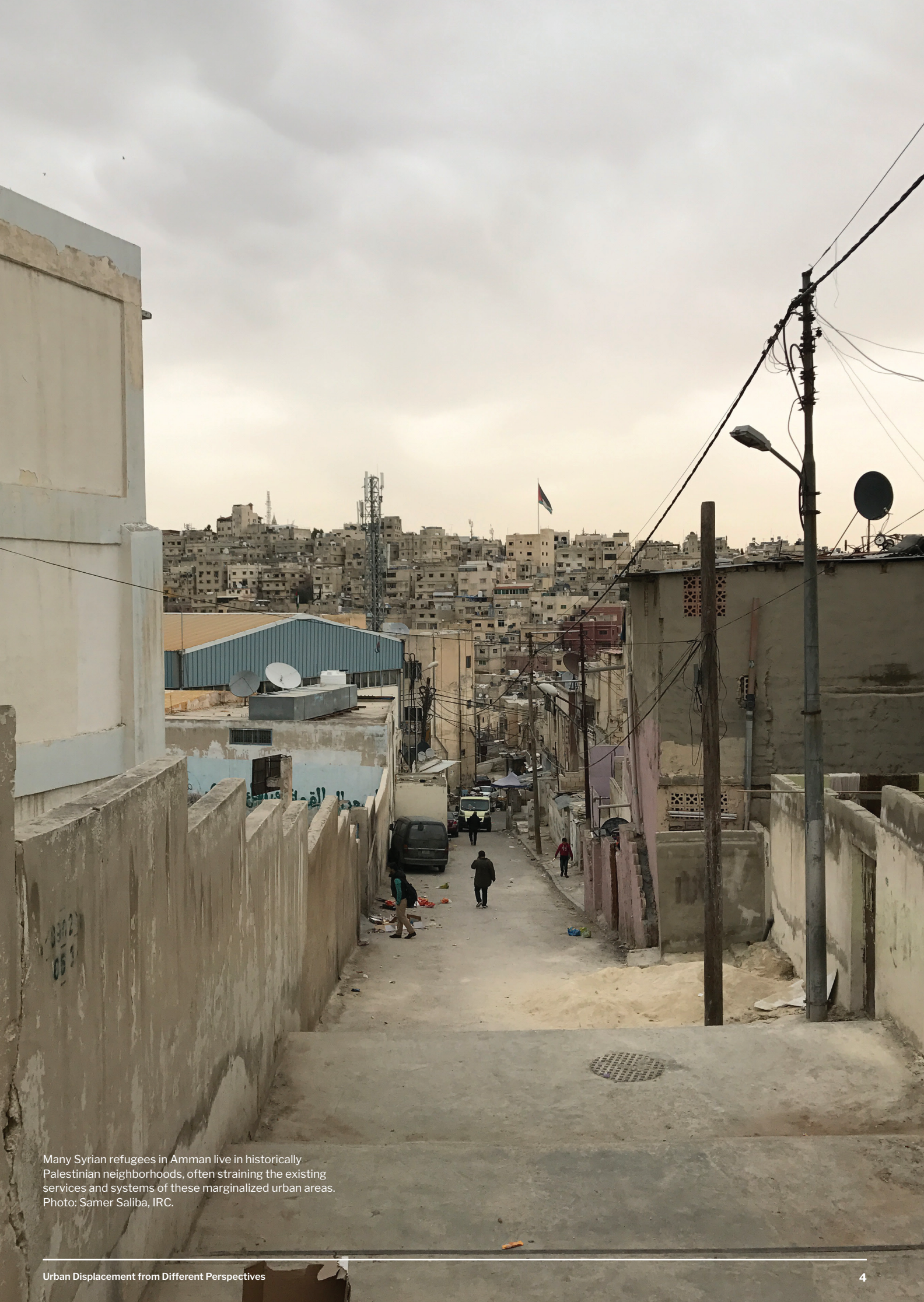
Many Syrian refugees in Amman live in historically Palestinian neighborhoods, often straining the existing services and systems of these marginalized urban areas.