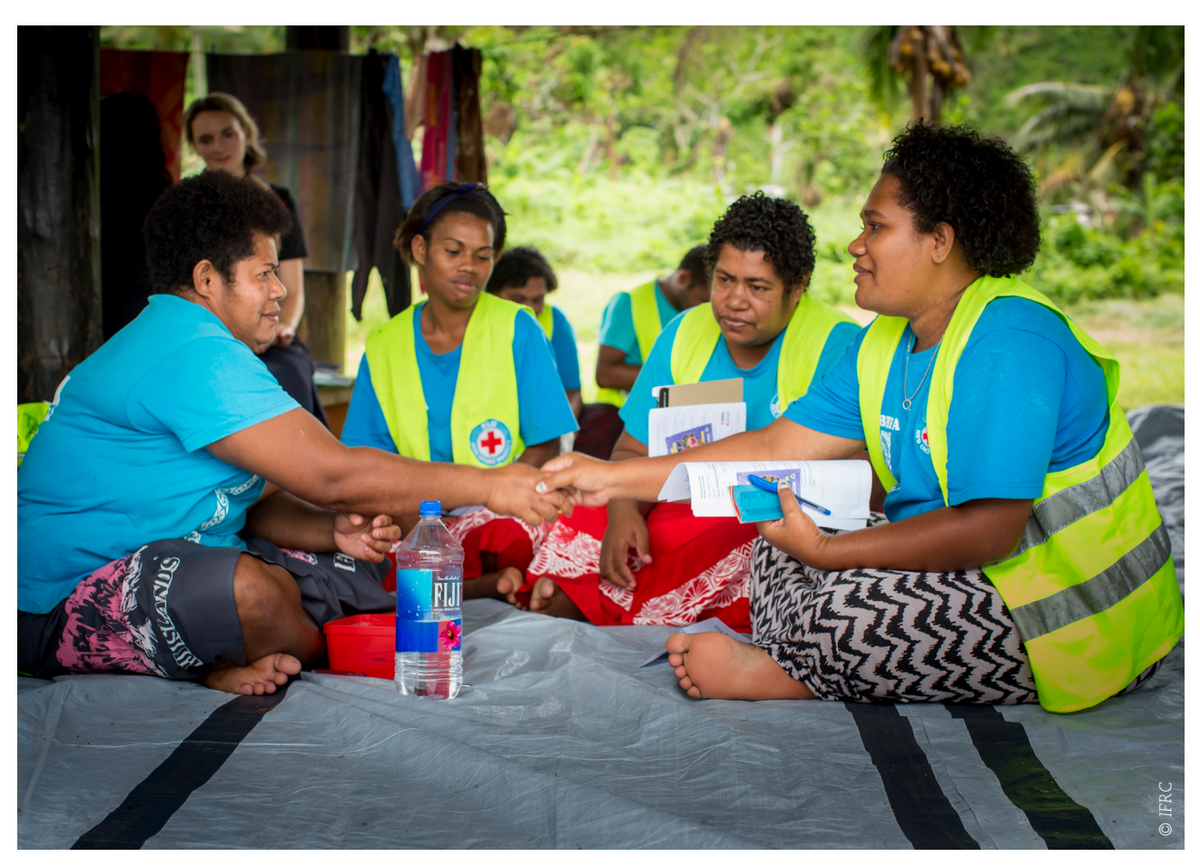
Psychosocial support provided by Red Cross volunteers in Fiji to people affected by Cyclone Winston, 2016.

These assumptions were then tested against the perspectives of Movement members from across the globe – including staff, volunteers, and community members. Experiences and perspectives were gathered through remote and in-person key informant interviews as well as in-country workshops convened in Sudan, Burundi, Malawi, Nigeria, Ukraine, and Italy.<sup>10</sup> In-country workshops focused on identifying the barriers and enabling factors that advance or hinder efforts to mainstream community-led approaches within the National Society.<sup>11</sup>