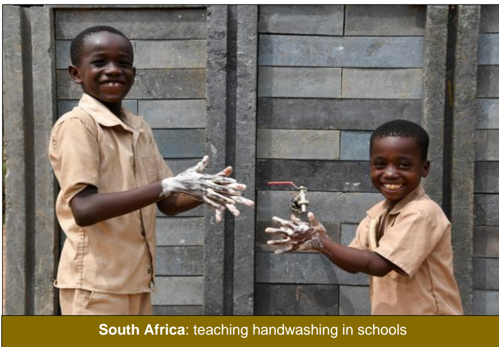
South Africa: teaching handwashing in schools

Hotlines for children: In South Africa, UNICEF has supported a national telephone hotline that offers psychosocial support to vulnerable children, and has decentralized the system to provincial level, with funding for child counselling in local languages. This was perceived as providing much needed space for addressing the psychosocial effects of COVID-19.