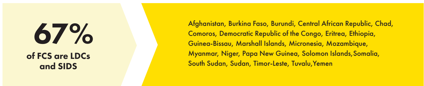
Figure 2. Fragile and conflicted affected LDCs and SIDS.

Obstacles to securing climate financing for projects in FCS include weak government institutions and financial management processes that do not meet rigid accreditation standards. 6 As a result, these obstacles translate to funding gaps for vulnerable communities. For example, our own analysis reveals that within the ten most fragile states, only $223 million was received in climate adaptation financing for 2021. 7 In contrast, $28.3 billion was mobilized for climate adaptation financing in the same year. 8