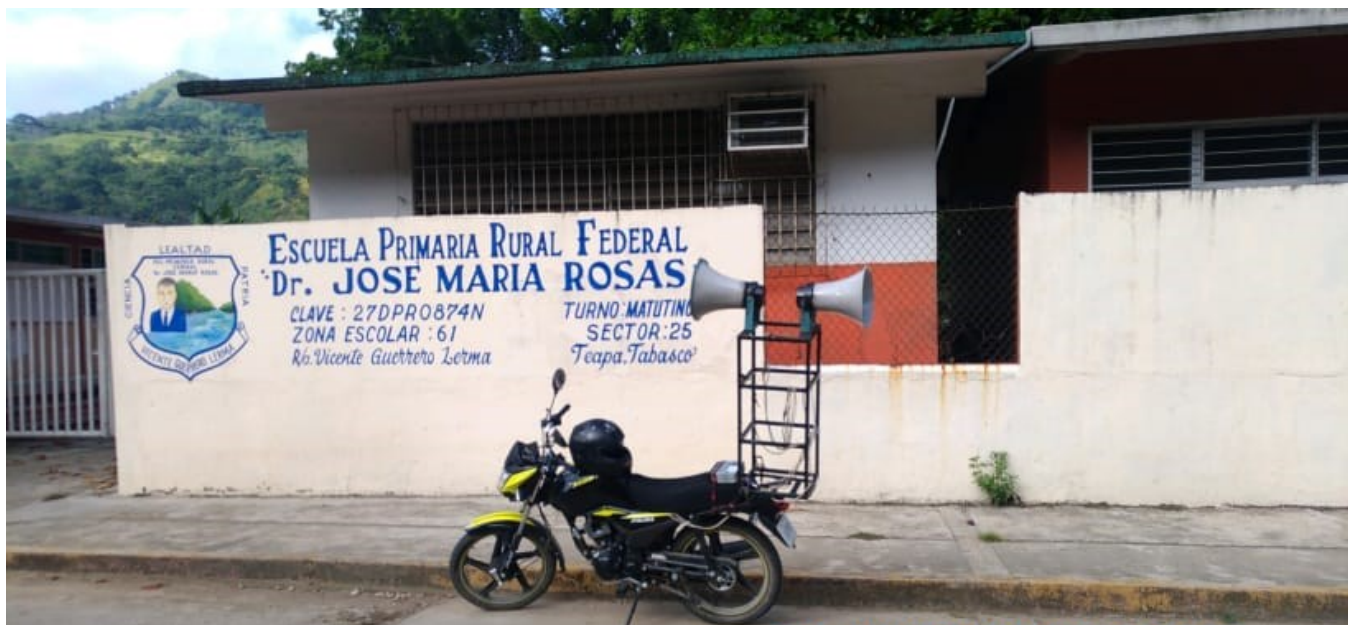
Louderspeaker that transmitted the audio through the community Vicente Guerrero “Las Nieves”, Teapa Tabasco.